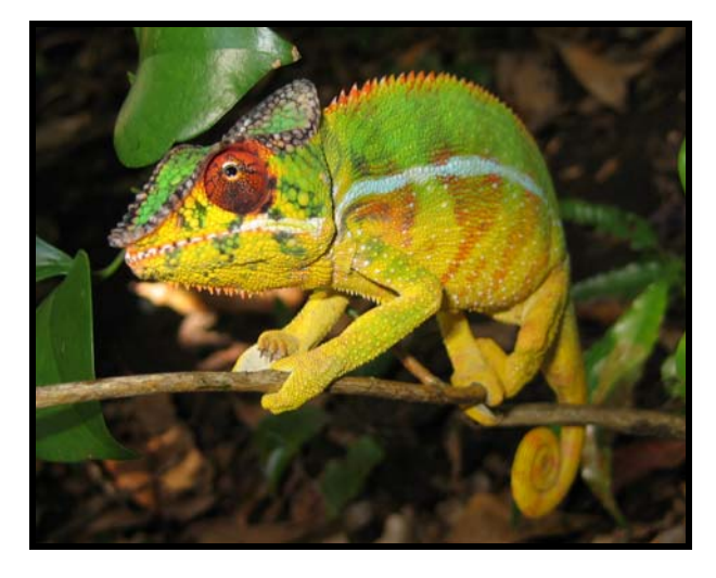
FIGURE 3. The chameleon Furcifer pardalis , commonly encountered throughout the massif Montagne des Francais in northern Madagascar, including the mangrove system.

Species recorded by previous surveys.—Only 13 species have been previously reported from Montagne des Français (with almost no information provided on their altitude, habitat or seasonal occurrence within the massif): Dromicodryas quadrilineatus, Heteroliodon fohy, Bibilava martae, Mantella viridis, Paracontias hildebrandti, Paroedura lohatsara, Paroedura stumpffi, Paroedura sp., Sanzinia madagascariensis volontany, Stenophis granuliceps, Stenophis inopinae, Trachylepis tavaratra and Zonosaurus tsingy (Ramanamanjato et al. 1999;