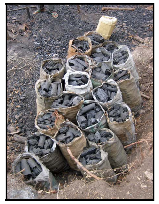
FIGURE 4. The result of charcoal production in Montagne des Français.

Conclusion. —The data collected in this study contributes to our current understanding regarding patterns of biodiversity of Malagasy herpetofauna by fully documenting the species composition of an unsurveyed site that has already been identified as a threatened area of high biodiversity requiring full protection (ANGAP 2003; Glaw et al. 2005a,b; Ministère de l'Environment, des Eaux et Forets 2006; Robinson et al. 2006). The extremely high level of endemicity seen in the herpetofauna, at both the regional and national level, immediately emphasizes the importance of Montagne des Français as a biological refuge. Furthermore, many of the species encountered during this study appear to be dependent on forest habitat, and do not appear to thrive in degraded or more open habitats. Only by conserving this area of forest will we be able to safeguard against future herpetological extinctions at this location. Moreover, we would like to reiterate the extraordinary conservation importance of this northern-