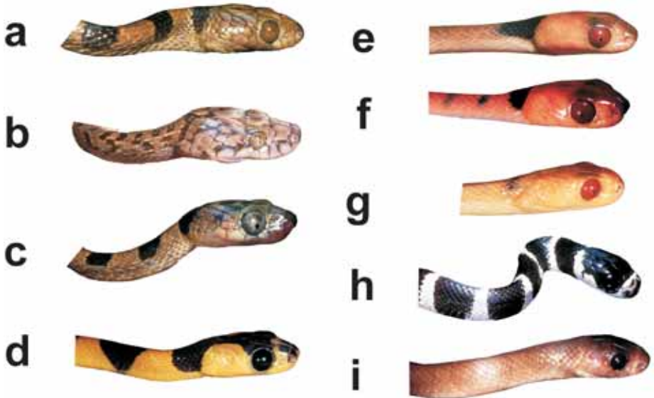
Fig. 3. Head portraits of species of Stenophis / Kopfportraits verschiedener Stenophis -Arten. (a) Stenophis gaimardi , Marojejy (UADBA); (b) Stenophis granuliceps , Montagne des Français (ZSM 550/2000); (c) Stenophis sp., Benavony (ZSM 404/2000); (d) Stenophis citrinus , Kirindy (ZFMK 59794); (e) Stenophis arctifasciatus , Andasibe (ZSM 231/2002); (f) Stenophis arctifasciatus , Tsararano (MRSN R1971); (g) Stenophis variabilis , Kirindy (UADBA); (h) Stenophis betsileanus , Andohahela (MRSN R1145); (i) Stenophis betsileanus , “giant” specimen, Marojejy (ZFMK 60500).