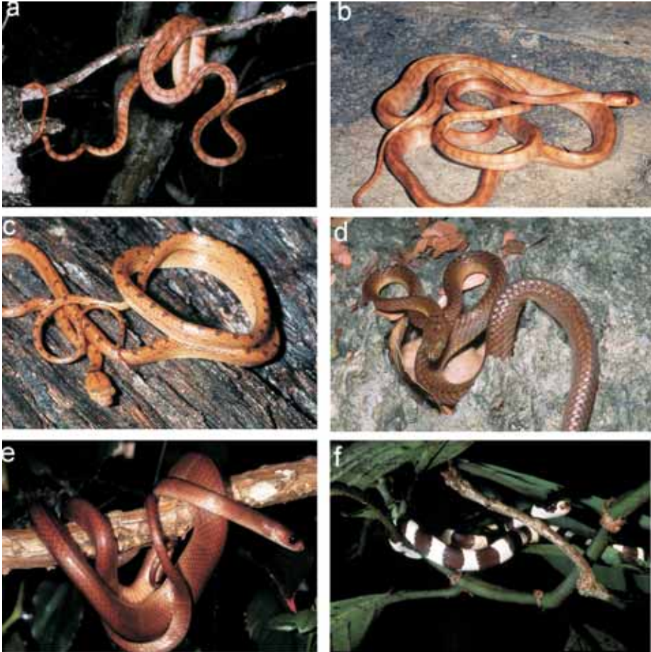
Fig. 2. Colour photos of Stenophis specimens assigned to the subgenera Phisalixella (a-d) and Parastenophis (e-f) / Farbabbildungen von Stenophis -Exemplaren aus den Untergattungen Phisalixella (a-d) und Parastenophis (e-f) sensu DOMERGUE (1995). (a) Stenophis arctifasciatus , Andasibe (ZSM 231/2002). (b) Stenophis variabilis , Kirindy (UADBA). (c) Stenophis inopiniae , Montagne des Français (ZSM 551/2000 or 552/2000). (d) specimen from Ankarana (not collected / nicht konserviert; photo B. LOVE) that probably represents / wahrscheinlich Stenophis inopiniae . (e) Stenophis betsileanus , “giant” specimen, Marojejy (ZFMK 60500). (f) Stenophis betsileanus , Masoala Corridor (MRSN R1973).

irregular markings, very similar in this to the state in large S. granuliceps that also lose the crossband pattern. The main difference is a relatively high number of ventrals (257 vs. 245 in the specimen with highest count from Nosy Be). Two further distinctive features discussed by C. DOMERGUE in an unpublished manuscript available to us, and verified by us in the type, are the postgulars which are separated by two pairs of small scales, and the sixth supralabial which is fused with a scale usually located above it. We do not believe that these characters are sufficient to accept capuroni as separate species and therefore consider it as junior synonym of S. granuliceps .