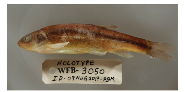
FIGURE 2. Holotype of Hesperoleucus symmetricus serpentinus, Red Hills Roach.

Etymology . Both the common and subspecies name reflect the nature of the rocks through which these small creeks flow. The Red Hills region is named for the color of the soils created by weathering one of the largest outcroppings of serpentine rocks in the Sierra Nevada. Serpentine soils are high in magnesium and other minerals and create conditions in which few species can live. The landscape has a sparse but highly endemic flora (Anacker & Harrison 2012, Harrison 2013) and streams are small and largely unshaded.