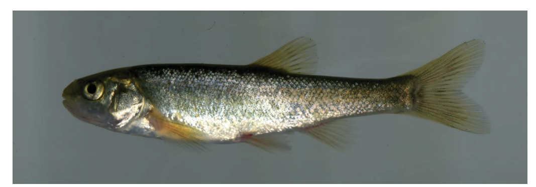
FIGURE 3. Hesperoleucus mitrulus , Northern Roach. Ana River, Lake Co., Oregon. September 27, 2010.

Description . Northern Roach are small (adult size typically 50–100 mm TL) bronzy cyprinids, similar in appearance to the California Roach (Moyle 2002; Fig. 3). They have a robust body, deep caudal peduncle, short snout and short rounded fins. Northern Roach differ from CA Roach in having short rounded fins and "cup-like" scales (Snyder 1913; Table 1). Snyder (1908) examined 20 fish from Drew Creek, Oregon and all individuals had 8 dorsal rays and 7 anal rays. Snyder found that males had longer, larger fins than did females, especially pectoral fins; the sexes could be differentiated by the ratio of pectoral fin length to body length.