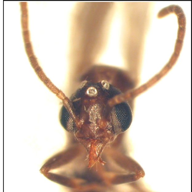
Fig. 3: Technomyrmex vexatus male from Gibraltar, in lateral (upper panel) and frontal (lower panel) view.

DALER 2007). Given its current known distribution, it is possible that T. vexatus comprises a third species with such a distribution. It is interesting to note that, like the genus Anochetus , Technomyrmex is a largely tropical genus.