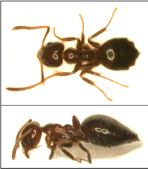
Fig. 2: Technomyrmex vexatus worker from Gibraltar in dorsal (upper panel) and lateral (lower panel) view.

mined in dorsal view (Fig. 2), whereas only four tergites are visible in Tapinoma with the fifth tergite reflexed below the fourth (HÖLLDOBLER & WILSON 1990, BOLTON 1994). Technomyrmex vexatus can be separated from tramp species belonging to the " T. albipes " group by a somewhat shiny appearance and a lack of dorsal setae, including on the gaster (B. Bolton, pers. comm.). A description of the worker caste of T. vexatus is included in BOLTON (2007).