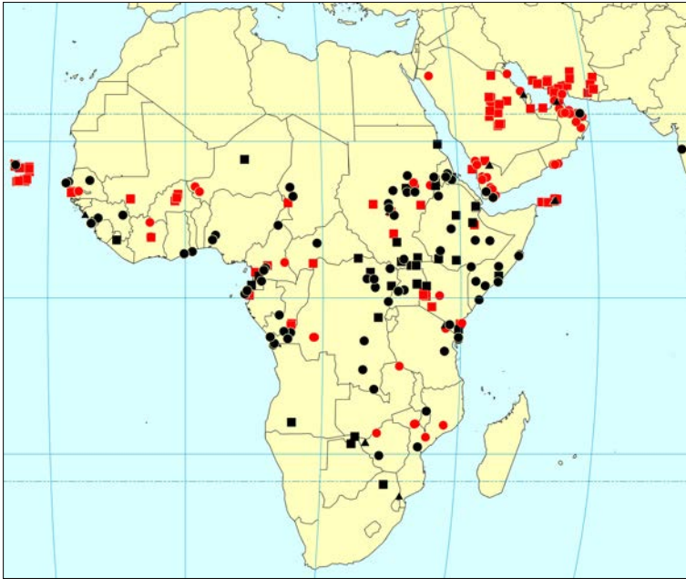
Fig. 5: Site records of Pachycondyla sennaarensis . Early records: black circles \leq 1925, black squares = 1926-1950, black triangles = 1951 - 1975. Recent records: red circles = 1976 - 2000, red squares = 2001 - 2011. Older records overlay newer ones. Dashed lines delimit the tropics.