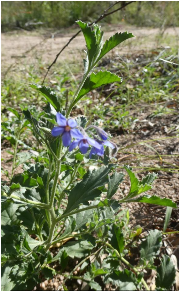
You can see how serrated the leaves are in this photo. They are quite rough to touch

In Flora of the Granite Belt it is described as a low spreading shrub; leaf oblanceolate, margins toothed, densely covered in bristly 2-armed hairs. It has only been recorded on Orana but I'm sure it occurs on many other properties with similar conditions. It is on a rocky slope in woodland. Margaret Carnell