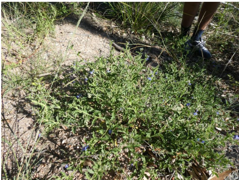
As you can see there are not many flowers on the plant