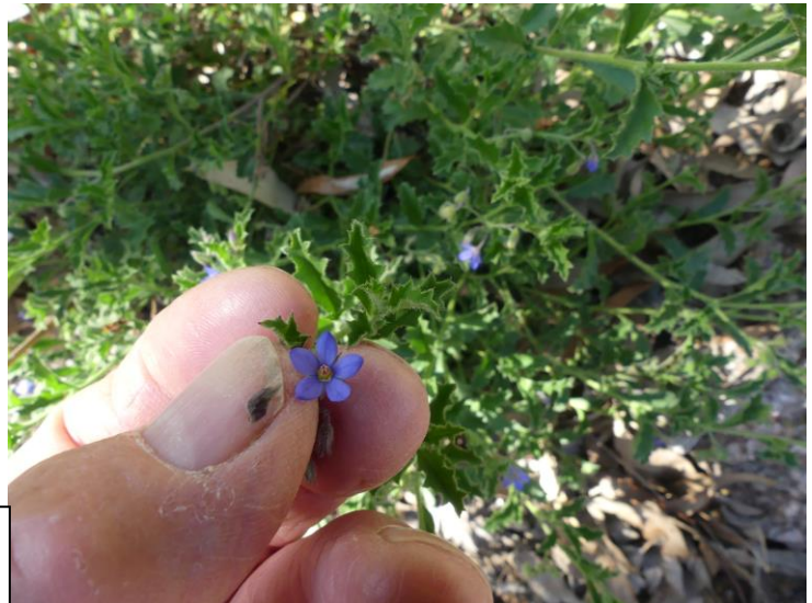
This gives you some idea of the size of the flower