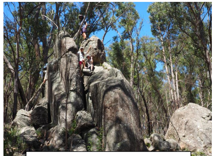
If you see a rock – Climb it!

As there were no clear views from the top we walked down to the south through some more amazing rock formations and onto a large open expanse of granite with views to Billy Goat Hill, Twin Peaks and West Bald Rock. We came across a couple of man-made rock structures but after a lot of discussion couldn't decide on their purpose.