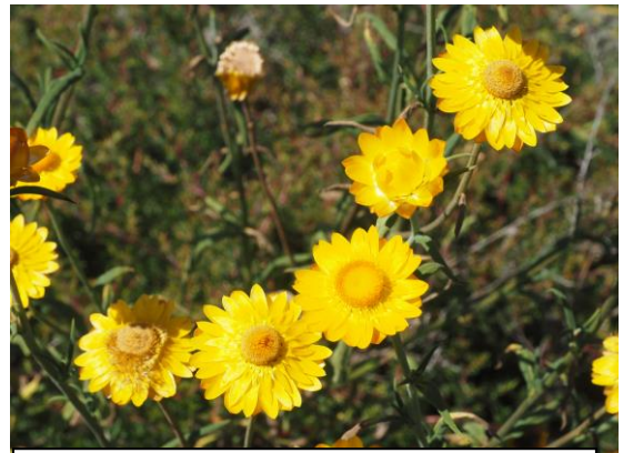
Hoary sunray ( Leucochrysum albicans albicans )

goodenia Goodenia bellidifolia subsp. argentea , Ivy-leaf goodenia Goodenia hederacea subsp. hederacea , Bluebells Wahlenbergia communis , W. graniticola and W. stricta , Golden weather grass Hypoxis hygrometrica var. villosisepala , Yellow rush-lily Tricoryne elatior , Wild iris Patersonia sericea var. sericea , Slug herb Murdannia graminea , Matrush Lomandra multiflora subsp. multiflora , Cockspur flowers Plectranthus suaveolens , Purple loosestrife Lythrum salicaria .