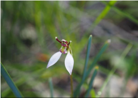
Parson's Bands ( Eriochilus cucullatus )

A ground orchid, Parson's bands Eriochilus cucullatus , Rock Isotoma Isotoma anethifolia , Queen of the bush Pimelea linifolia , Hoary sunray Leucochrysum albicans var. albicans , Golden everlasting Xerochrysum bracteatum , Showy podolepis Podolepis jaceoides , Billy buttons Craspedia canens , Yellow buttons Chrysocephalum apiculatum , Granite daisy Brachyscome stuartii , White burr daisy Calotis dentex , White root Lobelia purpurascens , Trailing lobelia Lobelia andrewsii , Daisy