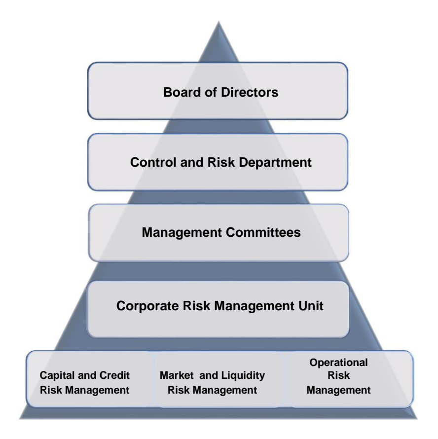
Figure 1: Prudential Conglomerate Risk Management Structure

The Board of Directors is responsible for the information provided in publicly disclosed reports containing descriptions of management structures, and for approving the appointment of the officer responsible for this structure.