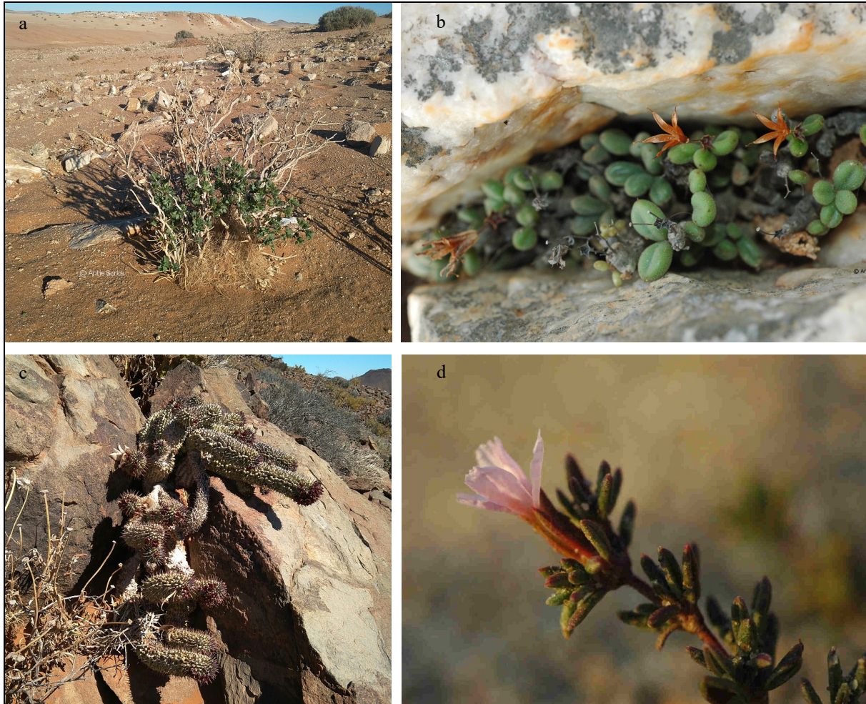
Figure 2: Selected plant endemics of the TsauKhaeb (Sperrgebiet) National Park. a) Polemanniopsis namibensis grows in a few isolated populations in the northern part of the park; b) The local endemic Tylecodon aridimontanus is presently only known from the Heioab mountain; c) Hoodia officinalis subsp. delaetiana growing from cracks in the Klinghardt Mountains; d) Frankenia pomonensis is restricted to the Sperrgebiet's coastal area.