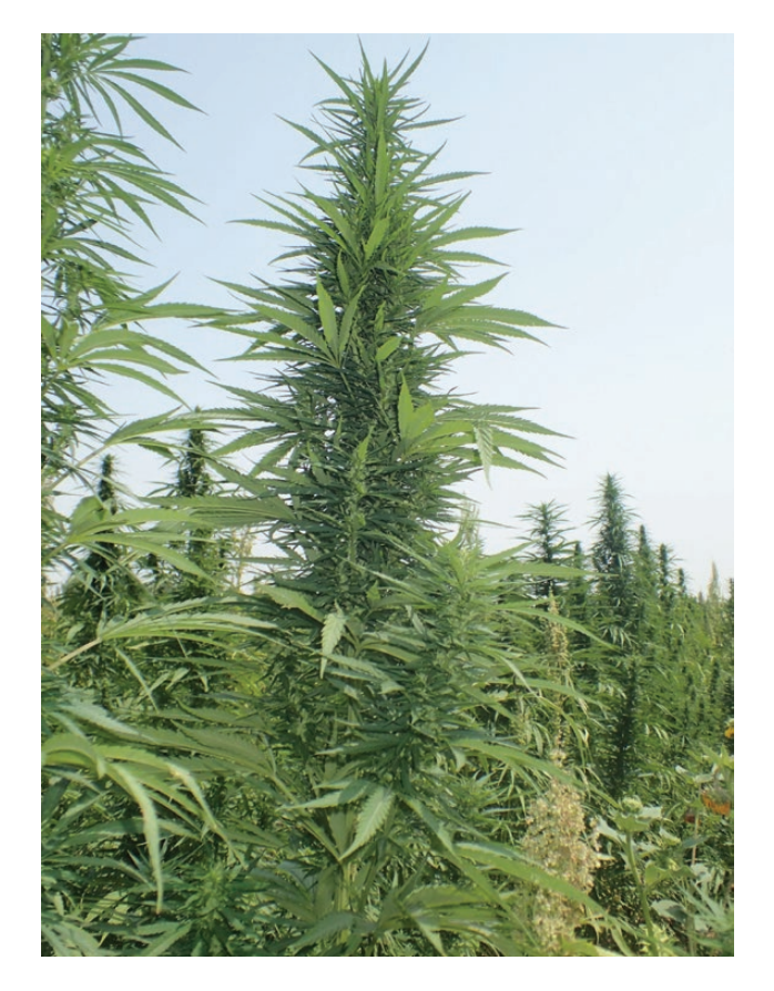
Fig. 1. Maturing seed head of a hemp plant.

With the current renaissance of hemp as a crop in the United States, there are new production areas with new crop products to