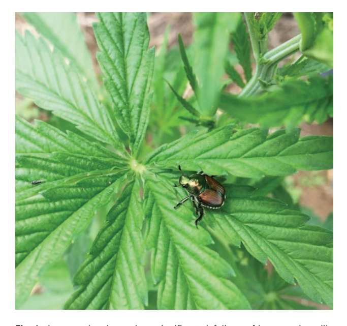
Fig. 4. Japanese beetle can be a significant defoliator of hemp and readily feeds on flowers.

American species from hemp: clearwinged grasshopper, Camnula pellucida (Scudder), and Chloealtis conspersa (Scudder). Unlike other defoliators of the crop, grasshoppers may also cause extensive damage to twigs, producing flagging of small branches (Fig. 5).