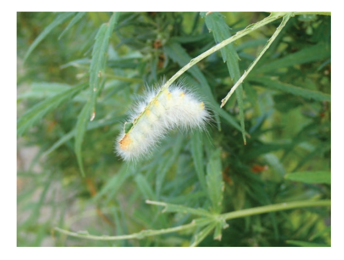
Fig. 3. Several caterpillars, such as yellow woollybear, chew hemp foliage.

The most important defoliators in eastern Colorado have been grasshoppers (Orthoptera: Acrididae), with localized outbreaks reported in 2016 and 2017. At least four species have been observed to feed on hemp: differential grasshopper, Melanoplus differentialis (Thomas); twostriped grasshopper, M. bivittatus (Say); redlegged grasshopper, M. femurrubrum (De Geer); and M. lakinus (Scudder). McPartland et al. (2000) provide accounts of two additional North