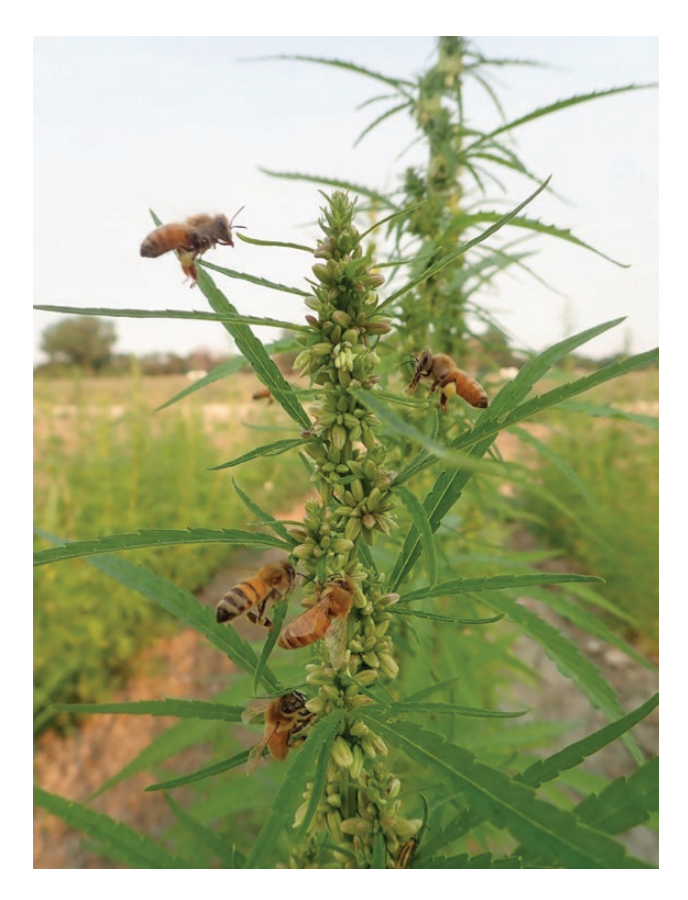
Fig. 15. Flowering hemp produces an abundance of pollen and this may be heavily used by many kinds of bees in areas where alternative pollen sources are not available.

Flowering hemp can be a significant source of pollen for both honey bees and many kinds of native bees during late summer (Fig. 15). Although honey bee (Apis mellifera L.) (Hymenoptera: Apidae) is usually the most noticeable bee, a considerable diversity of species may be found in the crop. Trapping of bees in hemp during 2015 and 2016 in northern Colorado found honey bee to be the most abundant species, but close to half of the total captures involved various longhorned bees (Apidae: Eucerini), particularly Melissoides spp. (O' Brien and Arathi 2019). Other Apidae found in high numbers included bumble bees (Bombus spp.) and digger bees (Anthophora spp.). Solitary bees of other families represented a small percentage of the total captures; five genera of Halictidae were found, and smaller numbers of bees in the Megachilidae and Andrenidae were also collected. In agricultural areas where suitable wild flowering forbs are limited during the period when hemp is in flower (typically August and early September in Colorado), integrating hemp into agricultural systems has the potential to significantly contribute to improving resources for pollinators that collect hemp pollen.