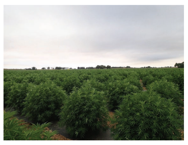
Fig. 2. Hemp being grown primarily for production of cannabidiol.

Among the coleopterans, the southern corn rootworm/spotted cucumber beetle, Diabrotica undecimpunctata howardi Barber