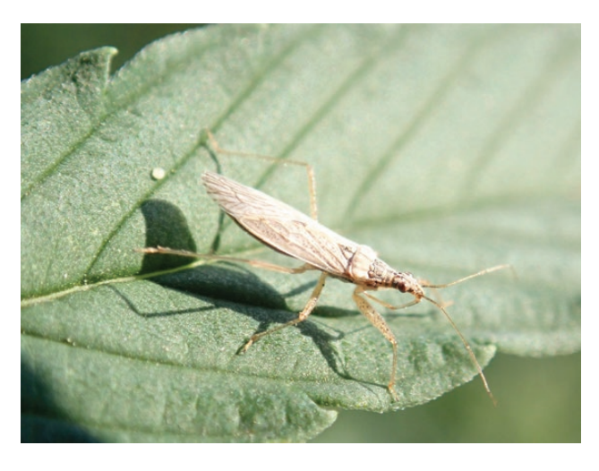
Fig. 14. Several kinds of hemipteran predators are present in hemp including damsel bugs (above), big-eyed bugs, and minute pirate bugs.