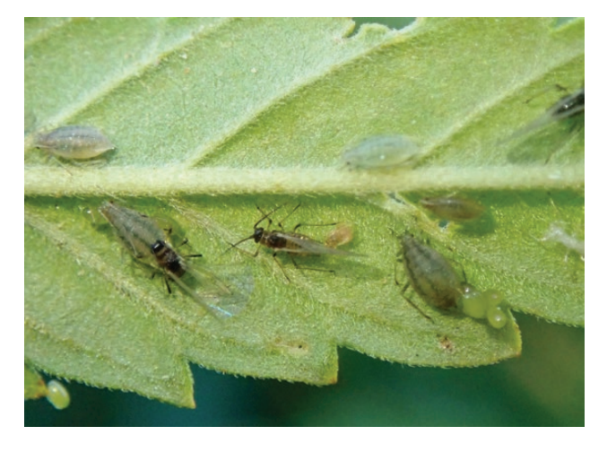
Fig. 6. Cannabis aphid is the most common aphid found on the crop. Decreasing day length, results in production of sexual forms in late September and early October, shown here, that lay overwintering eggs on the maturing plants.

Thrips are regularly found on hemp but remain largely uncharacterized. Onion thrips, Thrips tabaci (Lindeman) (Thysanoptera: Thripidae), is the only species found commonly on hemp foliage in eastern Colorado. During indoor phases of hemp production, onion thrips can cause serious foliage damage. However, during outdoor production, where plants grow rapidly, onion thrips fail to reach damaging population levels. Western flower thrips, Frankliniella occidentalis (Pergande), has also been identified in hemp in Colorado, although it appears to be mostly associated with flowers and pollen. Lago and Stanford (1989) reported tobacco thrips, Frankliniella fusca Hinds, as being common on young plants but appeared to disappear as plants grew older.