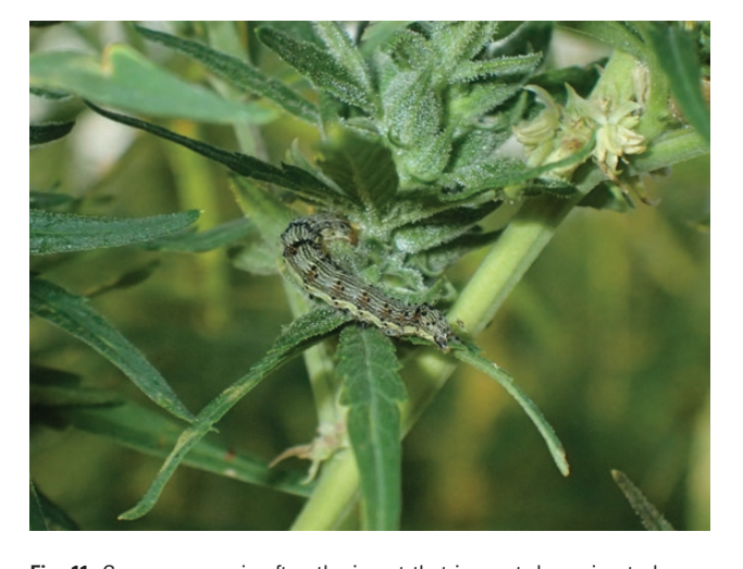
Fig. 11. Corn earworm is often the insect that is most damaging to hemp, tunneling into maturing flower buds and developing seeds. Injury is greatest on cannabidiol cultivars where large flower buds are produced.

In western Colorado, larvae of a Prionus sp. (Coleoptera: Cerambycidae) damaged a limited area of a field that had recently been converted from an area of sagebrush. This is a long-lived insect and, in this situation, the larvae appear to have originated from roots of the sagebrush remaining within the field. Damage to seedlings and small transplants by pavement ant, Tetramorium caespitum (L.) (Hymenoptera: Formicidae), also was seen in western Colorado in 2018. Seedlings located near nest entrances were damaged just below the soil line, constricting the stem, which resulted in wilting and death of plants as they got older.