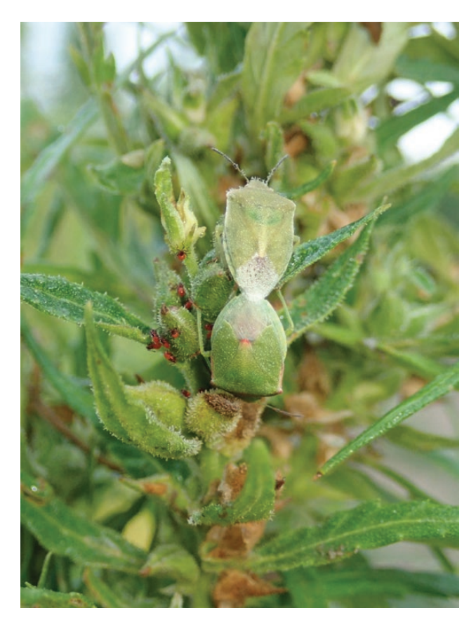
Fig. 9. Several kinds of stink bugs have been observed in hemp, usually appearing after plants begin flowering and seeds develop. Redshouldered stink bug is one of the most common species that has been found on hemp and is the one with the widest geographic range.

A few species of rhopalids (Hemiptera: Rhopalidae) can be found on hemp. Hyaline grass bug, Liorhyssus hyalinus (Fabr.), has been observed breeding in seeds and flowers of hemp in Colorado and eastern Virginia. In Colorado, high populations were found in a