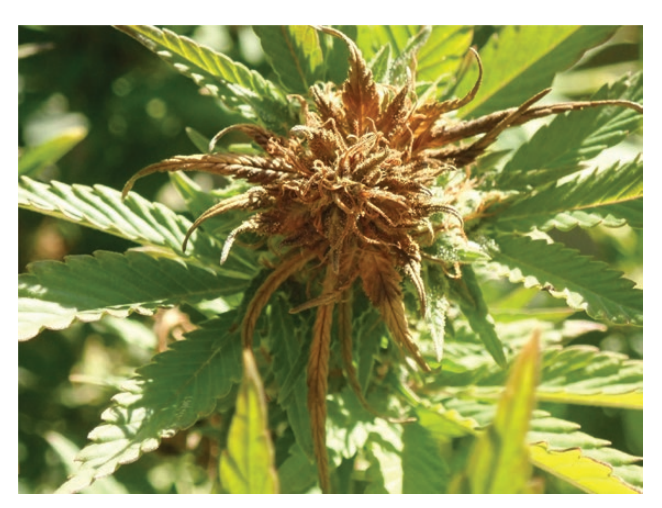
Fig. 12. Flower bud of hemp destroyed by corn earworm.