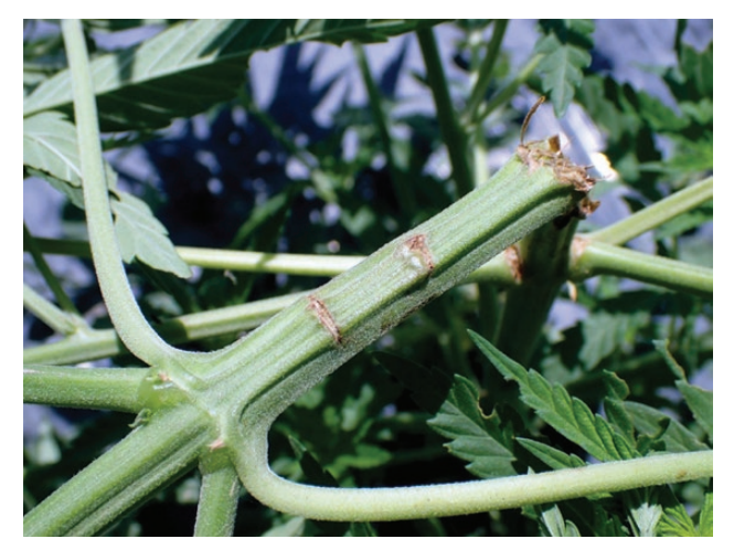
Fig. 5. Grasshoppers chew leaves but will often chew and weaken stems of hemp plants.

During the course of this new evaluation of hemp insect pests in the United States, one common species present constitutes a new record for North America, cannabis aphid, Phorodon cannabis Passerini (Hemiptera: Aphididae) (Cranshaw et al. 2018; Fig. 6). In Colorado, this insect has been observed to produce high populations in late summer in some fields every season since 2016. Outdoors, the aphid is holocyclic on the crop and sexual forms (winged males, apterous oviparae) appear beginning by early September. Overwintering eggs