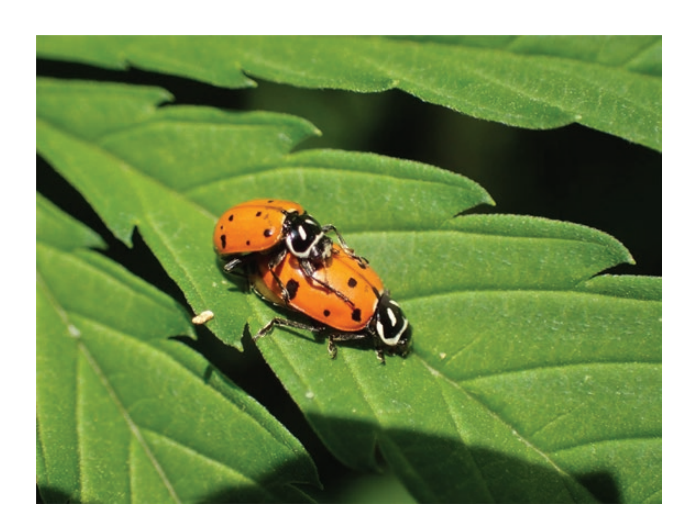
Fig. 13. Several kinds of lady beetles are common in hemp crops, including convergent lady beetle (above), multicolored Asian lady beetle, and Coleomegilla maculata .

The type of hemp being grown may also affect the natural enemy complex. Hemp that flowers and produces pollen may improve food resources for predatory species that also use pollen in their diet. Pollen may also support some primarily phytophagous species (e.g., western flower thrips) that in turn can provide hosts for generalist predators (e.g., Orius insidiosus ). Conversely, pollen-bearing male flowers are often absent in fields for CBD production. Furthermore, this production system results in large, unfertilized female flower 'buds' that are densely covered with sticky, resin-rich trichomes. The