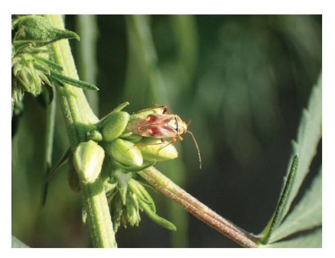
Fig. 7. Various kinds of Lygus spp. are among the most commonly observed phytophagous insects in hemp.