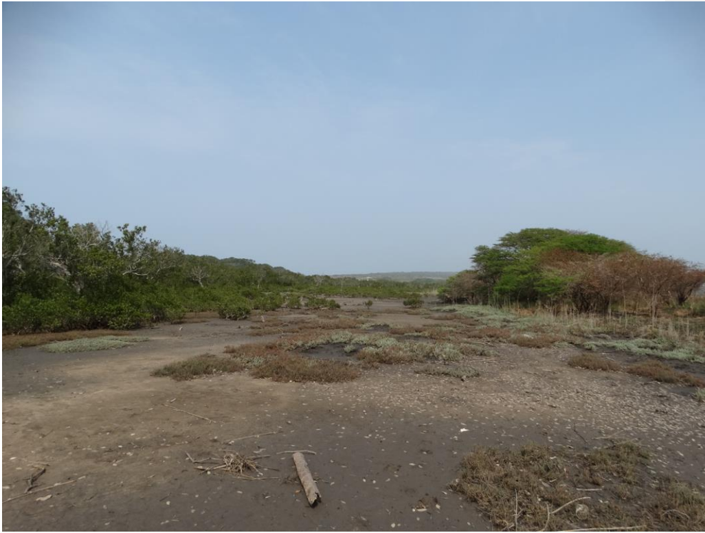
Figure 1 Mangroves bordered by salt marsh at the Nxaxo Estuary, South Africa .