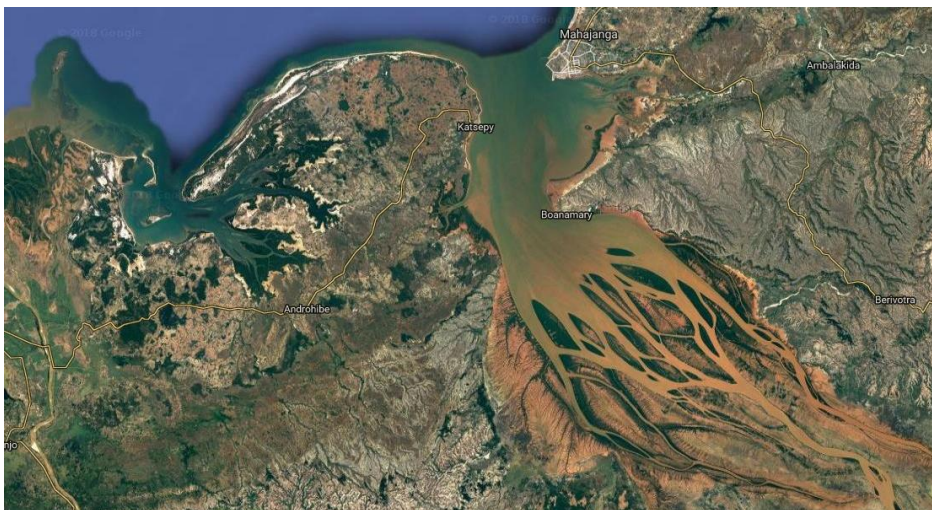
Figure 3: Delta with intertidal mudflats and mangroves in the Mahavavy delta wetland in the Mahajanga region of Madagascar.