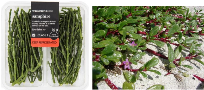
Figure 5: Samphire ( Salicornia ) sold as a vegetable at Woolworths South Africa; Sea purslane Sesuvium portulacastrum occurs worldwide and is harvested from the wild to be eaten as a vegetable. It also has ornamental and medicinal value and is used as a ground cover to prevent erosion in dune vegetation (Source Fern 2014).