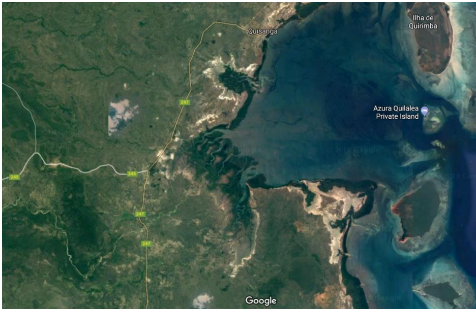
Figure 2: The Montepuez river delta leading to Montepuez Channel, Mozambique. The surrounding outer mangrove channels depicts salt marshes.