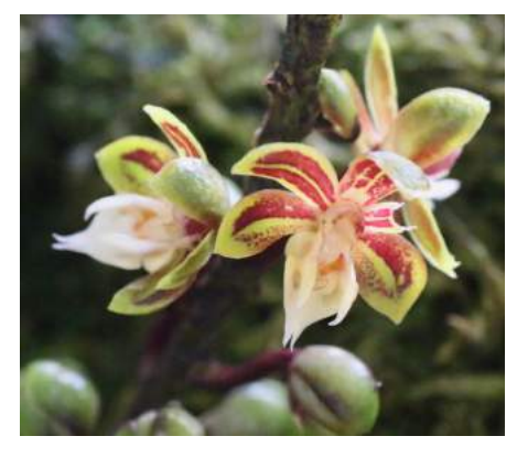
Cleisostoma birmanicum - Luda