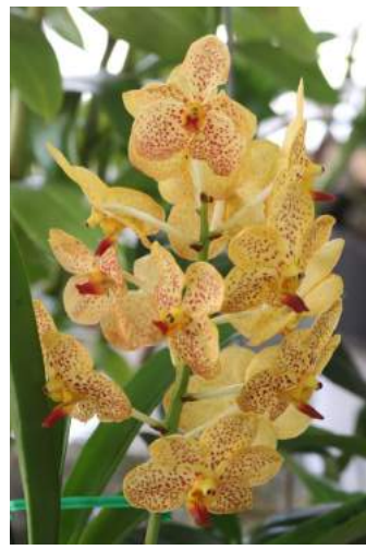
V.Sumon Spots x V.Fuchs Spotted Orange Rod & Jan