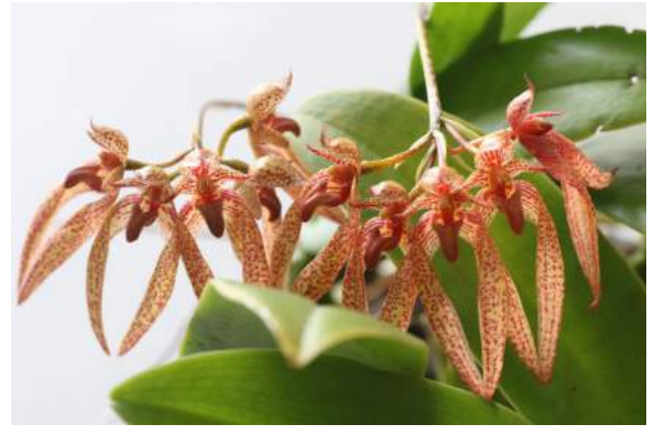
Bulb. Meen Ocean Brocade - Duncan