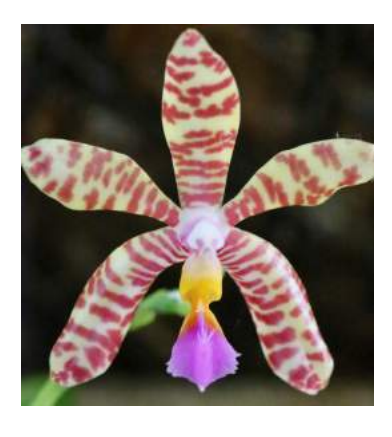
Phalanopsis unknown - Glenda