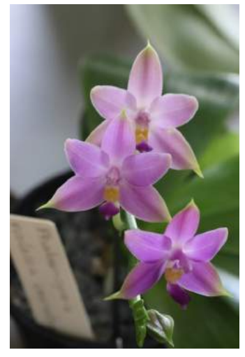
Phal. violacea var. coerulea Judy