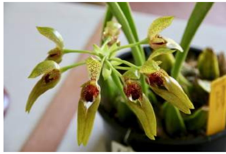
Bulb. graveolens - Duncan