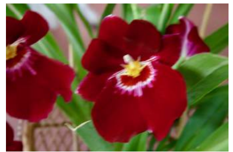
Mps. Bert Field - 'Leash' - Luda