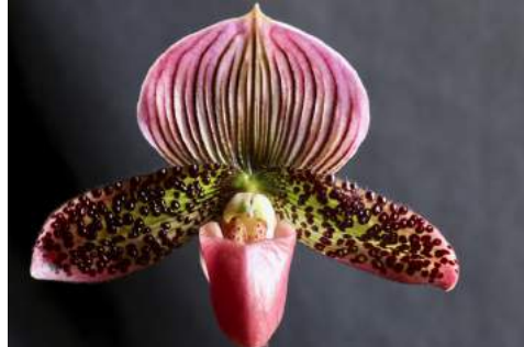
Paph. Toad Hall - Judy