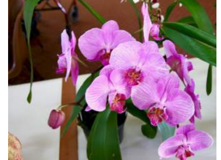
Phalaenopsis unknown - Grahame