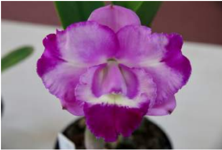
Rlc. Capricorn Charm - Tom