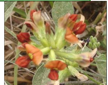
Pedionelum rhombifolium , PDST 267.

The meeting is at Valley Nature Center , 301 S Border, (in Gibson Park), Weslaco. 956-969-2475.