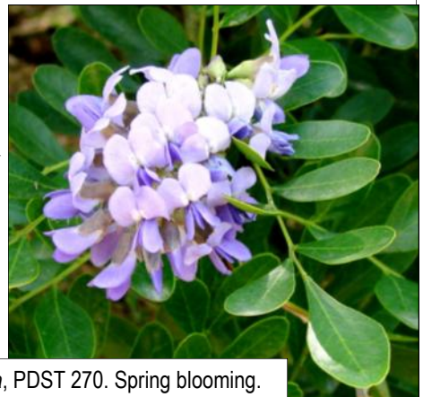
Texas Mountain Laurel, Sophora secundiflora , PDST 270. Spring blooming.

“Before taking a bite of the next wild bean you see, however, you need to know that the legume family also contains a number of highly toxic beans. Sophora secundiflora (mescal bean, or Texas mountain laurel) has deadly poisonous beans and foliage. ... Native Americans used certain leguminous plants as fish poisons and as powerful drugs for medicinal and religious purposes. Never experiment with an unknown wild bean. Its resemblance to something you had for dinner last night does not qualify it for tonight's dinner table.”