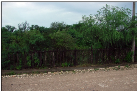
Below: Baretta and tenaza are often used for large fence posts (lower right), while smaller trees like palo blanco are more appropriate for wood-slat building walls (lower left), fence slats (upper left), and lattice fences (upper right).