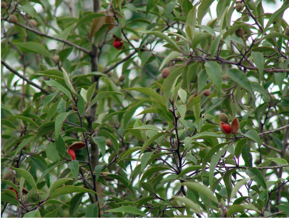
Above: Though extremely rare in the LRGV, vara blanca is a common shrub/small tree at Parras, where its fleshy red fruits are eaten by a variety of wildlife. Below: Corva de la gallina ( Neophringlea integrifolia ; a tree species not native to the LRGV) is one of Parras' most important food sources for granivorous wildlife, which eat the seed from its three-winged samara fruit.