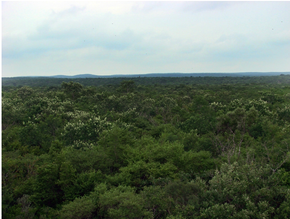
Above: Blooms of emergent tenaza trees are conspicuous while overlooking thorn-shrubland from one of Parras de la Fuente’s look-out towers.

Several tree species in and around Parras are commonly harvested for their wood. Species such as tenaza ( Havardia pallens ), baretta, limoncillo, and vara blanca are highly sought after for fence posts and slats because of their characteristically long, straight, and relatively thick trunks. A very common small tree species having a slim and straight trunk, locally referred to as “palo blanco” (a species not native to the LRGV), is most often used when thinner posts and slats are called for. Other species, such as