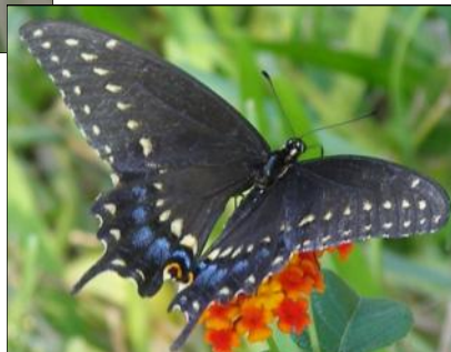
Photo of Black Swallowtail Butterfly by Berry Nall. [www.leps.thenalls.net]

(See p. 377 in Plants of Deep South Texas. )