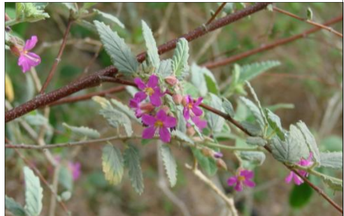
Above: Woolly Pyramid Bush. Melochia tomentosa , p.405.