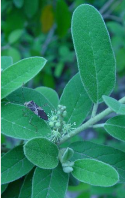
Above: Torrey's Croton. Croton incanus . p.217.