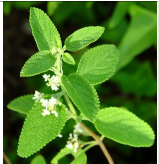
Above: Mexican Oregano. Lippia graveolens . p.418.

Rocky hills of the western valley are bulldozed daily for a multitude of mostly ridiculous reasons. Thus, propagation of the plants which inhabit those areas is an important mission in the fight to maintain genetic and species diversity. The plants shown on this page are some of the species which have been propagated more or less successfully. Mortonia greggii and Manihot walkerae have also been cultivated with moderate success and Jefea brevifolia ( Xexmenia ) is available as seed or transplants. Further information about most of these can also be found in publications of the Native Plant Project.