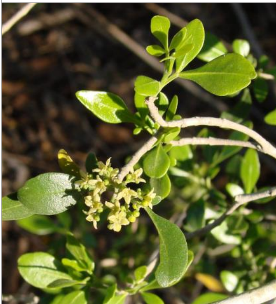
Above: Barreta. Helietta parvifolia . p.376.