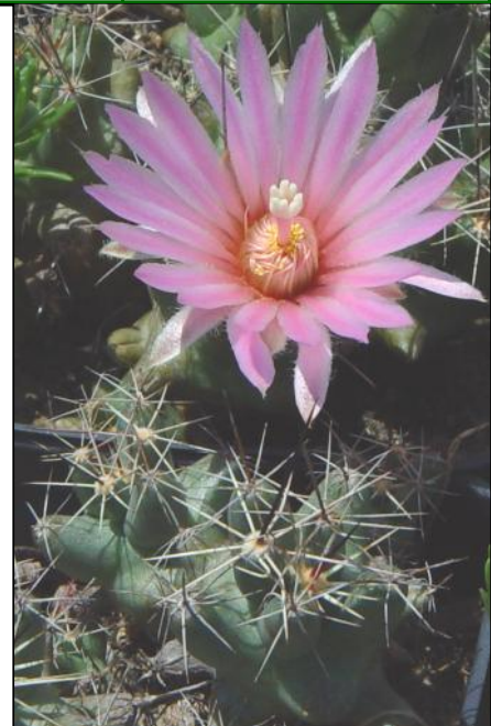
Photo: Coryphantha macromeris var. runyonii

The Sabal is the newsletter of the Native Plant Project.