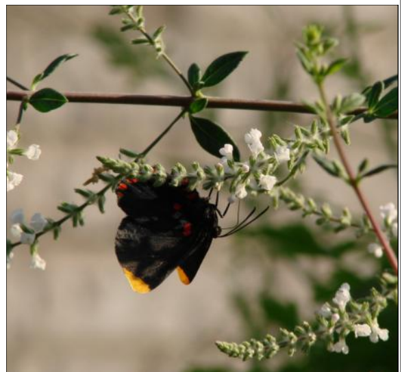
Above: TX Kidneywood. Eysenhardtia texana . p.262.