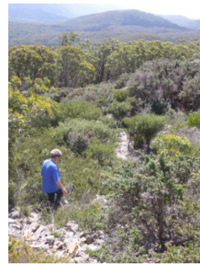
Just off the summit RF