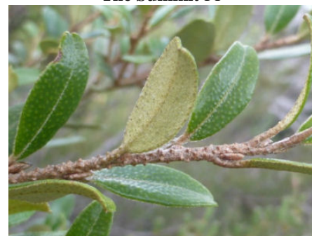
Nematolepis elliptica RF