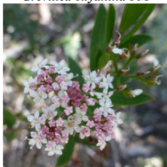
Platysace lanceolata FM