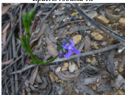
Lobelia sp. FM