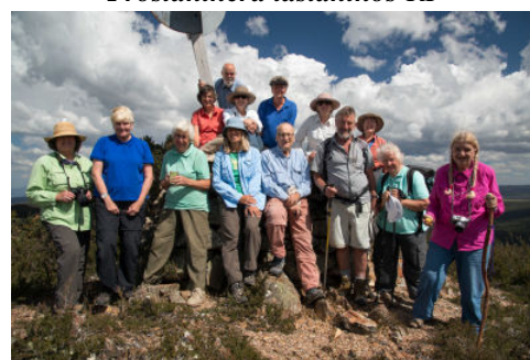
The Summit PF