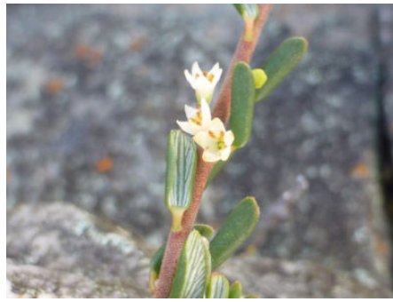
Monotoca rotundifolia RF