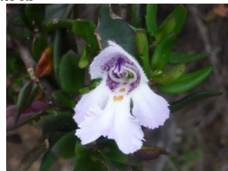
Prostanthera lasianthos RF