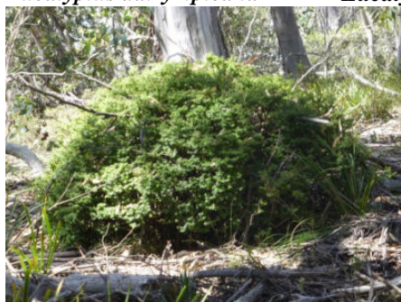
Acrotriche divaricata RF