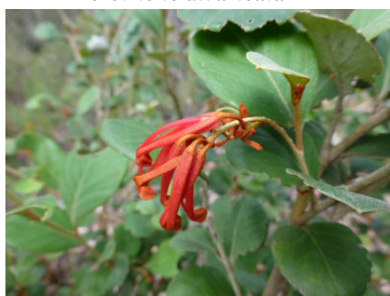
Grevillea oxyantha FM