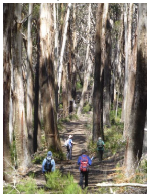
Eucalyptus fraxinoides RF