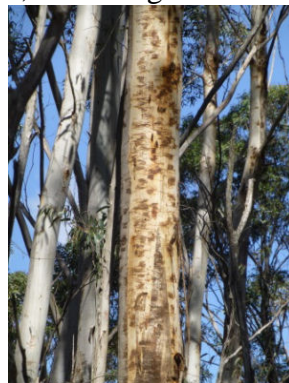
Eucalyptus fraxinoides RF