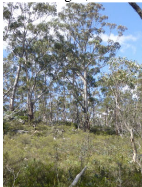
Eucalyptus dalrympleana RF

For the images, FM = Fran Middleton, PF = Pamela Finger, RF = Roger Farrow