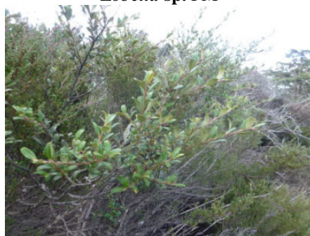
Nematolepis elliptica RF