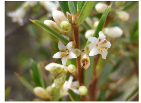
Monotoca scoparia RF