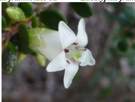
Epacris robusta RF