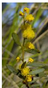
Acacia buxifolia