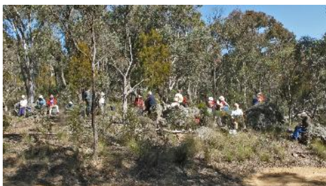
Morning tea

We started the walk from Frith Road and did a circuit of Little Black Mountain with a short detour to the saddle. We were very pleased to have Jean Egan and Tony Wood with us and they showed us some lovely orchids flowering - Pterostylis nutans , Bunochilus umbrinus , Cyanicula caerulea , Cyrtostylis reniformis and Petalochilus fuscatus . There were also some very good floral displays of other plants - masses of Acacia genistifolia , A. buxifolia , A. gunnii , Pimelea linifolia , Pomaderris intermedia , Leucopogon attenuatus , L. fletcheri ssp. brevisepalus , L. virgatus , Hovea heterophylla , Hardenbergia violacea , Phyllanthus hirtellus , a few Dillwynia phyllicoides , Coronidium oxylepis ssp. lanatum , Xerochrysum viscosum , Stylidium graminifolium , Hibbertia obtusifolia , Clematis microphylla and a few flowers on Grevillea sp. aka G. alpina .