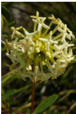
Pimelea linifolia