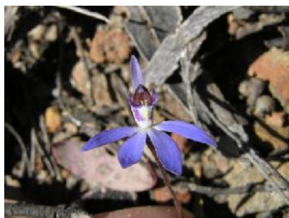
Cyanicula caerulea