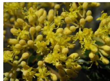
Pomaderris intermedia