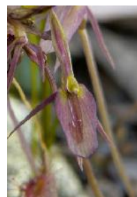
Cyrtostylis reniformis