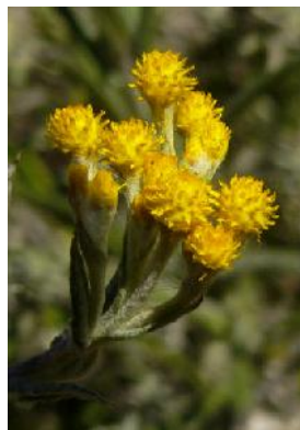
Chrysocephalum apiculatum Image by Graeme Kruse