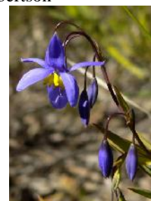
Stypantra glauca