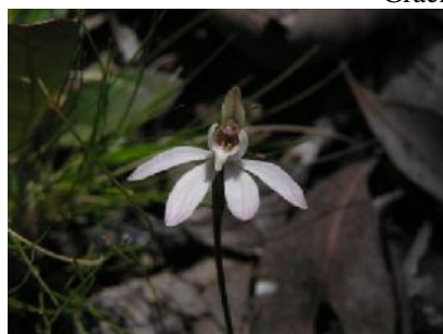
Petalochilus fuscatus image by Masumi Robertson