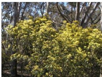
Pomaderris intermedia