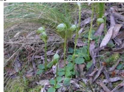
Pterostylis nutans