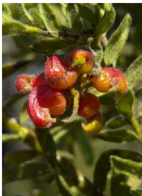
Grevillea sp.