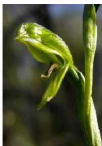
Bunochilus umbrinus