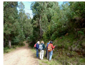
Blundell's Creek Road