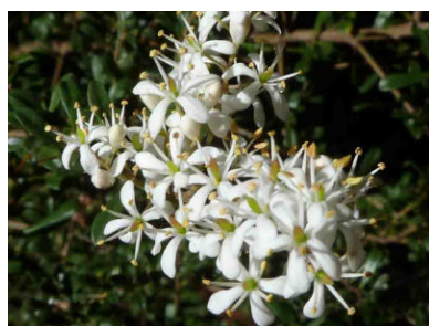
Bursaria spinosa