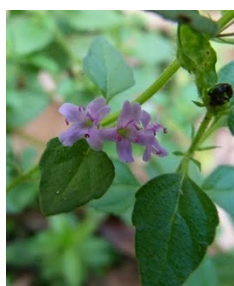
Mentha diemenica