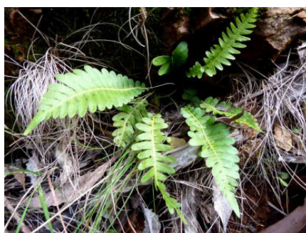
Blechnum sp. Image by Jean Geue