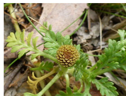
Cotula alpina