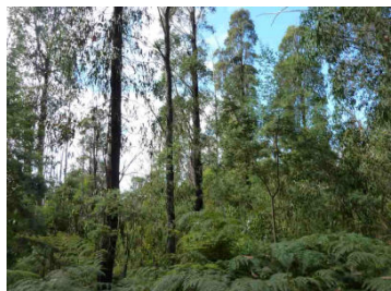
Tall forest

Blundell's Creek Road runs off Mount Franklin Road in the Brindabella Ranges. We unloaded passengers at the top, drove the cars to the bottom (intersection with Wark's Road) then brought the drivers back to commence the 3.5km walk. We were in tall, moist forest for most of the walk, regenerating from the 2003 fire - Eucalyptus fastigata , E. viminalis , E. radiata mainly. Some of the more interesting plants seen were Billardiera scandens and B. macrantha , the Asperula scoparia growing on the road banks, an abundance of Astrotricha ledifolia on the roadside and some giant Gynatrix pulchella in the creek line. Conditions were probably much wetter than in February 2010 which accounts for recording Persicaria hydropiper and Gratiola peruviana growing in the flowing roadside gutter.