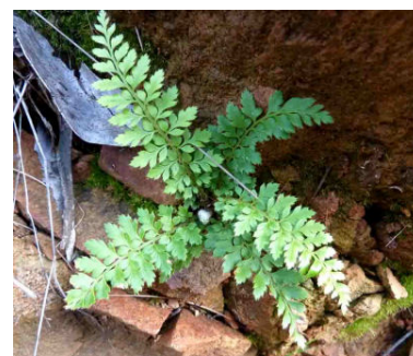
Polystichum proliferum