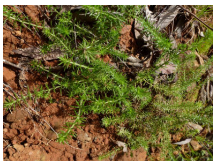
Asperula scoparia