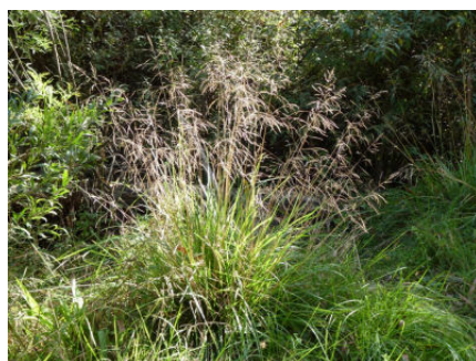
Poa helmsii