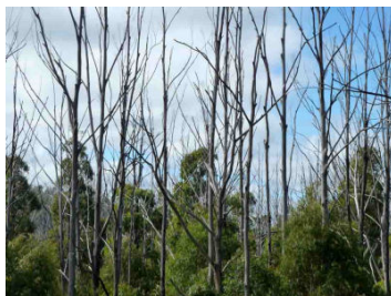
Scars from 2003 fire