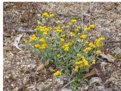
Chrysocephalum apiculatum RF