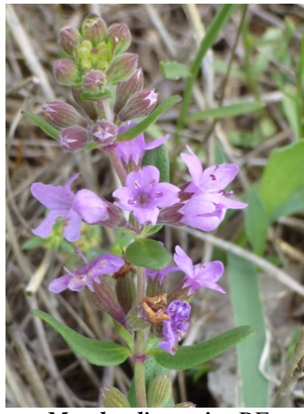
Mentha diemenica RF