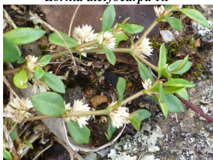
Alternanthera denticulata RF