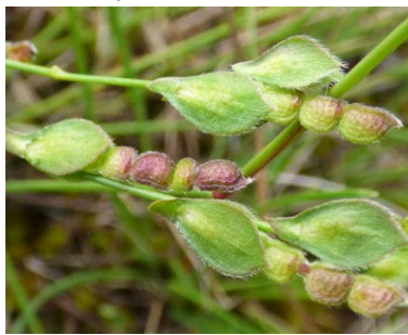
Zornia dictyocarpa seed MB