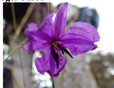
Arthropodium fimbriatum MB