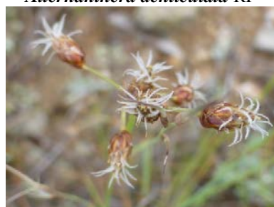
Fimbristylis dichotoma RF