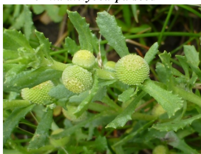
Centipeda cunninghamii RF