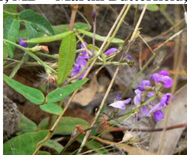
Glycine tabacina JG