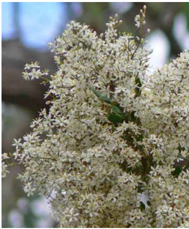
Bursaria spinosa JG