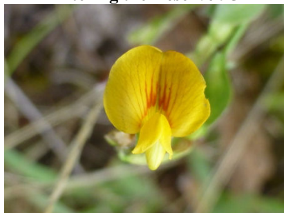
Zornia dictyocarpa RF