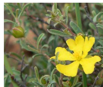
Hibbertia obtusifolia JG