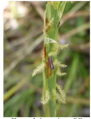
Hemarthria uncinata RF