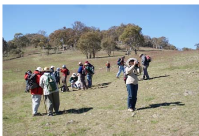
Walkers on Isaacs Ridge

Isaacs Ridge runs behind the suburbs of East O'Malley and Isaacs and is part of Canberra Nature Park. We began the walk from Callemonda Rise near the water tank, heading to the top of the ridge then walking south before looping back. There are many areas covered in weeds but there are some patches of good bushland. There were some wonderful trees, with many saplings - Eucalyptus blakelyi , E. bridgesiana , E. melliodora , E. polyanthemos , E. rossii and E. nortonii . We were interested to find quite a few mistletoes - Muellerina eucalyptoides . Another surprise was Lomandra bracteata - quite obvious with its ground level, yellow flowers. There were quite a lot of Wurmbea dioica flowering. Other interesting plants were Allocasuarina verticillata , Acacia implexa (some very old ones), Isoetopsis graminifolia (a daisy which looks like grass), one Cryptandra amara , several Indigofera adesmiifolia , Cheilanthes distans (as well as the usual C. austrotenuifolia ) and a big patch of Goodenia pinnatifida . The views were stunning and well worth the trek up the hills.