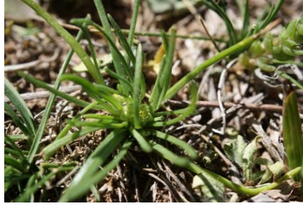
Isoetopsis graminifolium