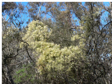
Clematis leptophylla