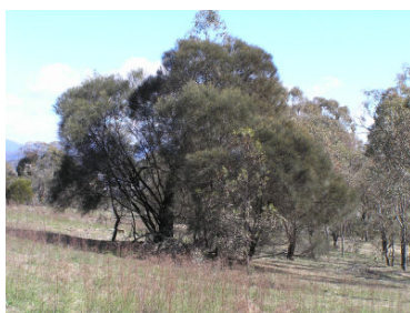
Allocasuarina verticillata