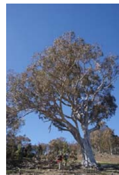
Eucalyptus rossii Image by Dave Herald