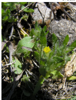
Triptilodiscus pygmaeus