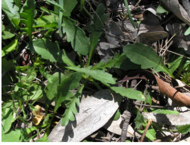
Rosettes of Goodenia pinnatifida