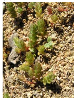
Crassula sieberiana