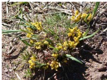
Lomandra bracteata