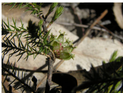
Acrotriche serrulata Image by Masumi Robertson