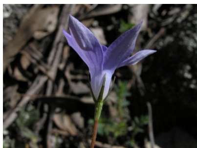
Wahlenbergia communis