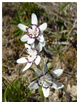
Wurmbea dioica (male)