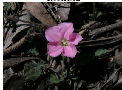
Convolvulus angustissimus