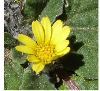
Cymbonotus sp.