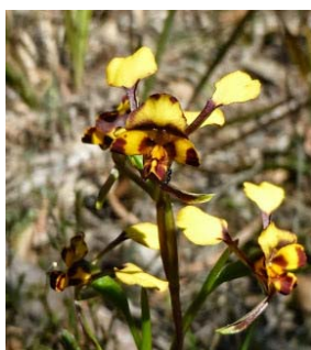
Diuris pardina