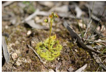
Drosera peltata