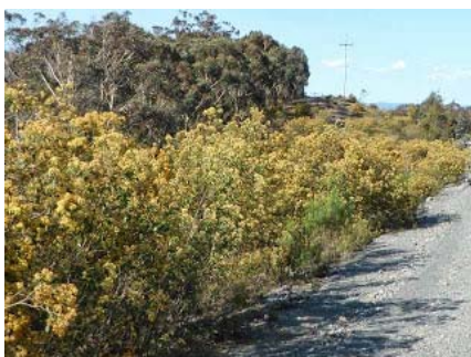
Willow Glen Rd pomaderris display