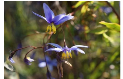
Stypandra glauca