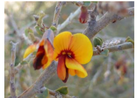
Bossiaea oligosperma