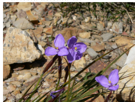
Patersonia glabrata