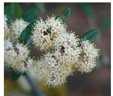
Pomaderris andromedifolia