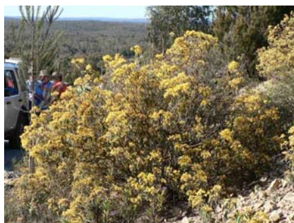
Pomaderris lanigera