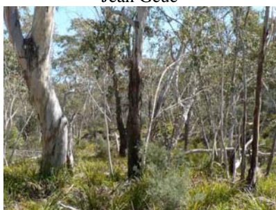
Nadgigomar Nature Reserve