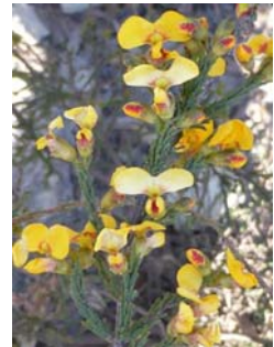
Dillwynia glaucula