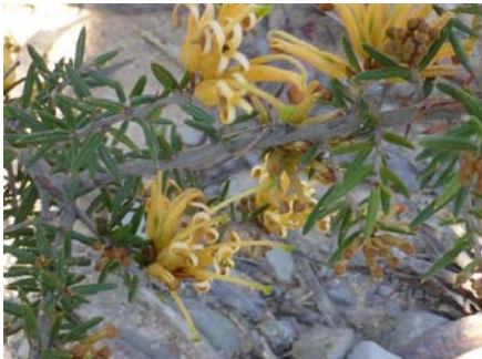
Grevillea juniperina