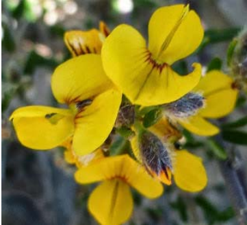
Aotus ericoides