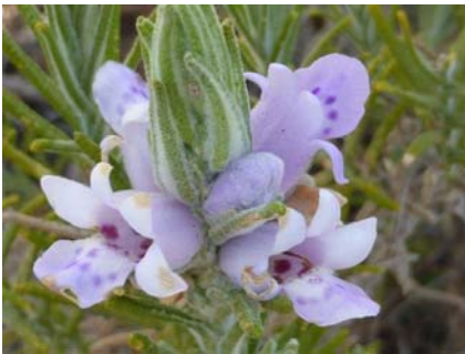
Chloanthes parviflora