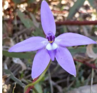
Glossodia major