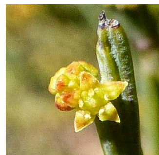
Exocarpos strictus