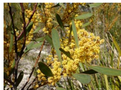
Acacia obtusata