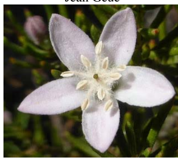
Philothea salsolifolia