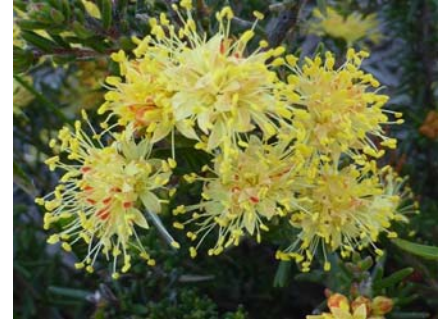
Leonema diosmeum