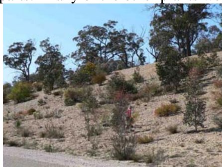
Old quarry site regenerating