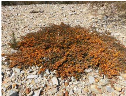
Pultenaea microphylla (prostrate)