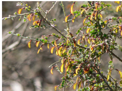
Bossiaea oligosperma