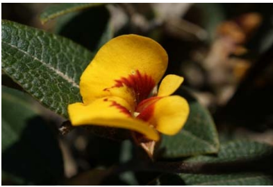
Mirbelia platylobioides