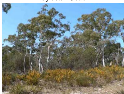
Acacia obtusata (foreground)