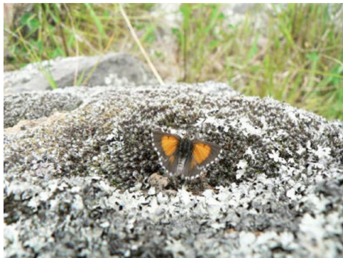
Chequered Copper Lucia limbaria