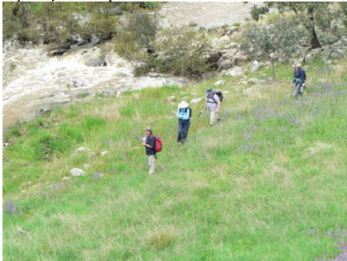
Surveying along Pudman Creek

At the request of Greening Australia, we walked a section of Pudman Creek to identify native species. The results will be used to aid regeneration work along the Creek. Close to the creek were many weeds but in the rocky outcrops were some interesting native species and there were some good areas of native grassland. Indigofera adesmiifolia was flowering well among the rocks. Many of the Austrodanthonia species were beginning to flower and other grassland plants included Convolvulus erubescens , Goodenia bellidifolia and Leptorhynchos squamatus .