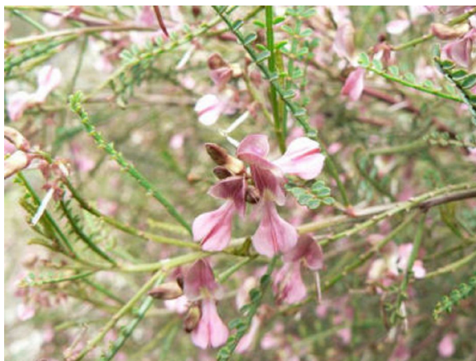
Indigofera adesmiifolia