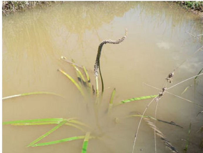
Triglochin procera