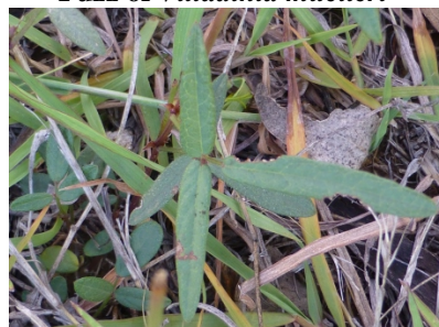
Desmodium varians leaves