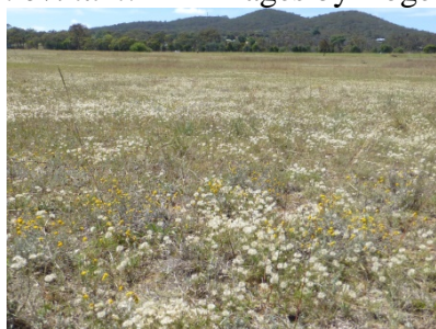
Fuzz of Vittadinia muelleri