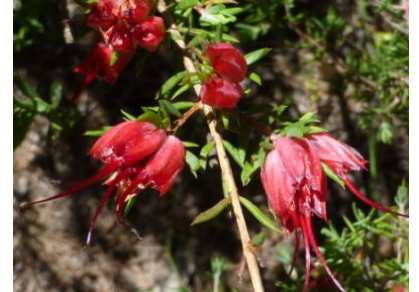
Darwinia taxifolia RF