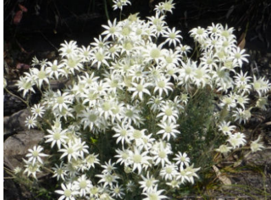
Actinotus helianthi RF