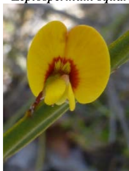
Bossiaea ensata RF