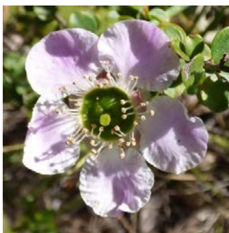
Leptospermum rotundifolium MB