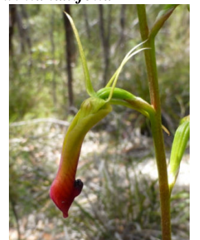
Cryptostylis subulata RF