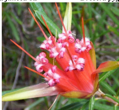
Lambertia formosa MB