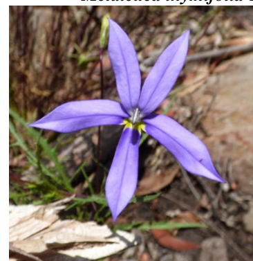
Isotoma axillaris MB