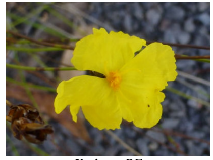
Xyris sp. RF