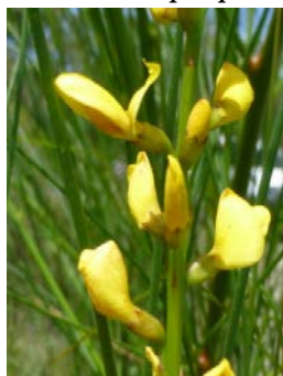
Viminaria juncea RF