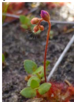
Drosera pygmaea RF