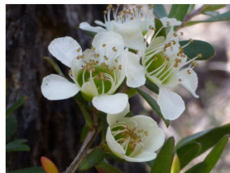
Leptospermum polygalifolium RF