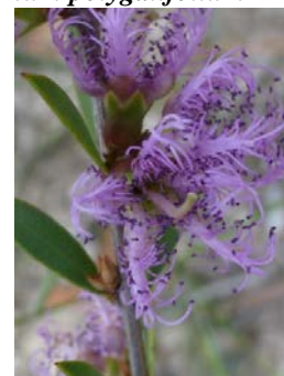
Melaleuca thymifolia RF