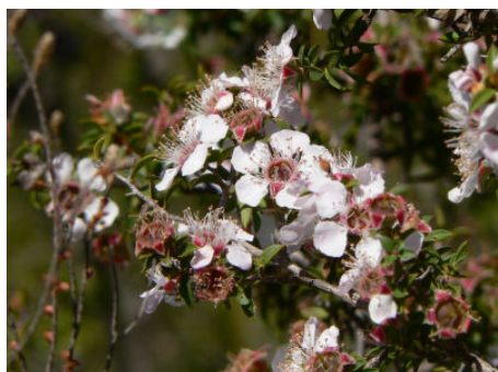
Leptospermum squarrosus