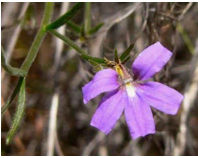
Scaevola ramosissima JG