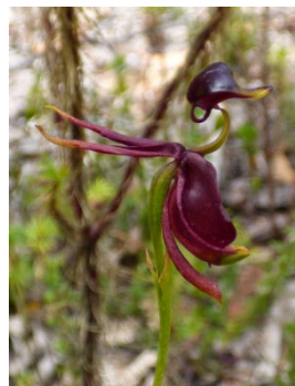
Caleana major MB