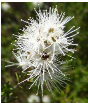
Kunzea ambigua MB