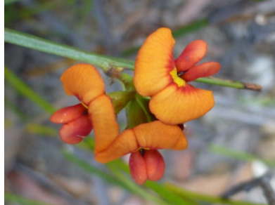
Daviesia alata RF