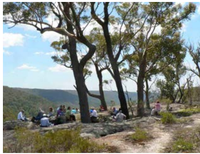
Lunch with a view JG