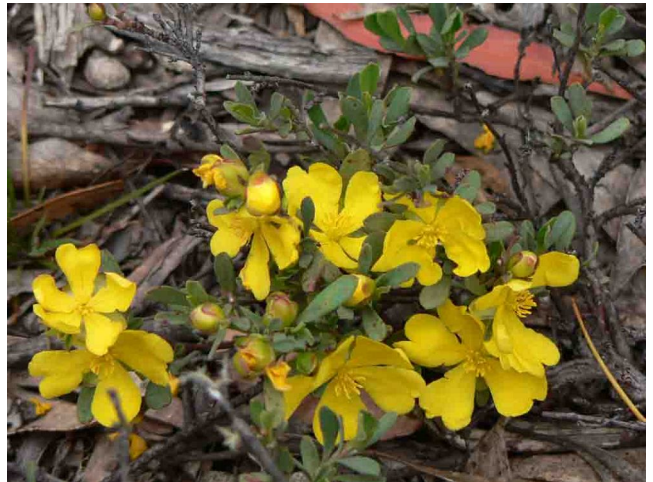
Hibbertia obtusifolia