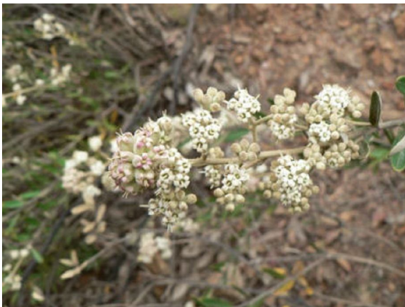
Astrotricha ledifolia