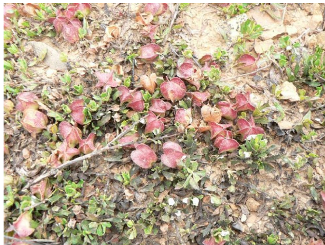
Dodonaea procumbens fruit Image by Roger Farrow