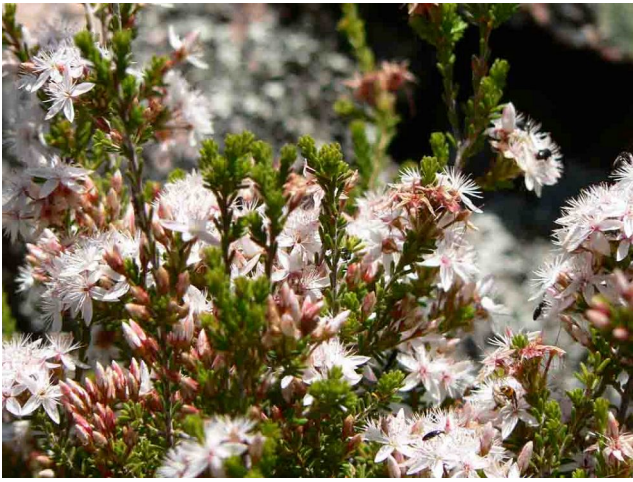
Calytrix tetragona Image by Jean Geue