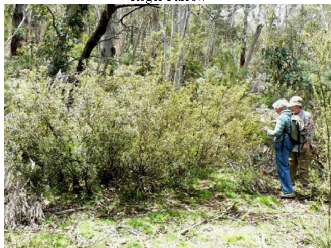
Unidentified pea