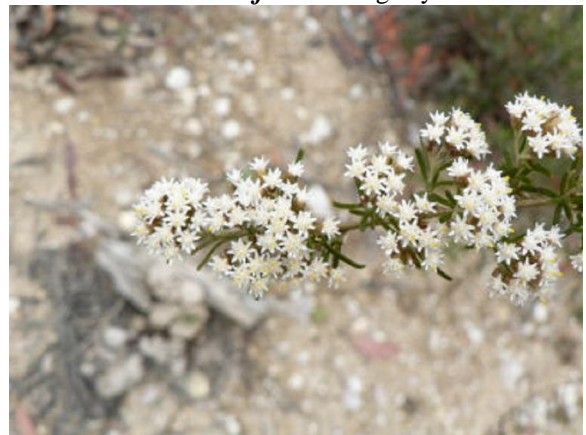
Ozothamnus thyrsoides Image by Roger Farrow