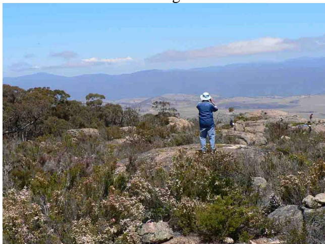
Top of the Tinderries Image by Jean Geue

The Tinderry Mountains are south-east of Canberra. From the township of Michelago there is a very scenic drive across the range, initially through grassland then into wooded areas with large granite boulders. On the eastern side of the range towards the base, there is a walk on a fire trail to a swamp. All areas visited had an interesting array of plants. In the grassland, we saw the female Dodonaea procumbens full of fruit capsules but not much else; a spectacular display of Astrotricha ledifolia flowers on the roadside cutting during the final ascent; prolific flowering of Prostanthera phyllicifolia and Calytrix tetragona on the first ridgeline; carpets of Pratia in the weather station swamp and a single spectacular Podolobium alpestre on the fire trail (new record). We were hoping to see another pea flowering, which previously we have not been able to identify but it was still a few weeks off flowering.