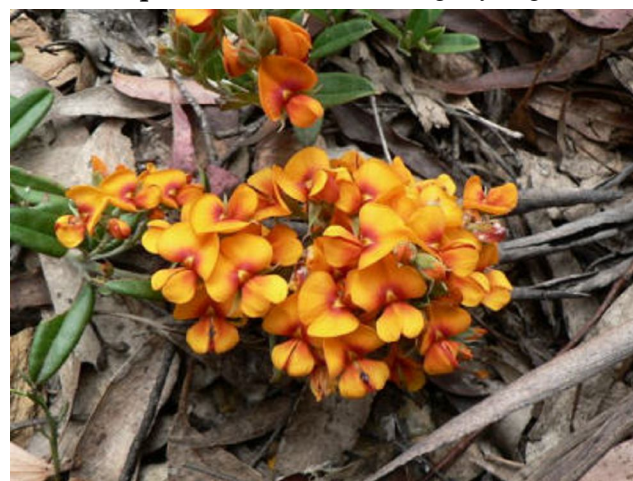
Podolobium alpestre