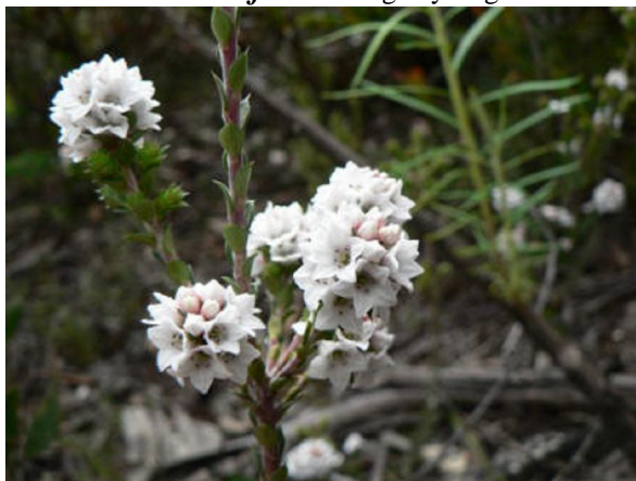
Epacris breviflora