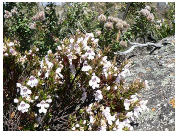
Prostanthera phyllicifolia