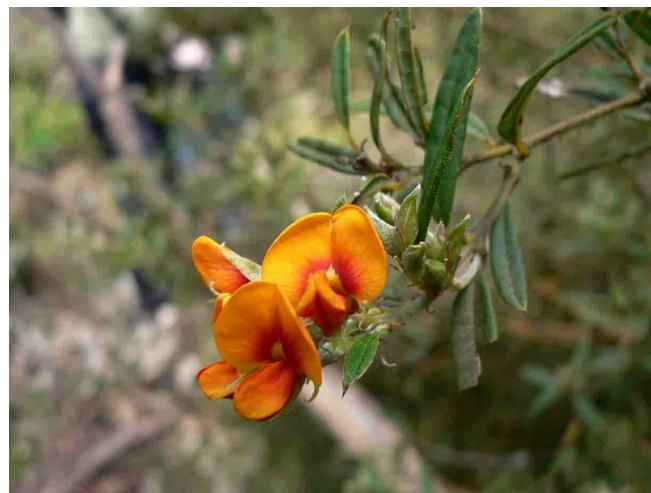
Unidentified pea