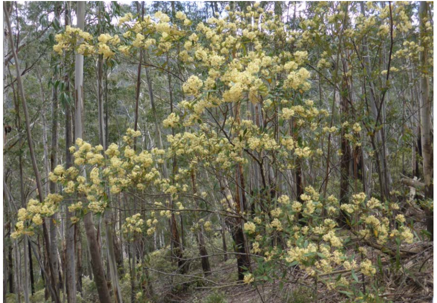
Snowball (Tallaganda State Forest)

Similar Species: P. costata from which it differs in having a stellate-tomentum on the leaf lower surface.