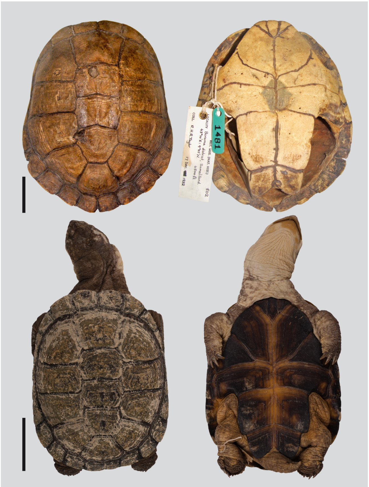
FIGURE 5. Dorsal and ventral aspects of the holotype of Pelomedusa somalica sp. nov. (BMNH 1970.1481, adult, Borama district, Awdal, Somaliland/Somalia; top) and of Pelomedusa variabilis sp. nov. (SMF 58075, subadult male, Gold Coast, Ghana; bottom). Scale bars, 3 cm.