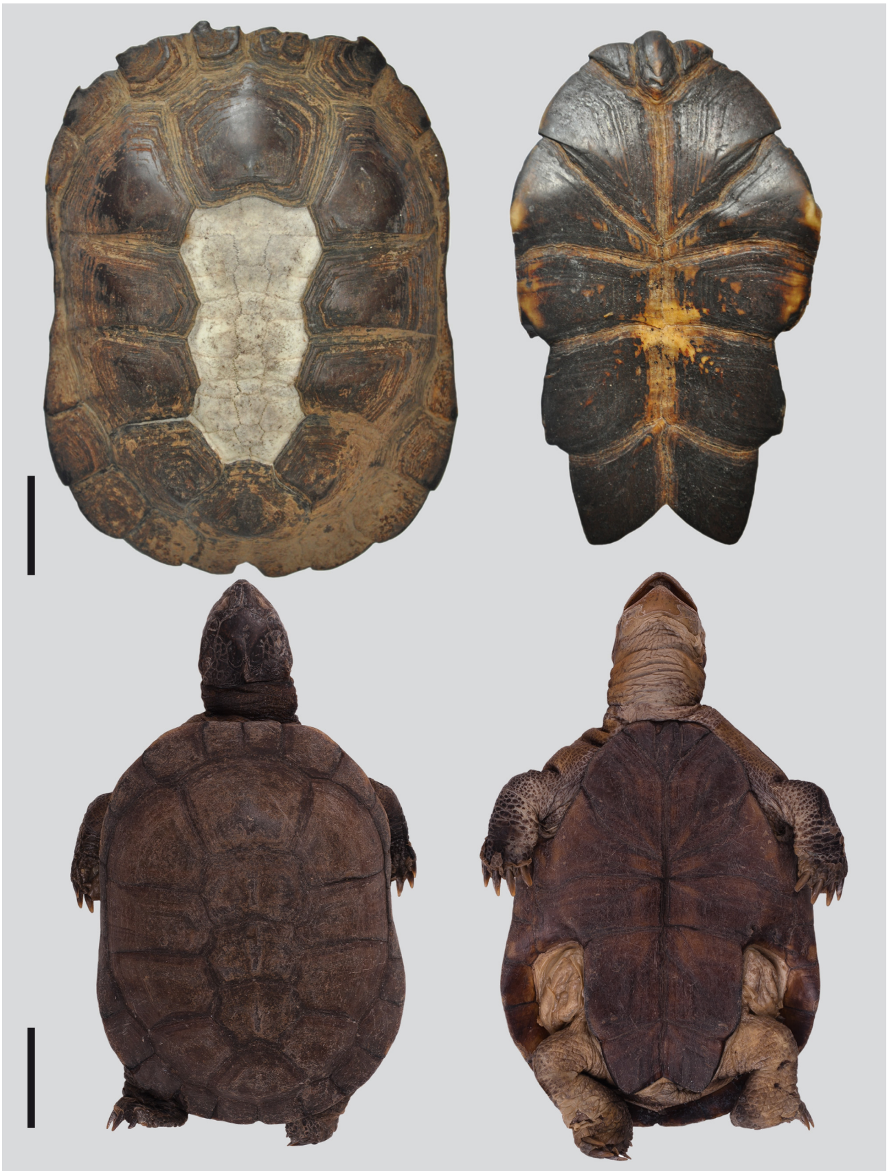
FIGURE 4. Dorsal and ventral aspects of the holotype of Pelomedusa neumanni sp. nov. (NMP6V 74974, adult male, Kakamega, Kenya; top) and of Pelomedusa schweinfurthi sp. nov. (SMF 56161, female, Liria, Central Equatoria, South Sudan; bottom). Scale bars, 3 cm.