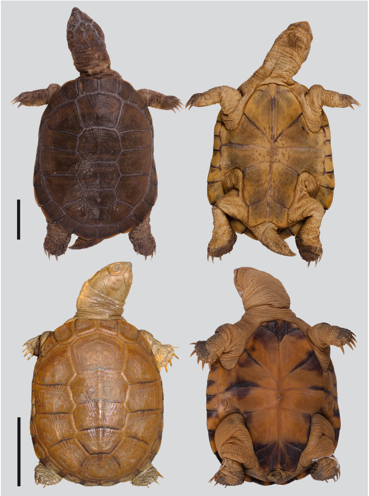
FIGURE 3. Dorsal and ventral aspects of the holotype of Pelomedusa barbata sp. nov. (MTD D 24637, male, Zinjibar, Abyan, Yemen; top) and of the holotype of Pelomedusa kobe sp. nov. (ZSM 334/1978:1, juvenile, Naberera, Manyara, Tanzania; bottom). Scale bars, 3 cm.