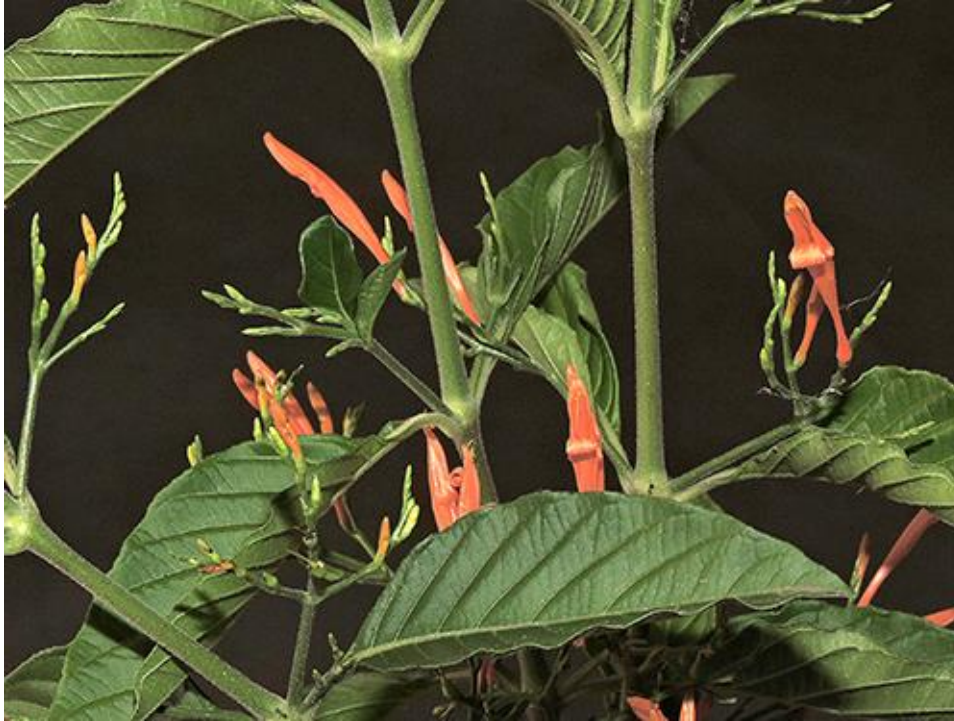
Justicia spicigera

Herbs or shrubs, erect or decumbent, rarely scrambling shrubs; stems terete to nearly