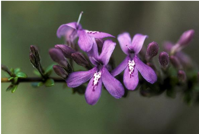
Oplonia microphylla , photo by P. Acevedo.

Erect or scrambling shrubs, usually with opposite, axillary acicular thorns; stems slender