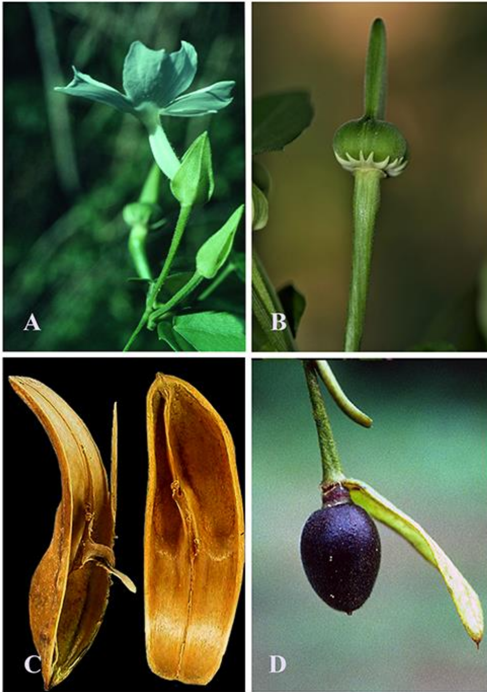
Figure 34. A. Thunbergia fragrans , flower with large bracteoles at base. B. T. fragrans , un-dehiscent capsule. C. Capsule valves showing typical hook-like placental tissue ( Justicia sp. ). D. Mendoncia hoffmannseggiana , drupaceous fruit with a persistent bracteole at base.