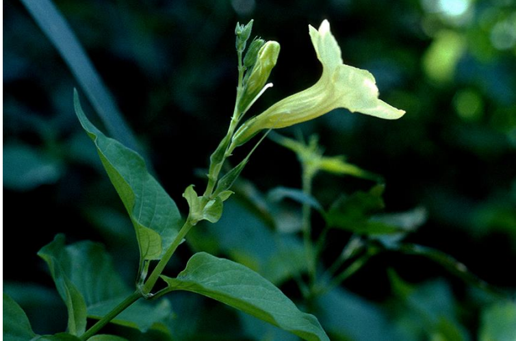
Asystasia gangetica , photo by P. Acevedo.

corolla zygomorphic, pale violet, pink, white, or pale yellow, funnel-shaped, with 5 rounded lobes; stamens 4, didynamous; ovary superior, bicarpellate, bilocular, the stigmas bilobed or capitate. Capsules ellipsoid or claviform; seeds 2–4, lenticular.