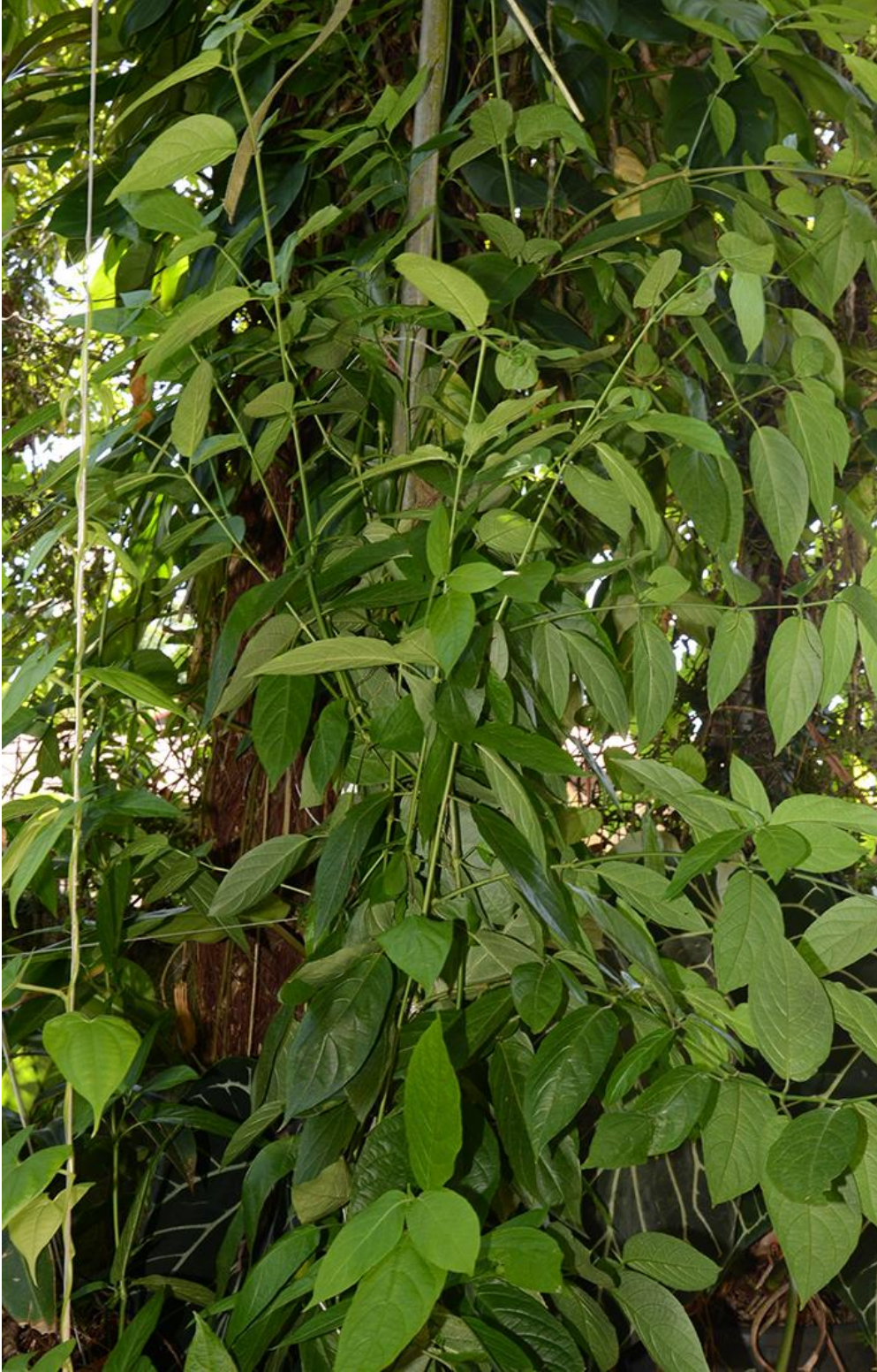
Figure 32. Ruellia inflata . A scrambler with weak, cylindrical stems.