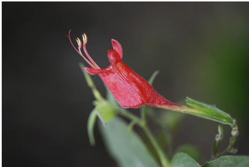
Ruellia inflata , photo by P. Acevedo.

Herbs, subshrubs or shrubs, sometimes scrambling or twining vines. Leaves with numerous, transversely oriented cystoliths, entire to repand-crenulate at margins. Flowers