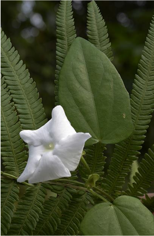
Thunbergia fragrans , photo by P. Acevedo.

Herbaceous or woody twining vines or less frequently erect shrubs; stem cross section (at least in T. grandiflora ) with multiseriate wide rays and interxylary phloem strands that are