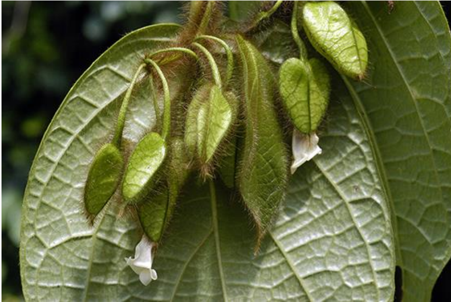
Mendoncia cordata , photo by P. Acevedo.

Herbaceous or woody twining vines; stems articulated and usually quadrangular (Figures 33A; 35) when young, turning terete with age; cross section with fissured stems (Figure 33A, B).