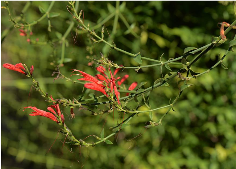
Thysacanthus ramosissimus .

Erect, densely branched shrubs, scrambling shrubs or less often vines; stems terete, < 1