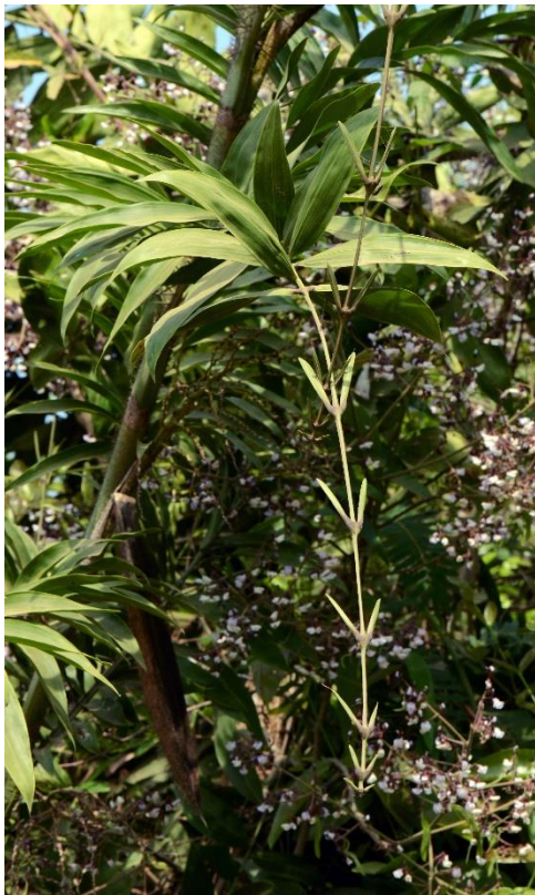
Cirrus of D. leptoclonos

Monoecious, scandent palms, most parts armed with straight sharp spines; climbing through the aid of cirri. Stems cylindrical, reaching 3-10 m in length and up to 3.5 cm in diam.; cross sections with typical monocot atactostele with collateral vascular bundles scattered in the ground tissue; exudate inconspicuous. Leaves alternate, pinnately compound, usually more than 1 m long, commonly distally modified into