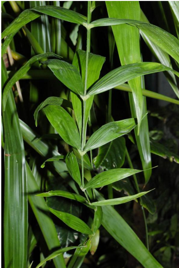
C. elatior

CHAMAEODORA Linnaeus, Sp. Pl. 1032. 1753.