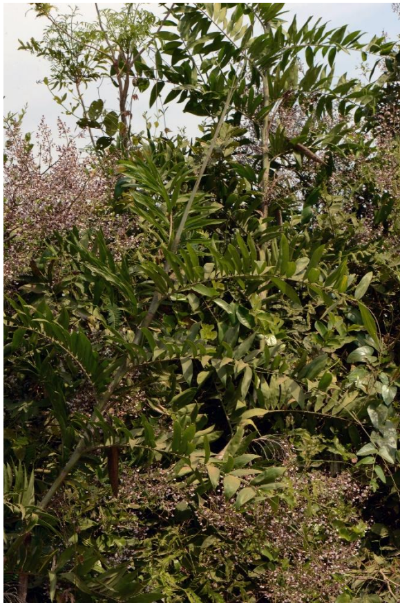
Desmoncus leptoclonos

A tropical family with 182 genera and about 2000 species of large to small, erect, prostrate or acaulescent palms, and less often scrambling lianas, commonly climbing through the aid of cirri or flagella. Climbing Arecaceae in the Old World are found in 11 genera, of which Calamus L. is the largest genus with about 440 species of rattan palms. In the Neotropics, lianas are restricted to Desmoncus and to one species of Chamaedorea . The former climbs through the aid of cirri with hook-shaped acanthophylls while in the latter the distal leaflets are slightly rigid but not modified into acanthophylls (Henderson pers. comm.); they are found in moist, wet, or seasonal lowland forests in continental tropical America.