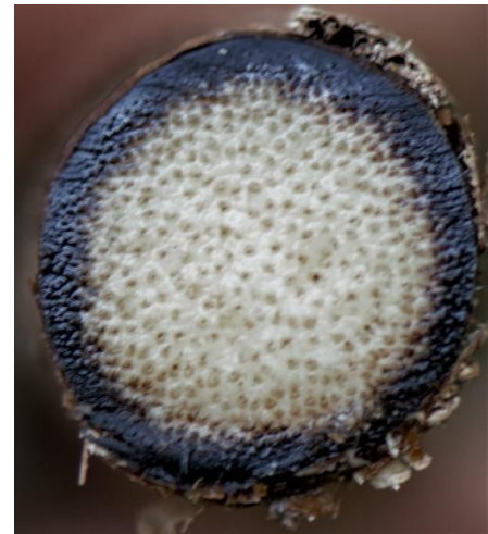
Stem cross section of D. cirrhifer

Monoecious, scandent palms, most parts armed with straight sharp spines; climbing through the aid of cirri. Stems cylindrical, reaching 3-10 m in length and up to 3.5 cm in diam.; cross sections with typical monocot atactostele with collateral vascular bundles scattered in the ground tissue; exudate inconspicuous. Leaves alternate, pinnately compound, usually more than 1 m long, commonly distally modified into