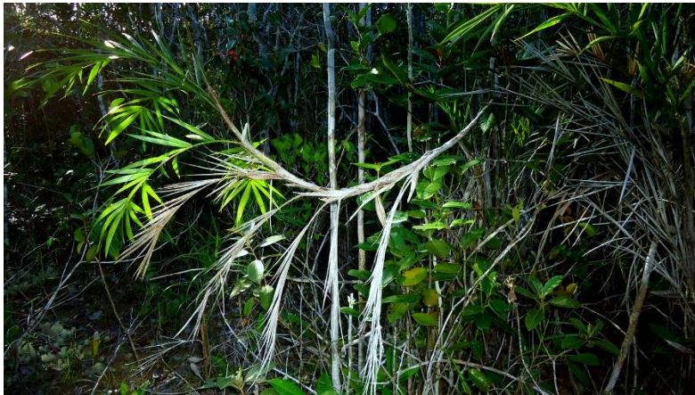
B. glassmanii

BACTRIS Jacquin ex Scopoli, Introd. 70. 1777.