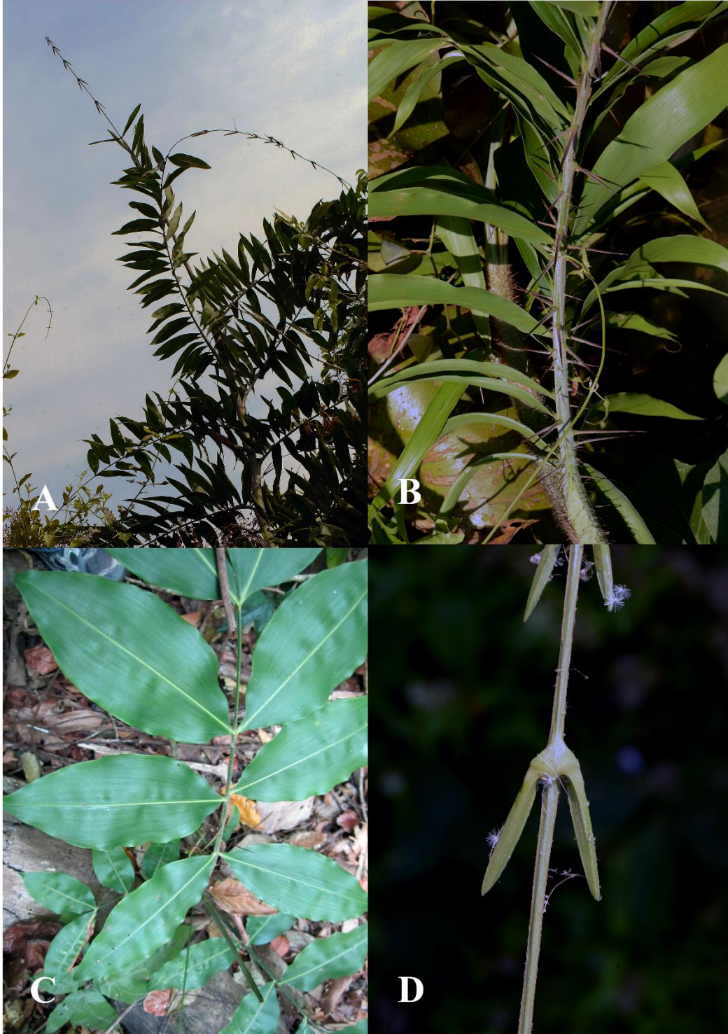
Figure 1. Vegetative organs in Desmoncus . A. Habit of D. leptoclonos with distal portion of leaves modified as cirri. B. Leaf of D. horridus armed with straight sharp spines. C. Juvenile plant of D. myriacanthos . D. Middle portion of cirrus with hook-shaped acanthophylls in D. horridus .