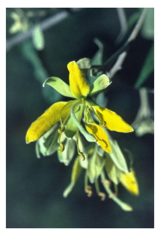
C. tweedieana (Standl.) Iltis & Cornejo

Shrubs or small trees, sometimes clambering shrubs, densely grayish stellate-tomentose throughout; C. yunquerii (Standl.) Iltis & Cornejo clings to surrounding vegetation through the aid of hook-like branches that are made of primary branches that bear short, down-pointing, sharp, secondary branches. Leaves ovate-cordate to reniform, chartaceous to coriaceous, subpalmately veined from base; petioles slender, relatively short. Inflorescence distal on short lateral branches, corymbiform racemes or flowers solitary. Calyx quadrangular, with valvate aestivation; sepals 4, of similar length; petals 4, as long as the sepals, yellow or orange; stamens 4-8; staminodes 1-4