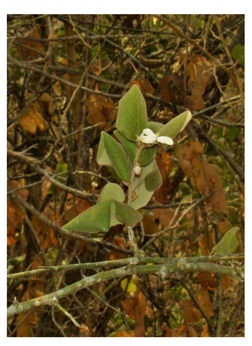
A. yunckeri (Standl.) Cornejo

ACANTHOCAPPARIS Cornejo, Harvard Papers in Botany 45: 43. 2020.