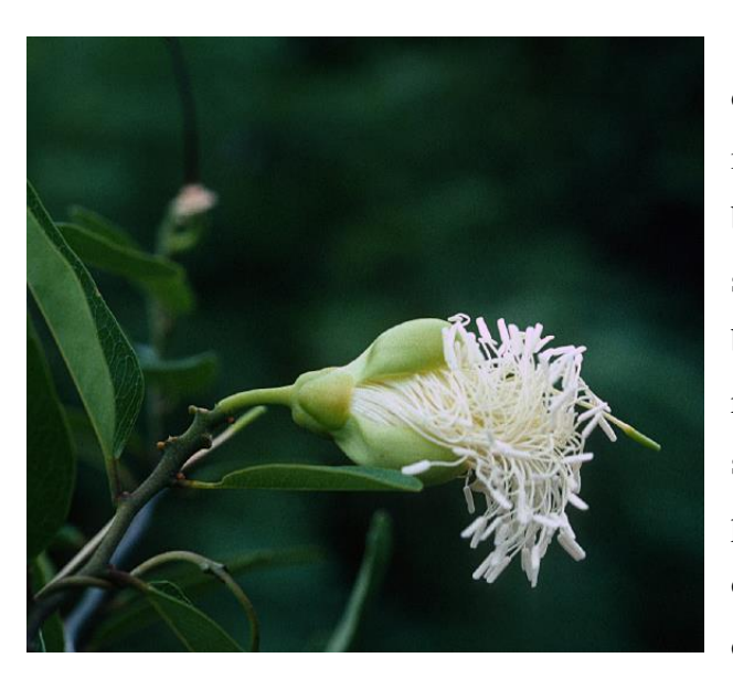
C. flexuosa (L.) J. Presl

CYNOPHALLA (de Candolle) J. Presl, Prirozenosti Rostlin 2: 755. 1825.