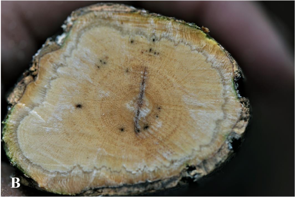
Figure 1 . Cynophalla flexuosa . A . Habit, showing much-branched trunk with scandent branches. B . Cross section of stem showing regular vascular anatomy with shallow phloem wedges.