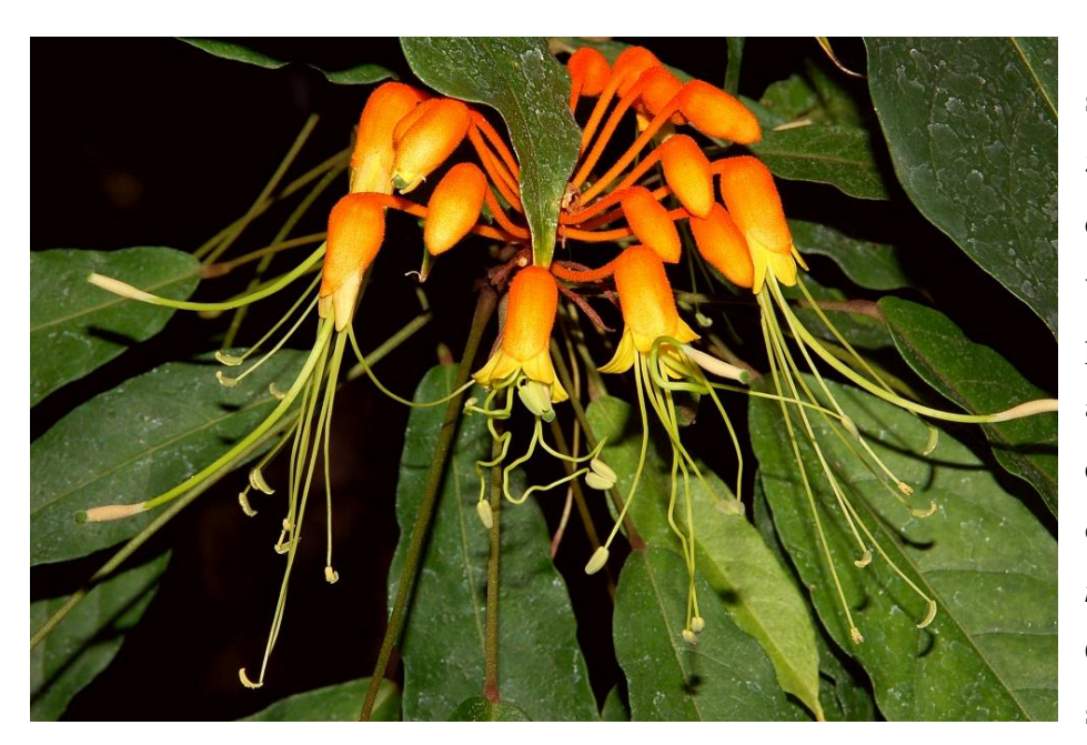
S. paradoxum, photo by Fritz Geller-Grimm / CC BY-SA

STERIPHOMA Sprengel, Syst. Veg. 4(2): 130, 139. 1827, (nom. cons.).