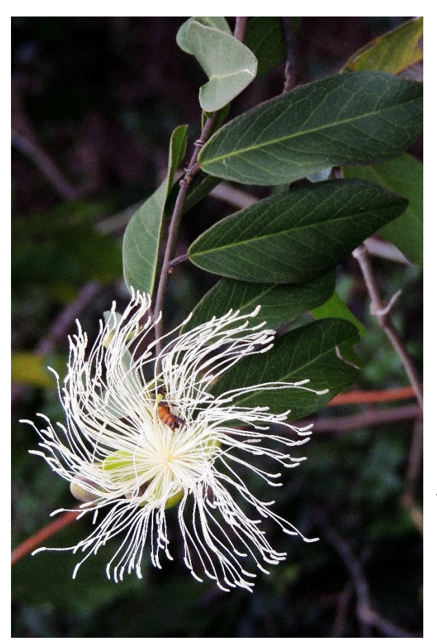
Cynophalla flexuosa Chodat

A pantropical family of 16 to 29 genera and about 420 to 480 species of evergreen shrubs or trees, and exceptionally scrambling shrubs or lianas. In the Neotropics, the family is represented by 22 genera, all of which (except for Crateva ) are endemic of the Western hemisphere. Of the approximately 105 species of Capparaceae in the Neotropics, only 7 species representing 5 genera are reported as scrambling shrubs or lianas. For the most part, they are found in dry or semi-deciduous lowland forest. The most widespread species, Cynophalla flexuosa (L.) J. Presl is found throughout the Neotropics.