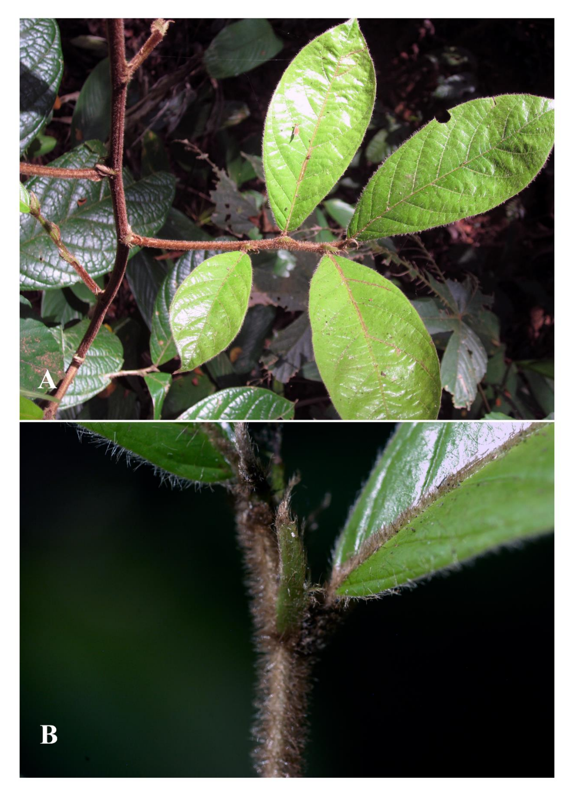
Figure 2 . Dichapetalum donnell-smithii . A . Scrambling shrub with short plagiotropic branches. B . Large fimbriate stipules.