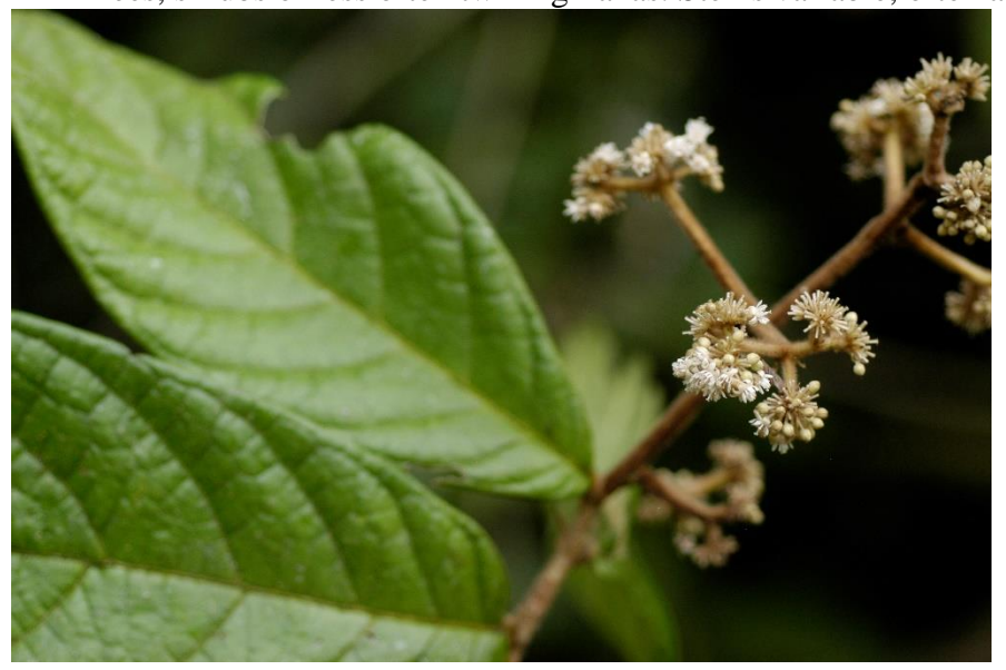
D. rugosum

Trees, shrubs or less often twining lianas. Stems variable, often angled, or striate, with