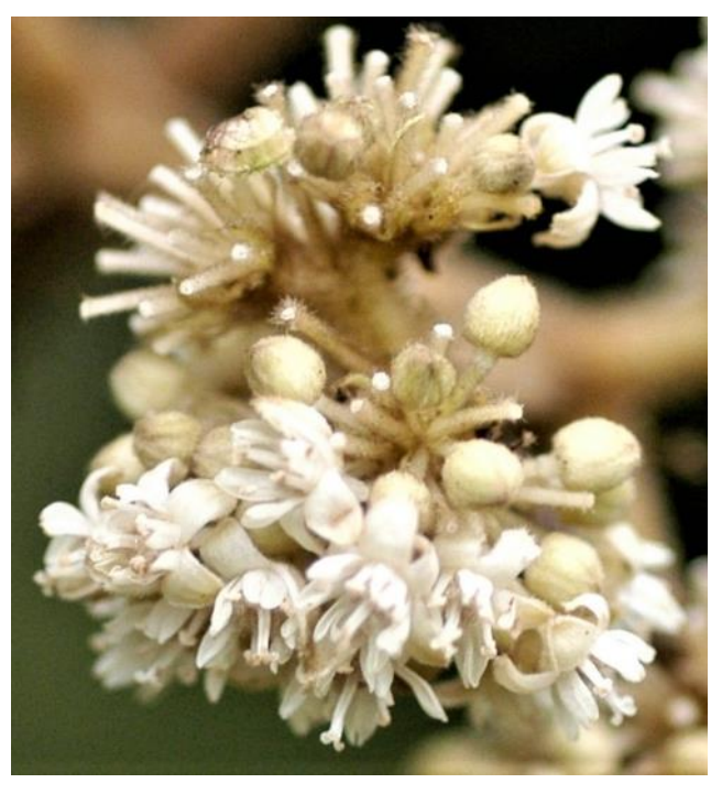
D. rugosum (Vahl) Prance

A pantropical family with 3 genera and about 220 species of trees, shrubs or less often lianas. In the Neotropics, the family is represented by all 3 genera, of which only Dichapetalum and Tapura are reported as having a total of 15 species of lianas. These are found throughout lowlands of the Neotropics from Mexico to Peru and the Brazilian Amazon, but not in the West Indies; in humid non-flooded forests.