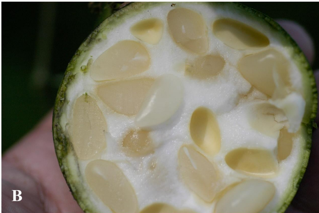
Figure 5. Fruit of Strychnos panamensis . A. Entire mature, fruit. B. Split open fruit, showing seeds and fruit pulp.