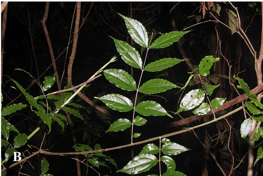
Figure 2. Strychnos sp. A. Young shoot with quadrangular stems and axillary, opposite spines. B. Young plant with short, lateral, alternate branches.