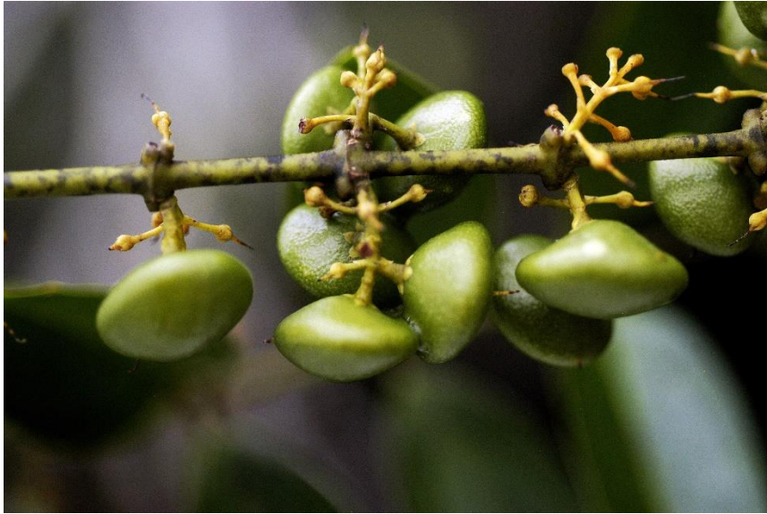
Strychnos sp.

Tendrilled lianas, scrambling or erect shrubs or less often trees. Branches often short, opposite and divaricate. Stems cylindrical or quadrangular when young, smooth or less often with slightly curved opposite spines, reaching up to 10 cm in diam. and 20 to 25 m in length. Leaves