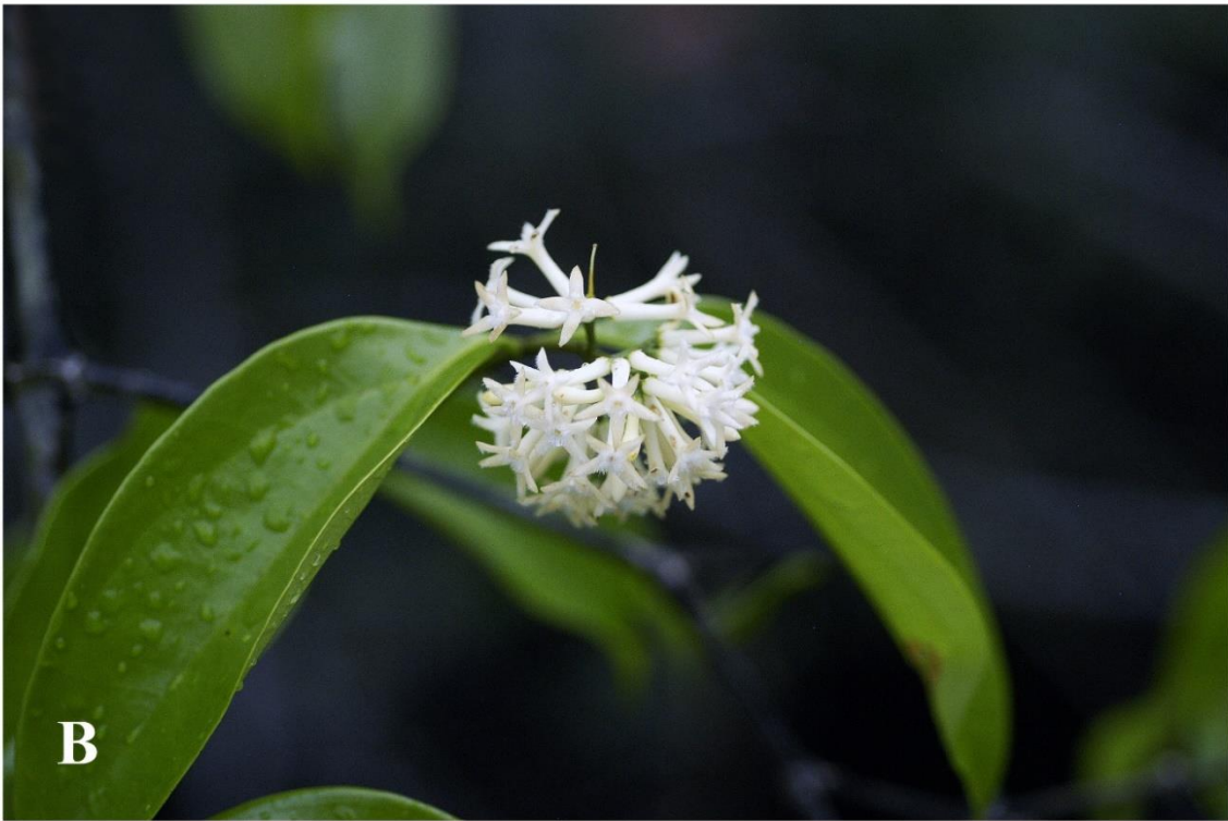
Figure 4. Inflorescences in Strychnos . A. Strychnos sp. B. Strychnos rondeletoides .