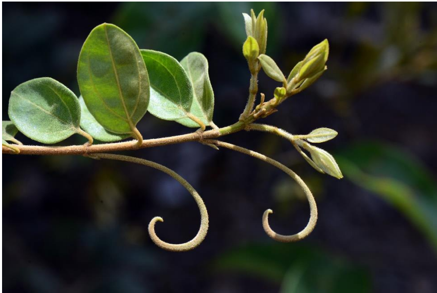
Strychnos guianensis

A pantropical to subtropical family of herbs, shrubs, and tendrilled lianas. The family contains 12 genera and about 400 species; in the Neotropics the family is represented by 5 genera and about 179 species, of which 72 are lianas, all belonging to the genus Strychnos . The genus is found between 100 to 1300