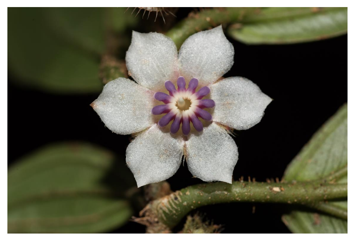
B. ciliata

Distinctive features : Lateral inflorescences, flowers 6-merous, subtended by two pairs of bracts (persistent in fruit), fruit a berry. Many species are very plastic in habit, varying from trees, to lianas or woody, scrambling epiphytes.