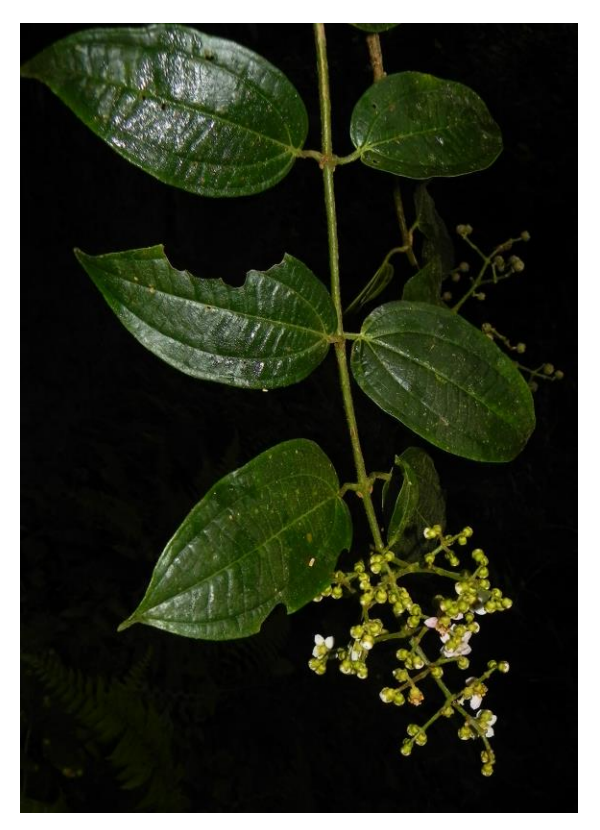
M. loreyoides

MICONIA Ruiz & Pav., Fl. Peruv. Prodr. 60. 1794.