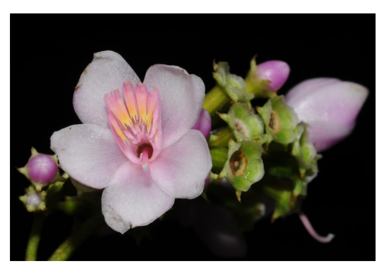
A. adscendens

Lianas, root climbers, shrubs or rarely erect shrubs or trees. Stems terete or obscurely quadrangular, occasionally flattened and often with adventitious roots, especially near the ground. T-shaped trichomes present in most species in young stems, petioles, leaf nerves on the abaxial surface and/or the hypanthium. Leaves isomorphic. Inflorescences terminal or axillary, often paniculate,