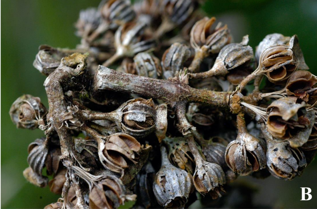
Figure 2. A. Flower in Graffenrieda patens Triana. B. Fruits in Adelobotrys adscendens .