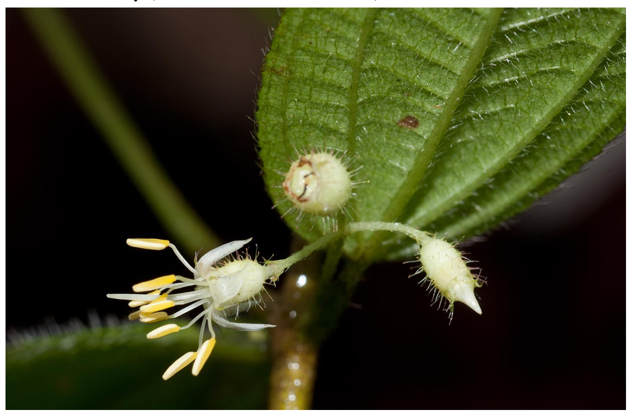
O. araneifera

Herbs, shrubs, twiners or scandent. Leaves isomorphic to strongly dimorphic. Inflorescence axillary. Flowers 4-5(-6)-merous, diplostemonous; petals acute; stamens isomorphic or only slightly dimorphic, the connective not prolonged below the thecae; ovary inferior or partially inferior. Fruit a berry. (see note on tribe Miconieae above).