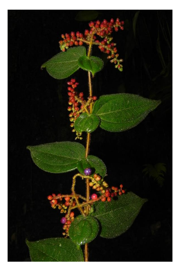
C. garciabarrigae

Herbs, shrubs, or root climbers or twiners. Leaves isomorphic to strongly dimorphic (often in the climbing species), or even with one leaf in each pair missing. Inflorescences lateral or terminal but appearing lateral by overtopping of the lateral meristem (pseudo-lateral inflorescences). Flowers 4-6(-8) merous, diplostemonous; petals round or emarginate; stamens isomorphic or only slightly dimorphic, the connective not prolonged below the thecae; ovary inferior or partially inferior. Fruit a berry. (see note on tribe Miconieae above).