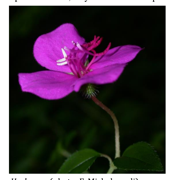
H. elegans

Shrubs and herbs, commonly sprawling or scandent, occasionally scandent. Stems quadrangular or winged, rarely terete. Leaves usually isophyllous, the venation acrodromous and plinerved or with pinnate venation, the secondaries arching towards the apex. Flowers 4-merous, diplostemonous; calyx lobes free and persistent; stamens dimorphic, the antisepalous whorl