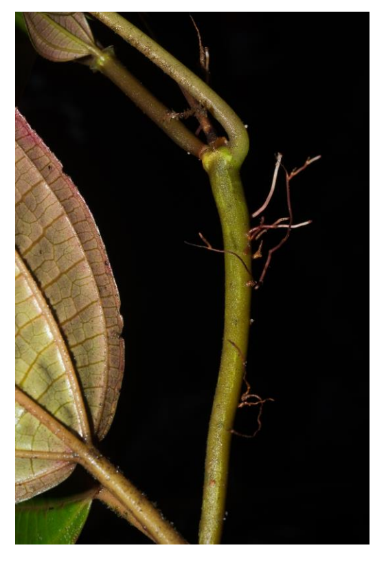
B. ayangannae

Trailing or stoloniferous herbs, sometimes climbing, up to 2 m tall, with terete stems and