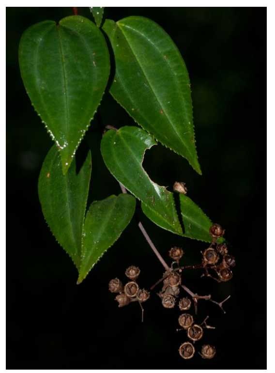
D. spiritusantensis

Shrubs, erect of scandent and even twiners. Leaves isophyllous. Flowers 6-merous; anthers isomorphic, the thecae oblong, the connective not prolonged but with a caudate dorsal appendage at least twice as long as the thecae; ovary superior. Fruit a capsule.