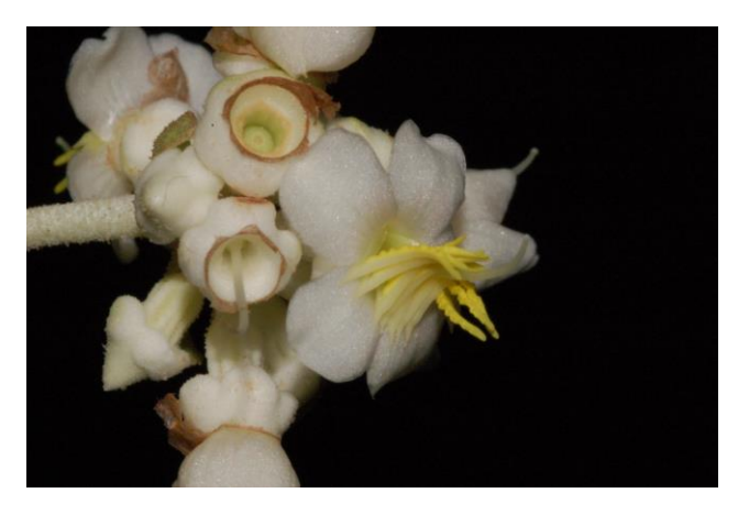
G. patens

Trees, shrubs and more rarely twiners. Leaves isomorphic. Inflorescence terminal, often paniculate, more rarely cymose. Flowers 4-6 merous, diplostemonous; calyx calyptrate or opening either regularly or irregularly at anthesis; petals often acute, more rarely emarginated, usually white, more rarely yellow; anthers isomorphic or slightly dimorphic, usually white or more rarely