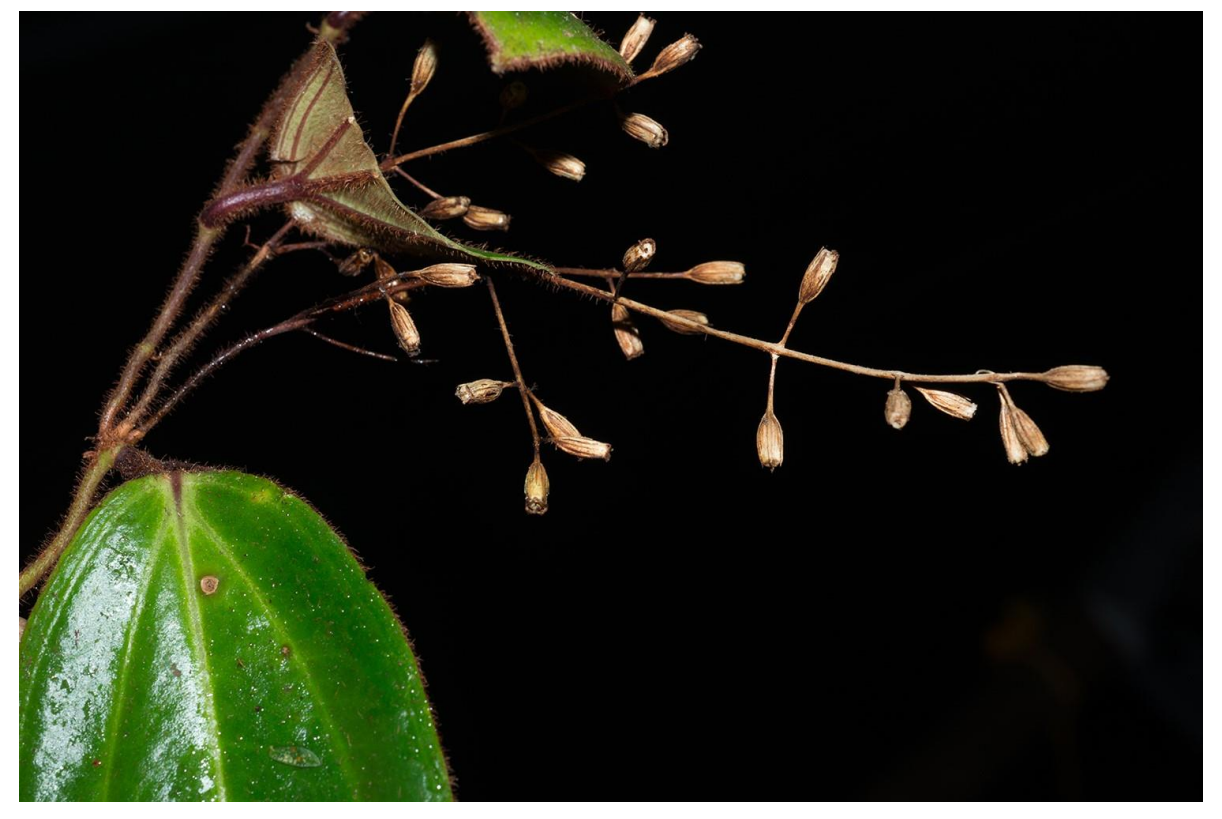
P. laxiflora

Terrestrial herbs, scandent shrubs, root climbers, or epiphytes, usually with adventitious roots at the nodes. Leaves isomorphic, opposite or in whorls of 3, but often appearing alternate by abortion of one leaf per node. Inflorescences axillary or terminal, cymose-paniculate or umbelliform. Flowers 4-merous; calyx hyaline and calyptriform, dehiscing at anthesis; stamens 8, isomorphic or slightly dimorphic, connective not prolonged or only shortly so, with a cordiform or pandurate basal appendage; ovary superior, 4-locular. Fruit a capsule.