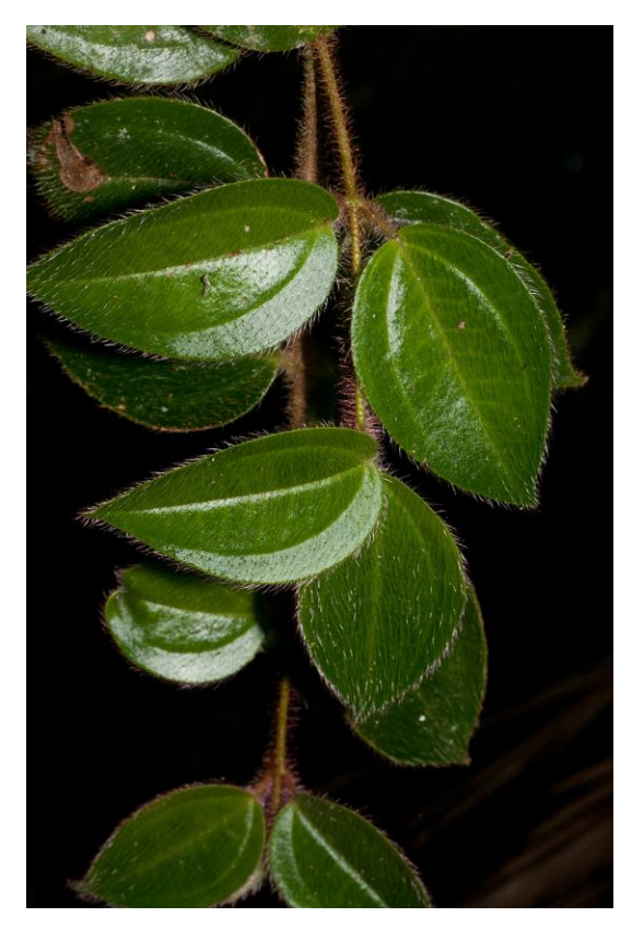
F. blepharodes

PLEIOCHITON Naudin ex A. Gray, U. S. Explor. Exped. Bot. 1: 583. 1854.