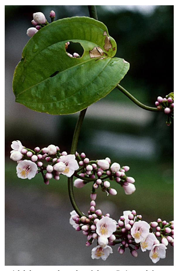
Adelobotrys adscendens

An almost exclusive tropical family of shrubs, trees, herbs, and lianas, represented by ca. 3600 species and ca. 100 genera in the Neotropics. Of these, ca. 100 species from 16 different genera are vines, lianas, or epiphytic climbers. Melastomataceae are most diverse in moist forests throughout the tropics, from sea level to above the tree line in the Andes and other tropical mountains. Vines and lianas are well represented from sea level to about 2900 meters. Most genera contain only a few species of climbers, with the exception of Adelobotrys where most species are vines or lianas, and Phainantha , all climbers or sprawling herbs.