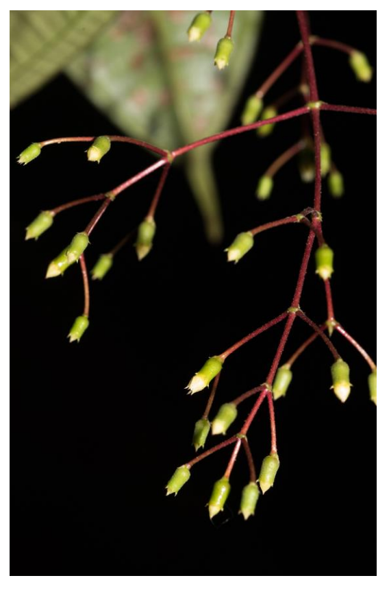
L. candelabrum