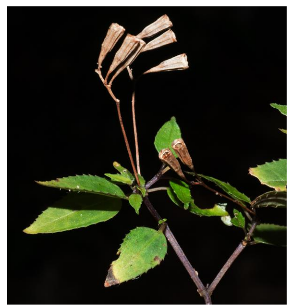
M. fasciculatum

lanceolate or aristate, persistent; stamens isomorphic or nearly so, connective slightly prolonged