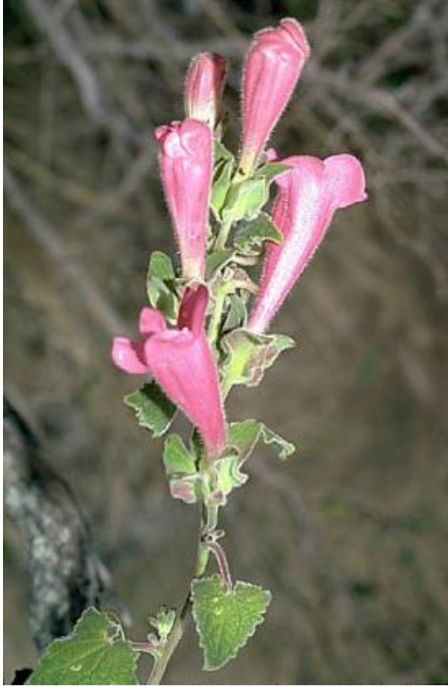
L. erubescens D. Don

stamens included, the filaments incurved, the staminode 1, variable in length; ovary bilocular, glabrous or glandular-pubescent; style terete, included, glabrous or glandular pubescent at base, the stigma recurved. Fruit an ovoid or globose capsule. Seeds rounded, 2-winged, tuberculate with irregular ridges.