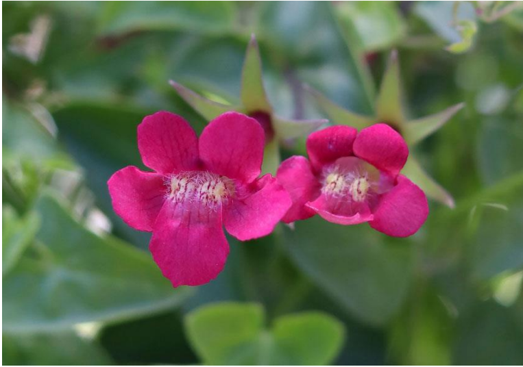
M. antirrhiniflora , photo from Annie's Annuals & Perennial webpage

the limb closed at the throat with well-developed basal palate, the tube not spurred or gibbous at base; fertile stamens included, adnate at base to corolla, the filaments glandular-pubescent, staminode 1, filamentous; ovary glabrous, the two locules markedly unequal; stigma 2-lobed. Fruit a globose capsule with asynchronous, loculicidal dehiscence, the smaller locule dehiscing much later than the larger one. Seeds ovoid to oblong-polygonal, subsymmetrical, tuberculate with irregular ridges, wings absent.