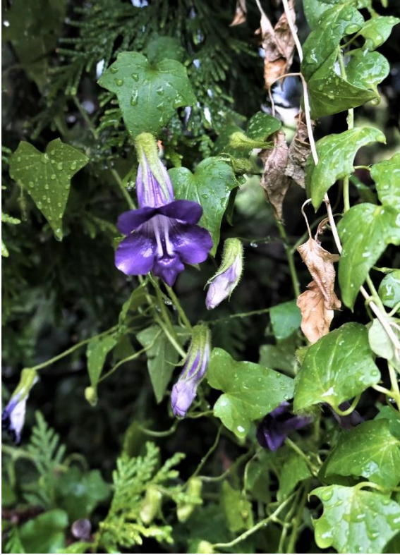
M. scandens