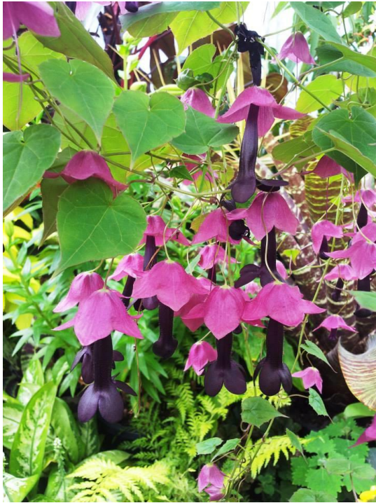
R. astrosanguineum (Zucc.) Rothm.

RHODOCHITON Zucarini ex Otto & A. Dietrich, Verh. Vereins. Beförd. Gartenbaues Königl. Preuss. Staaten 10: 152. 1834.