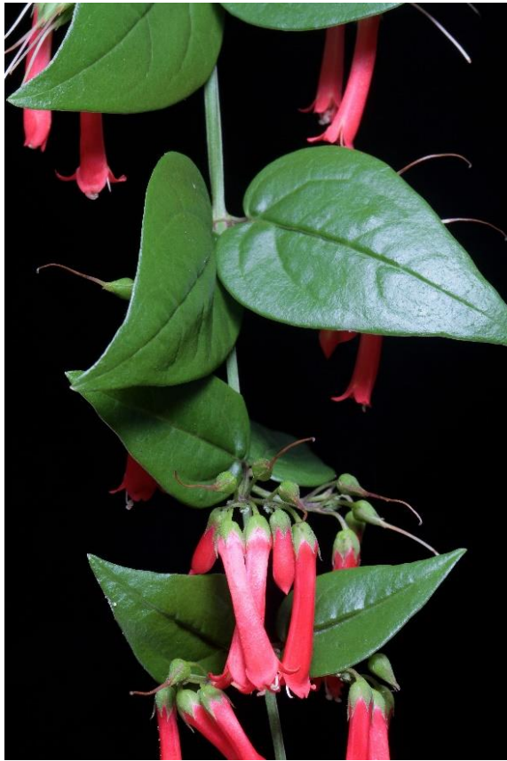
Russelia syringifolia Schlttdl. & Cham.

A widely distributed family of primarily herbs, subshrubs or shrubs with about 100 genera and ca. 1,900 species worldwide. In the Neotropics, they are represented by about 45 genera and ca. 400 species. Five genera and 14 species are treated below as climbing plants. These occur in a diversity of habitats from desert scrub to montane cloud forests.