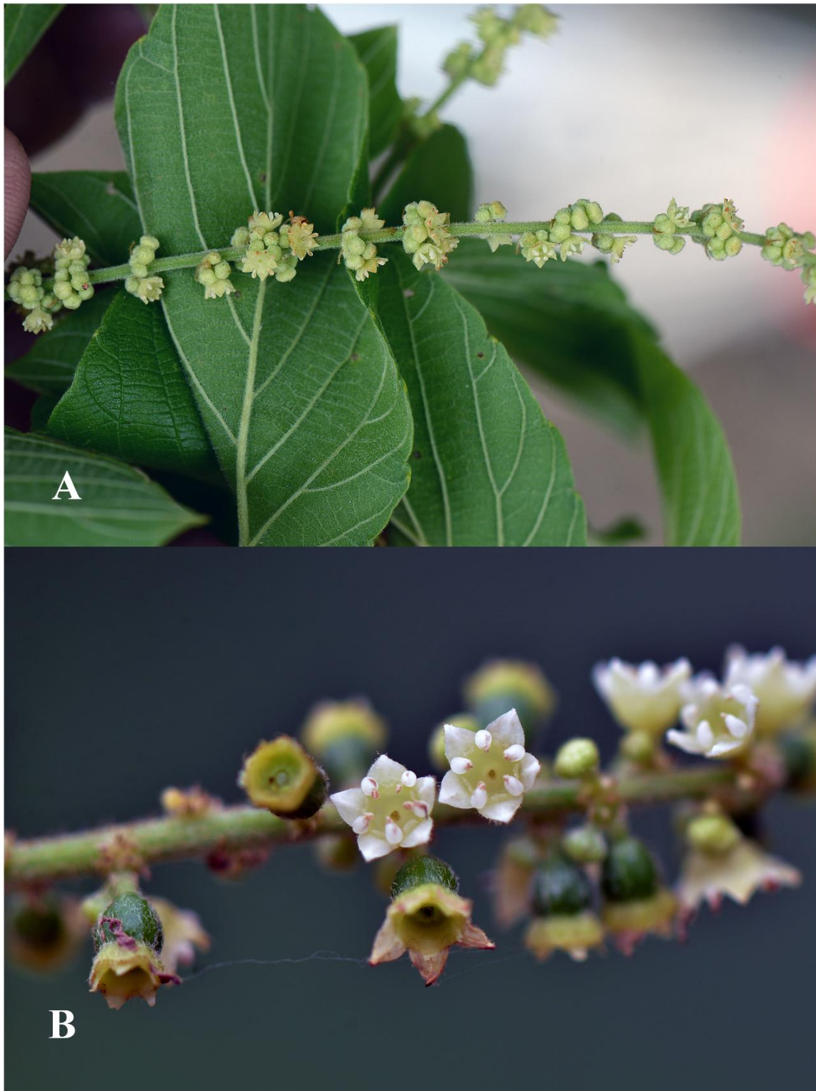
Figure 3. Spicate thyrses in Gouania . A. Gouania polygama , with yellowish green flowers. B. Gouania sp. flowers with green hypanthium and white perianth.