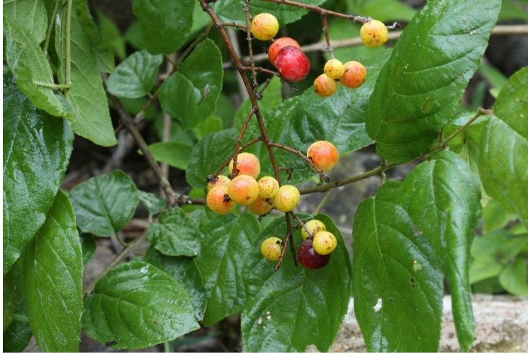
S. elegans , photo by M.O. Montiel.

SAGERETIA Brongniart, Mém. Fam. Rhamnées 52. 1826.