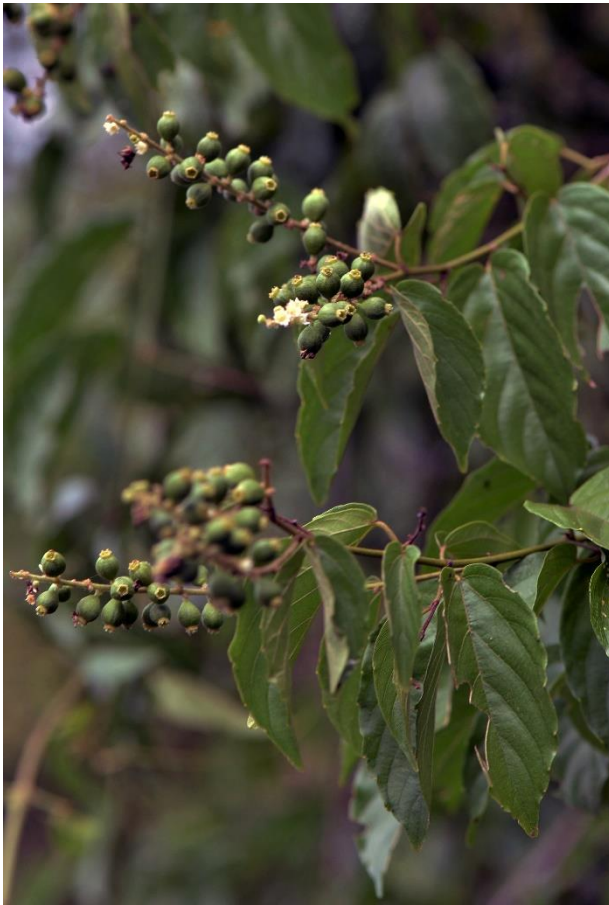
Gouania sp.

A nearly cosmopolitan family of 61 genera and about 900 species of trees, shrubs or lianas. In the Neotropics, the family is represented by 23 genera and 177 species, of which 7 genera and 39 species are reported as lianas or scrambling shrubs. Four of these genera are endemic to the Neotropics, while the remaining three are shared with the Paleotropics.