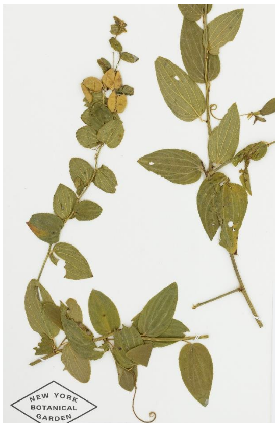
A. tricamerata , photo from isotype at NYBG

ALVIMIANTHA Grey-Wilson, Bradea 2: 287. 1978.