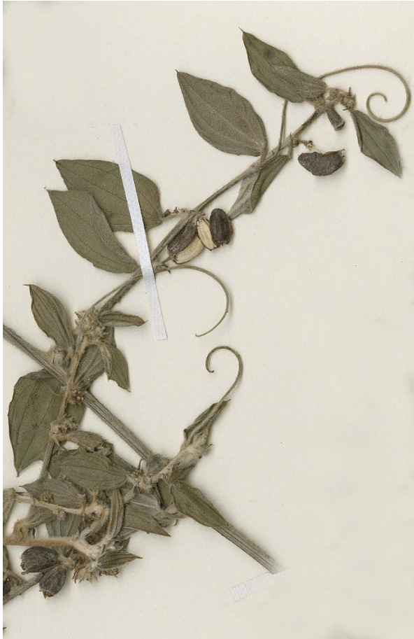
J. axilliflora , from holotype at TEX