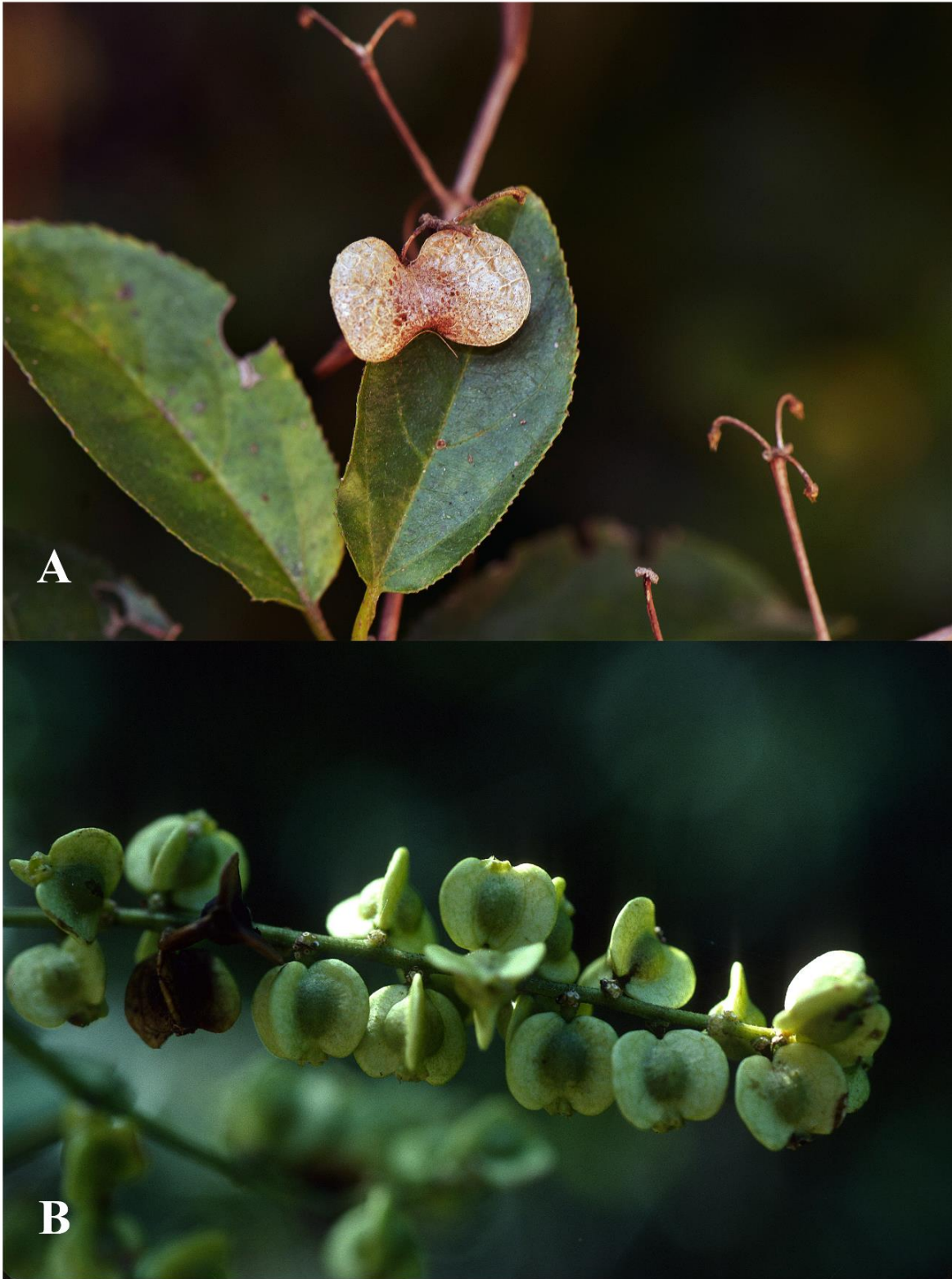
Figure 4. Winged schizocarps in Rhamnaceae. A. Reissekia sp. mericarps membranaceous, slightly inflated. B. Gouania lupuloides . mericarps sub-woody.