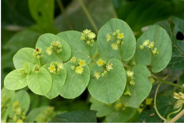
R. smilacina .

Tendrilled lianas. Young stems striate; older stems cylindrical, reaching 12 m in length, ca. 3 cm in diam.; cross section with slightly conspicuous rays and wide vessels; bark light brown and moderately rough forming rectangular plates (fig; 1e). Tendrils simple, circinate, produced at the nodes (middle) of axillary flowering branches.