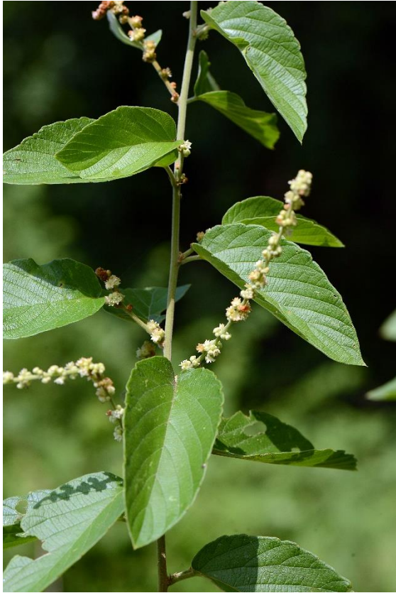
G. polygama (Jacq.) Urb.

GOUANIA Jacquin, Sel. Stirp. Amer. Hist. 263. 1763.