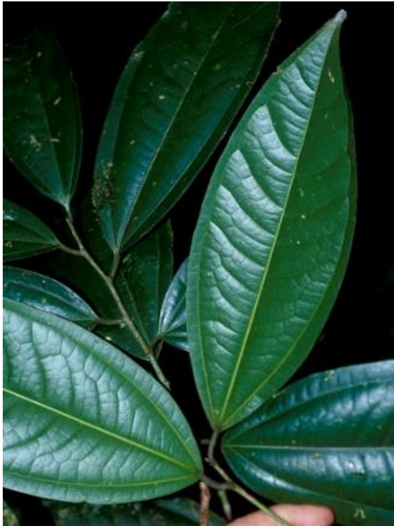
A. amazonicus

AMPELOZIZYPHUS Ducke, Arq. Inst. Biol. Veg. 2: 157. 1935.