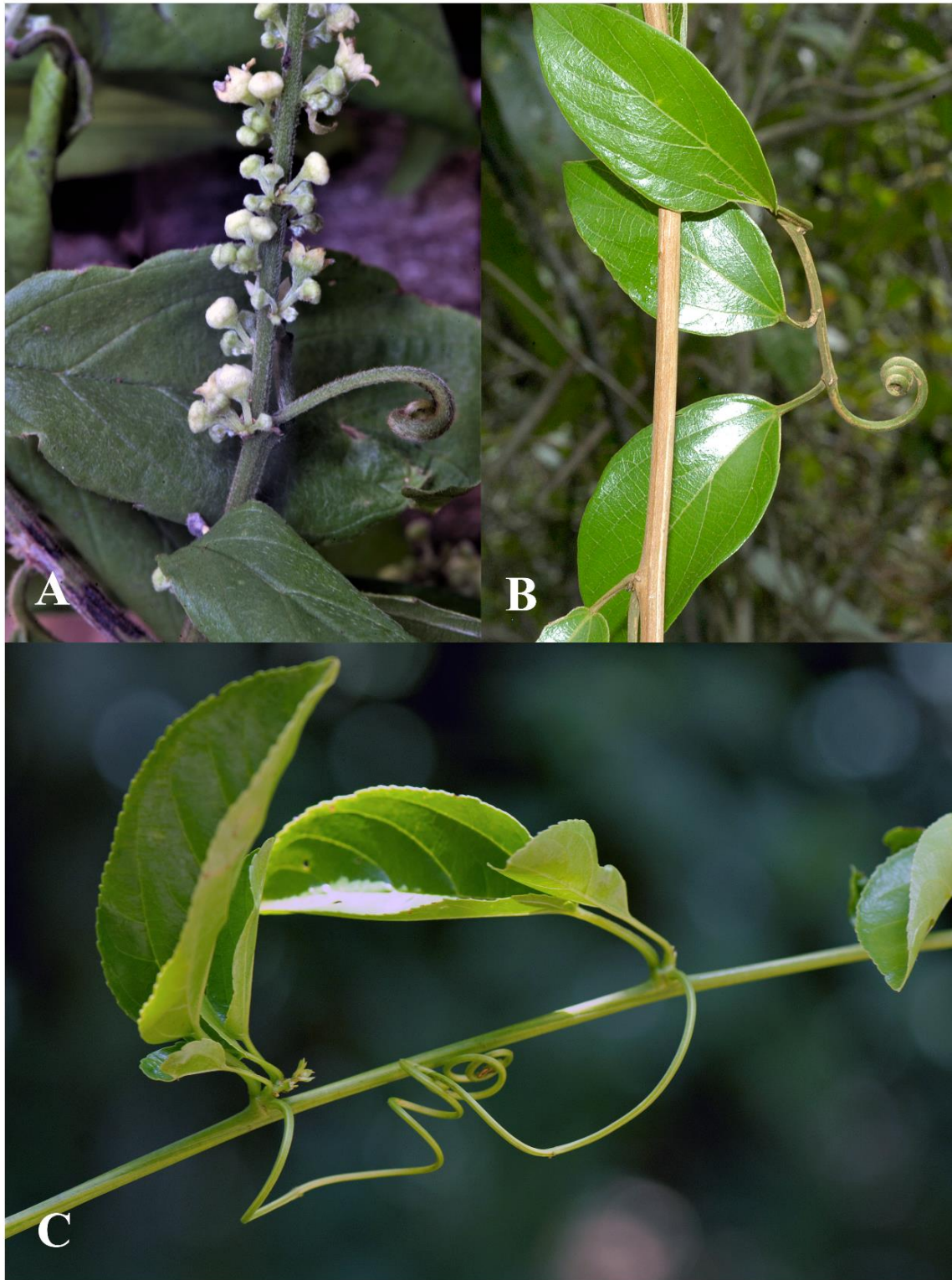
Figure 2. A. Tendrils in Rhamnaceae. Gouania sp. , tendril part of the inflorescence. B. Gouania sp. tendril distal on short lateral branches. C. Reissekia sp. tendrils precociously born on young axillary shoots.