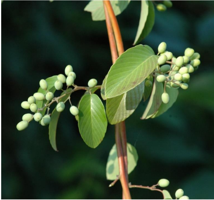
B. scandens (Hill) K. Koch

BERCHEMIA Necker ex A. P. de Candolle, Prodr. 2: 22. 1825, ( nom. cons. ).