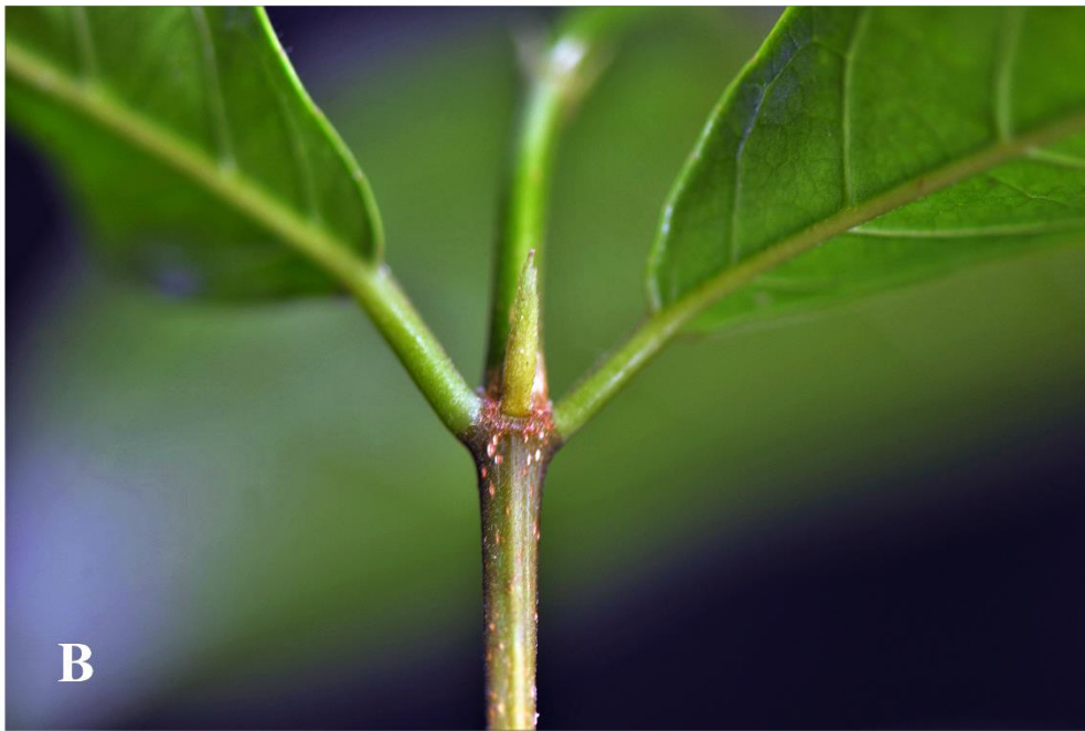
Figure 2. A. Twining stems of Trigonía eriosperma . B. Interpetiolar stipule of Trigonía sp.