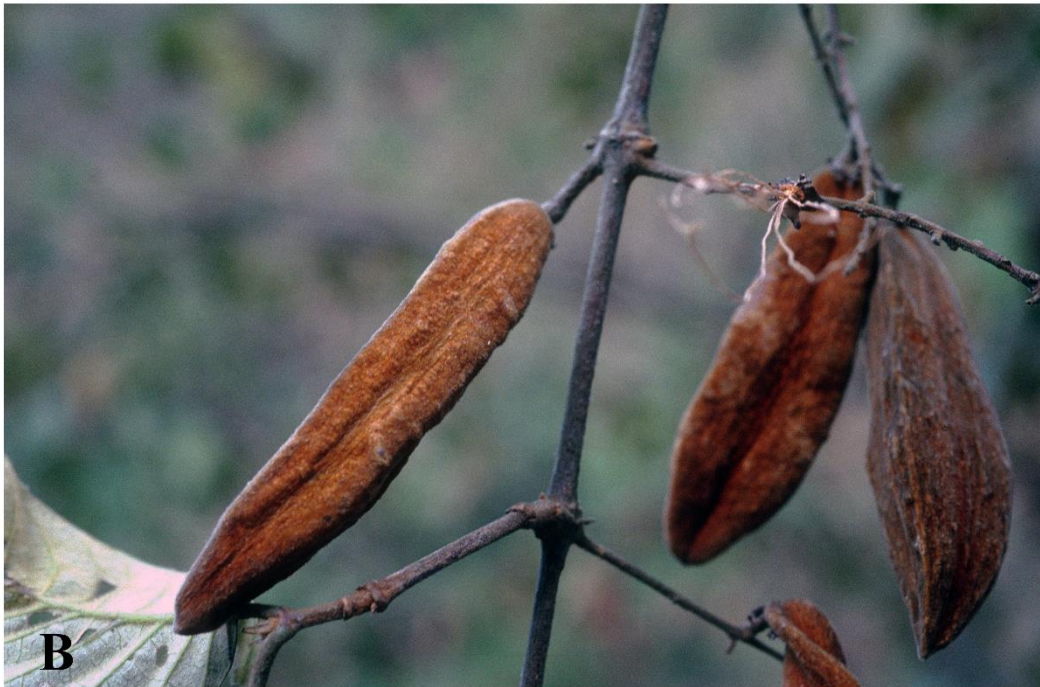
Figure 4. A. Inflorescence with close-up flower of T. virens . B. Capsules of T. floccosa .