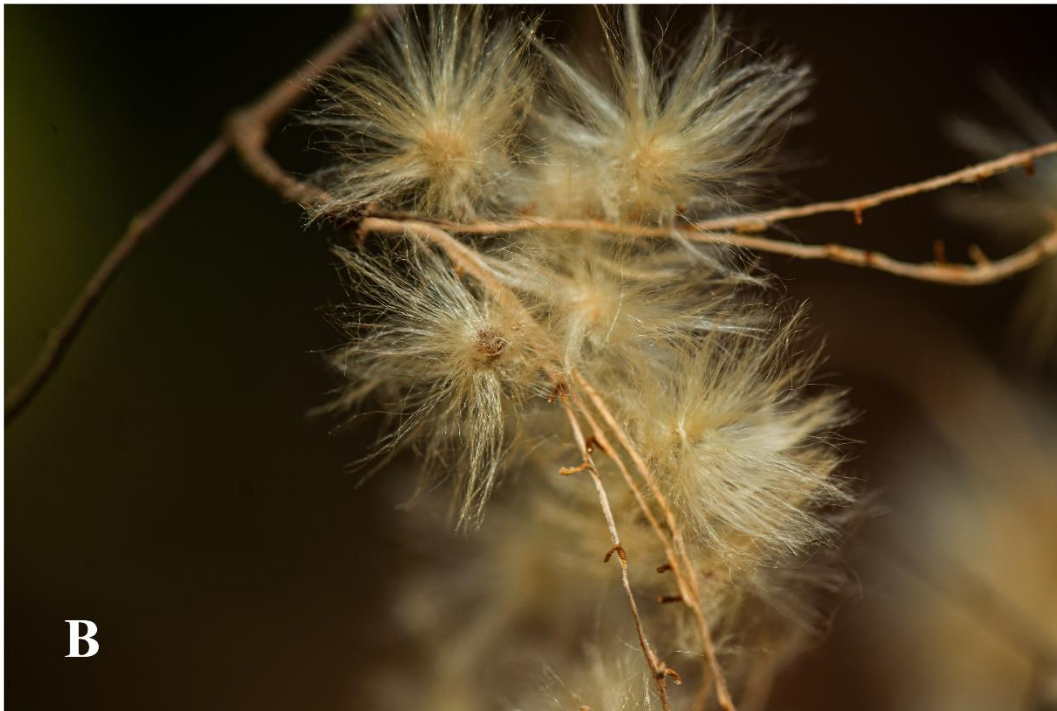
Figure 5. A. Cross section of immature capsule of T. echitofolia . B. Persistent comose seeds on placenta tissue of dehisced capsule of Trigonostemon sp.