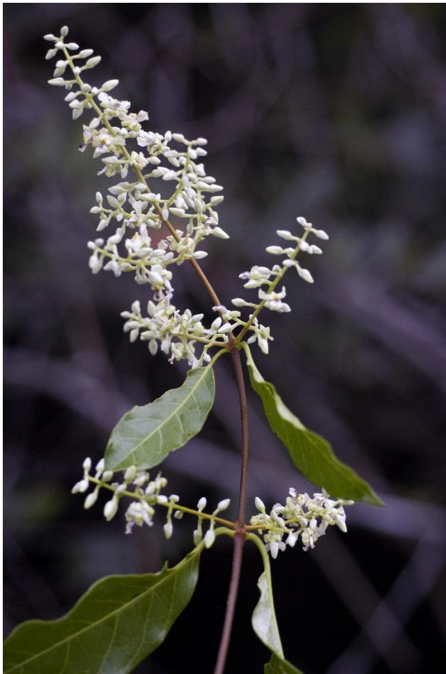
T. spruceana

With the exception of the monotypic genus Hubertiodendron (endemic to Madagascar), the Trigonaceae is a small neotropical family of lianas or trees, consisting of 4 genera and about 32 species. In the Neotropics the family is represented by 3 endemic genera, two of which are monotypic, and the genus Trigonias with a total of 29 species, 25 of which are twining vines or lianas. These are distributed from southern Mexico to southern Brazil, for the most part, they are found in lowland moist or wet forests in flooded or non-flooded habitats.