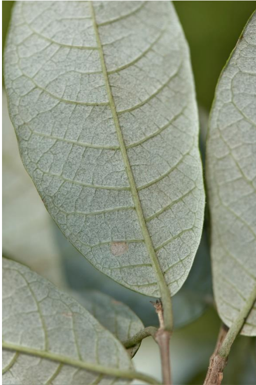
T. nivea , photo by P. Acevedo