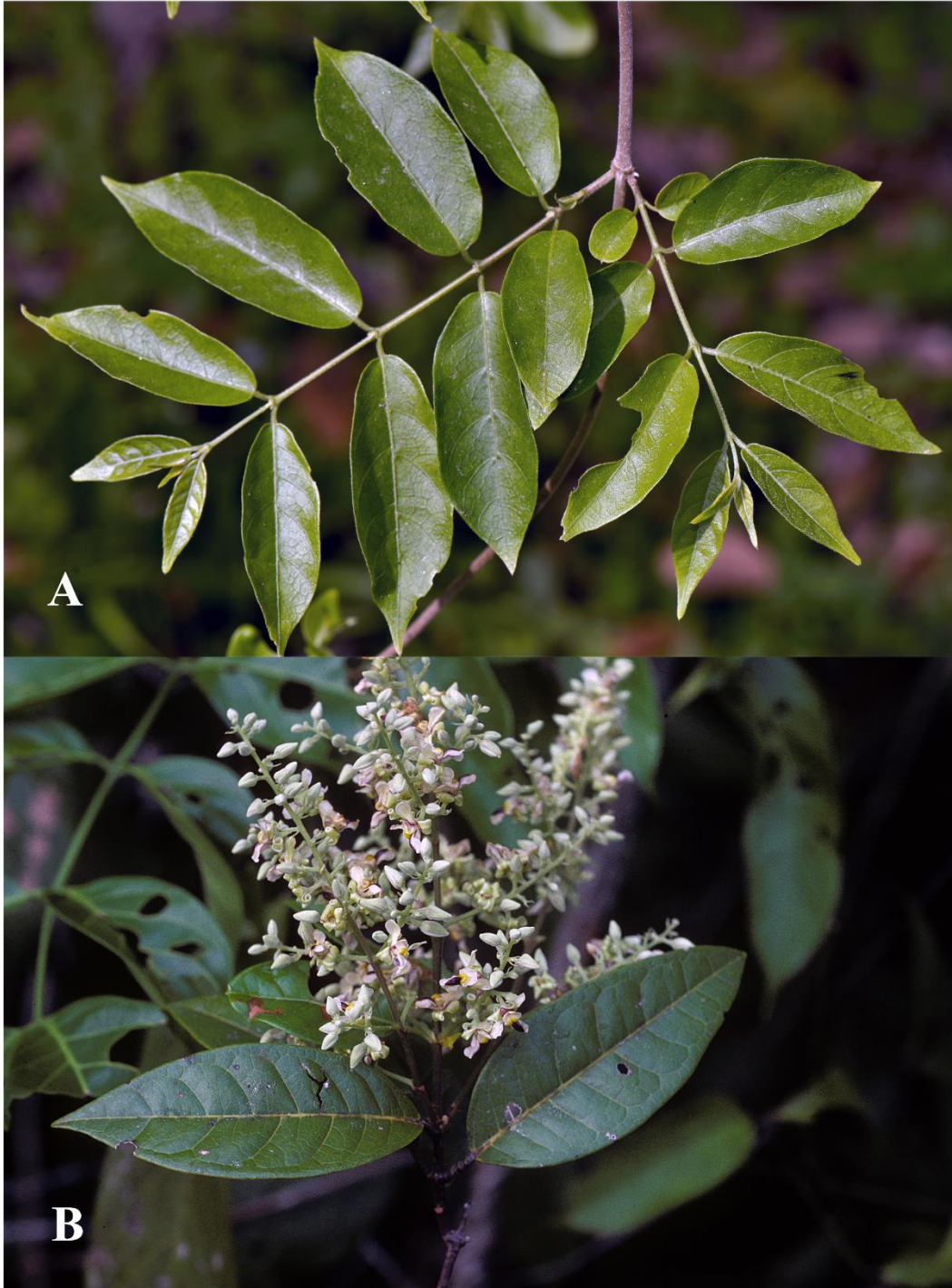
Figure 3. A. Vegetative feature of Trigonía sp., a leading stem with short, opposite branches. B. Paniculate terminal inflorescence of T. virens .