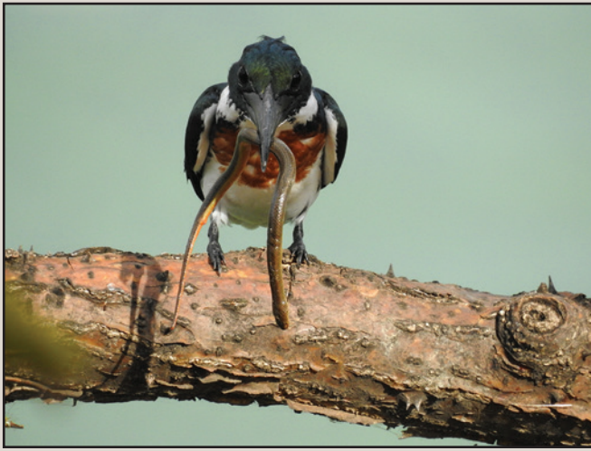
FIG. 1. Helicops modestus in the beak of a male Chloroceryle amazona from Minas Gerais, Brazil.