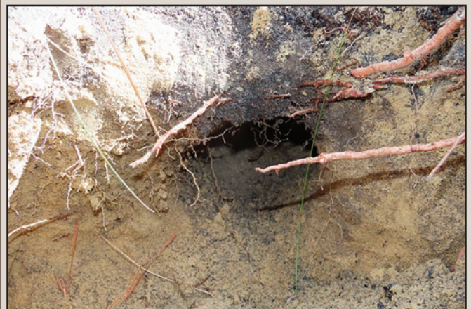
FIG. 2. Excavated nest chamber of Heterodon simus , Scotland County, North Carolina, USA.

open sandhills dominated by P. palustris , Quercus incana (Bluejack Oak), Q. laevis (Turkey Oak), and Aristida stricta (Carolina Wiregrass), and on a two- to three-year prescribed burn rotation. From 6 June to 14 July, she utilized a single burrow of her own construction (Fig. 1) and was found underground in that refugium on 25 dates, and on the surface only twice, during that period. On both occasions observed on the surface (30 June and 1 July) she was basking ca. 5 m from the burrow and still appeared noticeably gravid. Between 15 and 27 July, she used four additional burrows, all within 61 m of the most-used burrow, and on 27 July she was observed active on the surface