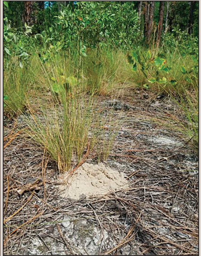
FIG. 1. Burrow used as refugium and nest by Heterodon simus , Scotland County, North Carolina, USA.

On 23 May 2020, one of us (DCS) found a gravid female H. simus (ca. 425 mm SVL, 485 mm total length, 153 g) crossing a sand road (ca. 15 km NW of Wagram, Scotland County, North Carolina, USA). She was confirmed gravid by a radiograph and surgically implanted with a radio transmitter (Holohil SB-2T, Holohil Systems, Ltd., Carp, Ontario) on 26 May 2020, released on 31 May 2020 at point of capture, and monitored frequently (located on 52 of the 71 dates between 1 June and 10 August). For the entire monitoring period, the snake utilized relatively