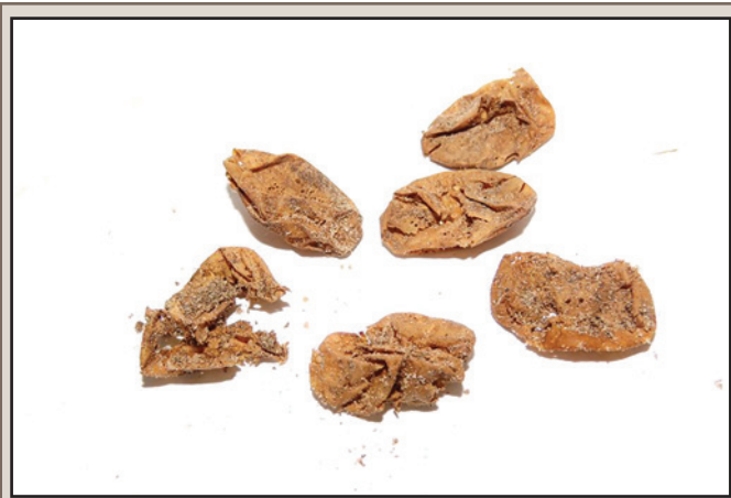
FIG. 3. Eggshells from failed nest of Heterodon simus , Scotland County, North Carolina, USA.

and no longer appeared gravid. On 10 August 2020, she was found dead and partially consumed by a predator. The condition of the remains suggested a raptor.