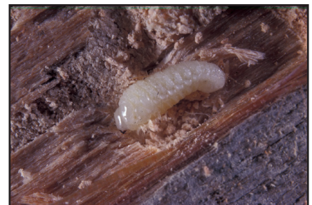
Figure 5. Deathwatch beetle larva.