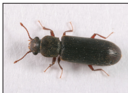
Figure 1. Adult powderpost beetle, Lyctus planicollis .

Powderpost beetles attack hardwoods, apparently because these woods have pores into which they can lay eggs; softwoods don't have such pores. The large pores in bamboo also make it a favored host material for powderpost beetles. In addition to large pore size, powderpost beetles also prefer wood