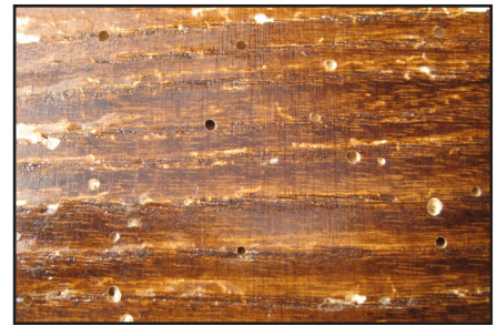
Figure 3. Powderpost beetles leave tiny, round exit holes in wood after they emerge as adults.

Unlike female powderpost and deathwatch beetles, which lay their eggs while on the wood surface, false powderpost beetle females bore a tunnel, or egg gallery, into wood or other ma-