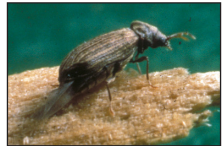
Figure 4. Adult deathwatch beetle.