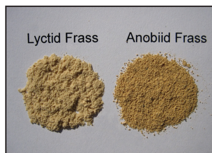
Figure 2. Powderpost beetles produce much finer boring dust (left) than other wood borers such as deathwatch beetles in the family Anobiidae (right).

with high starch content; the starch content in softwoods is nutritionally low for these beetles. They will attack wood that is very dry and that has a moisture content as low as 8%.