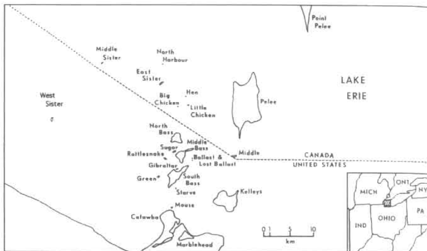
Figure 1. Lake Erie's western basin archipelago.

South Bass Island is a notable exception. Permanent structures have been built recently, primarily in forested areas. The history of severe perturbation in this region has no doubt altered the composition of the beetle fauna.