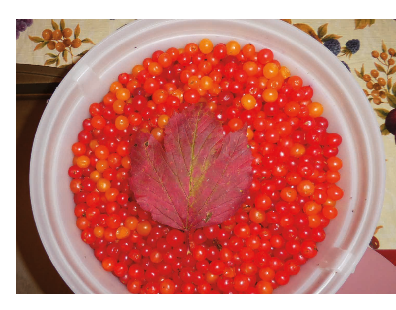
Low Bush-Cranberry. J. Potter.

Almost no fluff (seeds) from aspen or balsam poplar. By far the best crop of 'low bush-cranberries' (Viburnum edule) ever. No frost when saskatoon was blooming, but that berry crop mostly poor.