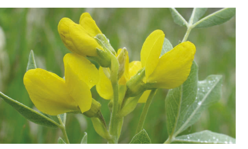
Buffalo-Bean. Linda Kershaw.

Winter was rather mild with only 1 harsh week of -30° C temperatures in January. Fruit trees were very slow at leafing out, particularly sour cherries and apples. By end of summer, it was obvious that the more-mature sour cherry trees had died to the base, but a mess of new shoots did come up. Junipers were terrible, and I heard Edmonton had their worst winter on conifers. My buffalo-bean patch is now large and stunning; enough to keep a couple lovely bumble bees very busy.