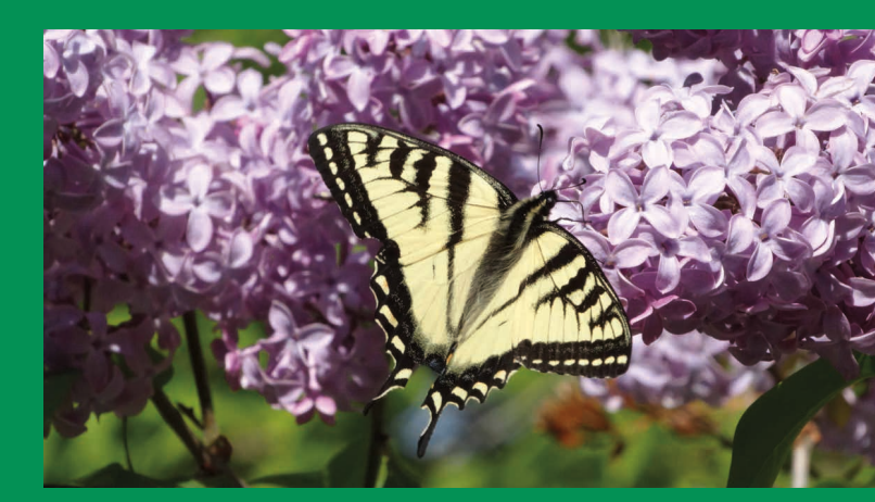
Swallowtail butterfly on lilac. Linda Kershaw.

Swallowtail butterflies were abundant this year. Many locations, including the south and the mountains, had spectacular wildflowers!