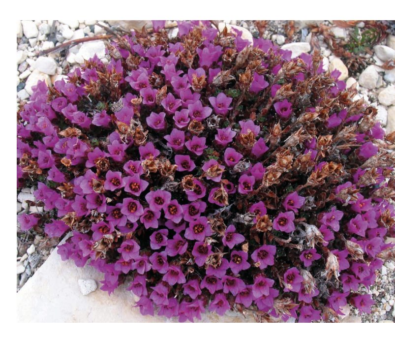
Purple Saxifrage. Linda Kershaw.

Snow cover lasted until late May. Early spring temperatures were 3-5 C° colder than the 13-year average. Some very cold temperatures in spring and summer. Flowering started late! Purple saxifrage was 6 days later than usual. White dryad, and moss campion bloomed at the average time and the peak flowering lasted a long time.