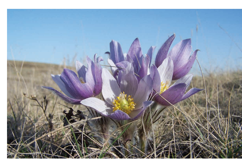
Prairie Crocus. Linda Klassen.

Two plots with prairie crocus bloomed May 14 and 19. Both plots were browsed by bison.