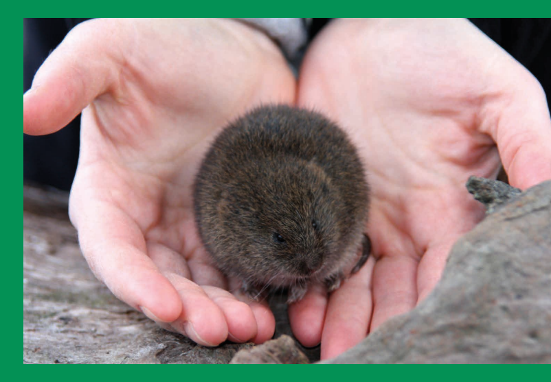
Meadow Vole.

Voles were abundant in the winter of 2019-2020, and tunnels in the grass were visible the next spring. J. McGregor says "Meadow voles (Microtus pennsylvanicus) reproduce abundantly under a thick snow cover. Voles are God's food supply for coyotes, owls, hawks, and foxes. To prevent damage to shrubs like Nanking cherry, just put fine wire mesh around the base of shrubs and trees. The lawn might look a bit tunneled when the snow melts, but it grows quickly with all that mouse-manure fertilizer. At least voles stay outside and don't like to move into human buildings!"