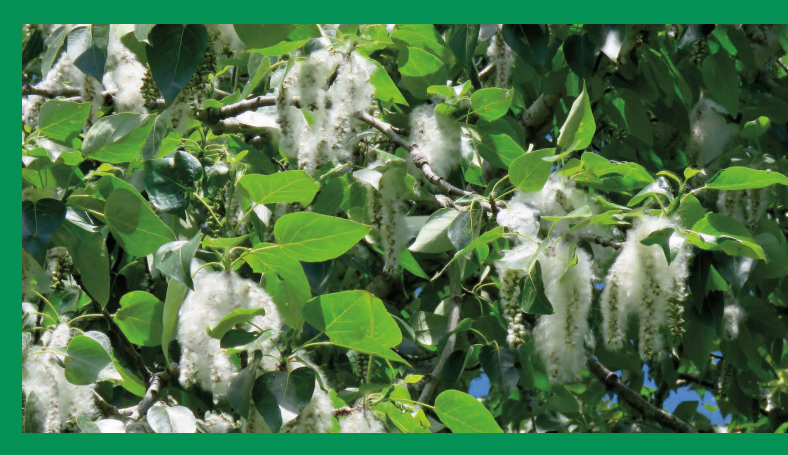
Balsam Poplar Seeds. Linda Kershaw.

The crop of saskatoon berries (and apples too) was poor across most of Alberta. On the other hand, parts of central Alberta had an unusually good pin cherry crop. As well, near Edmonton, female balsam poplars produced huge seed catkins that looked like fluffy sheep tails!