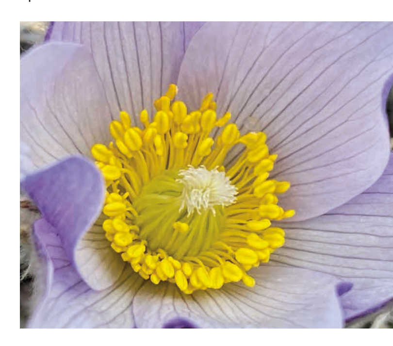
Prarie Crocus.

Of my 17 years of records, this was the latest for prairie crocus first bloom (April 27). The start of the 'spring explosion' of blooms was about a week later than usual (May 15). Despite the late start and rain, we had the greatest profusion of blooms in the 50+ species I have observed over 2 decades.