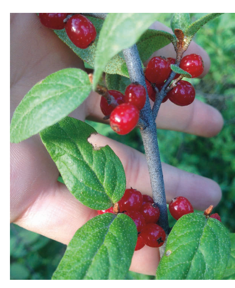
Buffaloberries. Milena McWatt.

Cold, wet spring. Unsettled weather in June-July, with periods of rain and flooding. Abundant blooming on native plants. Few chokecherries and saskatoons, but Canada buffaloberry had abundant berries. Also, good fruit on raspberry, strawberry and dwarf blueberry, - we left lots for the grouse and coyotes, etc.! Abundant bees, butterflies, mosquitoes, dragonflies etc., so a constant, delightful 'thrum' of nature on the property (much boreal forest, never logged). Many ground-nesting bees in an old pasture being restored to forest.