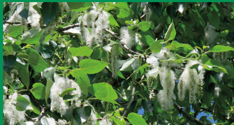
Balsam Poplar Seeds. Linda Kershaw.

The crop of saskatoon berries (and apples too) was poor across most of Alberta. On the other hand, parts of central Alberta had an unusually good pin cherry crop. As well, near Edmonton, female balsam poplars produced huge seed catkins that looked like fluffy sheep tails!