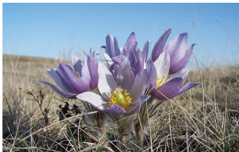
Prairie Crocus. Linda Klassen.

Two plots with prairie crocus bloomed May 14 and 19. Both plots were browsed by bison.