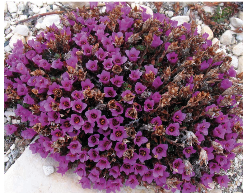
Purple Saxifrage. Linda Kershaw.

Snow cover lasted until late May. Early spring temperatures were 3-5 C° colder than the 13-year average. Some very cold temperatures in spring and summer. Flowering started late! Purple saxifrage was 6 days later than usual. White dryad, and moss campion bloomed at the average time and the peak flowering lasted a long time.