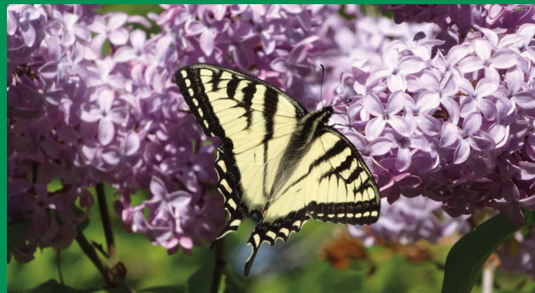
Swallowtail butterfly on lilac. Linda Kershaw.

Swallowtail butterflies were abundant this year. Many locations, including the south and the mountains, had spectacular wildflowers!