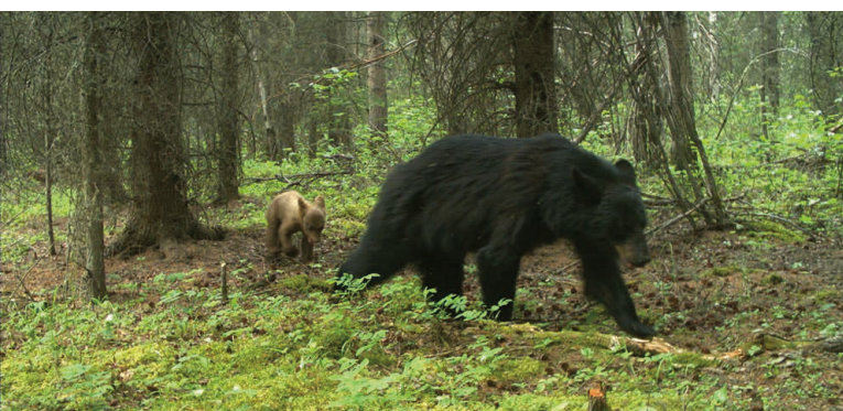
Black bear and cub.