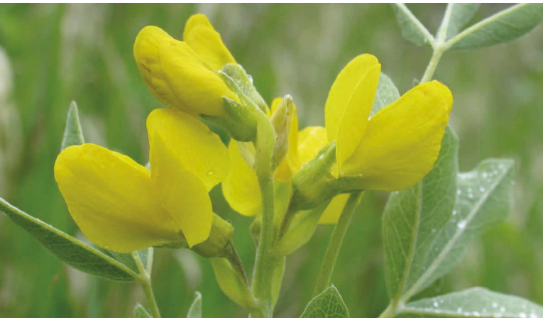
Buffalo-Bean. Linda Kershaw.

Winter was rather mild with only 1 harsh week of -30° C temperatures in January. Fruit trees were very slow at leafing out, particularly sour cherries and apples. By end of summer, it was obvious that the more-mature sour cherry trees had died to the base, but a mess of new shoots did come up. Junipers were terrible, and I heard Edmonton had their worst winter on conifers. My buffalo-bean patch is now large and stunning; enough to keep a couple lovely bumble bees very busy.