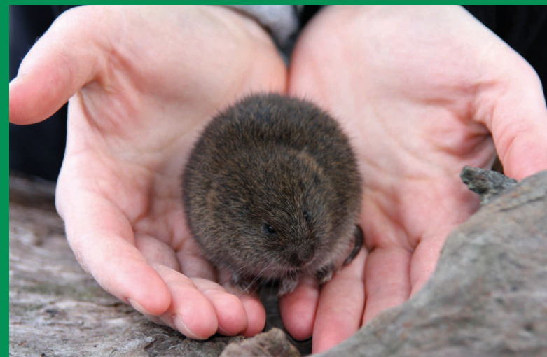
Meadow Vole.

Voles were abundant in the winter of 2019-2020, and tunnels in the grass were visible the next spring. J. McGregor says "Meadow voles ( Microtus pennsylvanicus ) reproduce abundantly under a thick snow cover. Voles are God's food supply for coyotes, owls, hawks, and foxes. To prevent damage to shrubs like Nanking cherry, just put fine wire mesh around the base of shrubs and trees. The lawn might look a bit tunneled when the snow melts, but it grows quickly with all that mouse-manure fertilizer. At least voles stay outside and don't like to move into human buildings!"