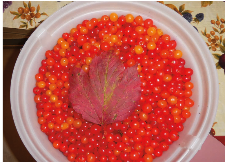
Low Bush-Cranberry. J. Potter.

Almost no fluff (seeds) from aspen or balsam poplar. By far the best crop of 'low bush-cranberries' ( Viburnum edule ) ever. No frost when saskatoon was blooming, but that berry crop mostly poor.