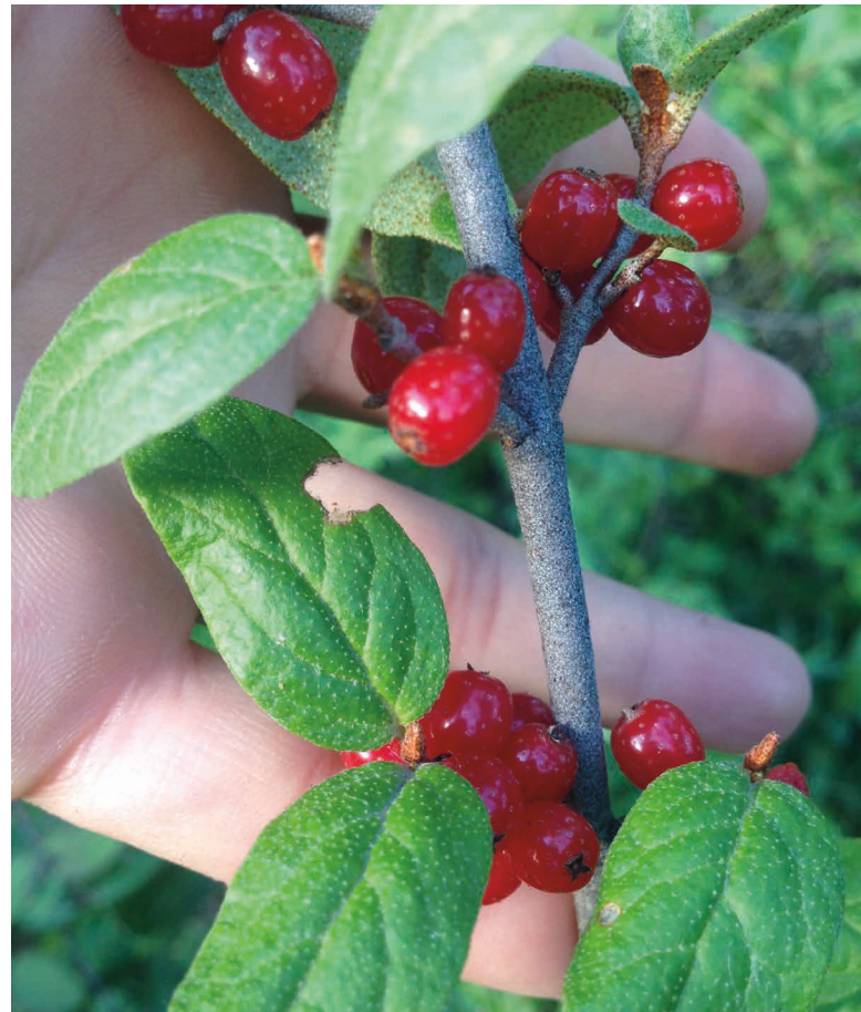
Buffaloberries. Milena McWatt.

Cold, wet spring. Unsettled weather in June-July, with periods of rain and flooding. Abundant blooming on native plants. Few chokecherries and saskatoons, but Canada buffaloberry had abundant berries. Also, good fruit on raspberry, strawberry and dwarf blueberry, - we left lots for the grouse and coyotes, etc.! Abundant bees, butterflies, mosquitoes, dragonflies etc., so a constant, delightful 'thrum' of nature on the property (much boreal forest, never logged). Many ground-nesting bees in an old pasture being restored to forest.