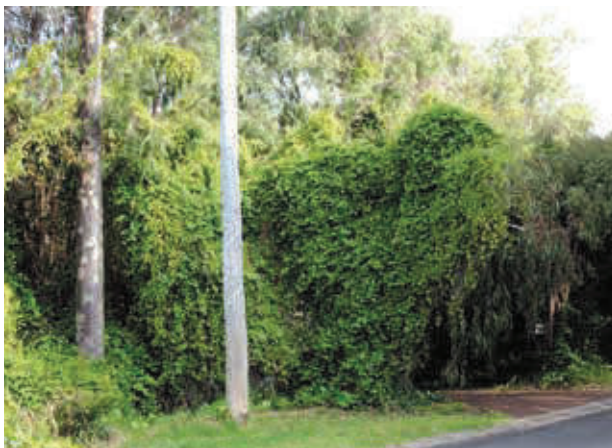
Margaret River townscape streetscape - weeds include Spotted Gum, Ironbark, Victorian Tea Tree, Dolichos Pea, Morning Glory, Ivy.