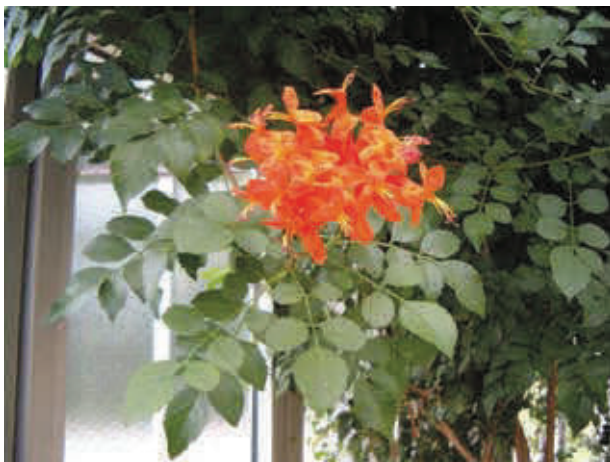
Cape Honeysuckle, Tecoma capensis