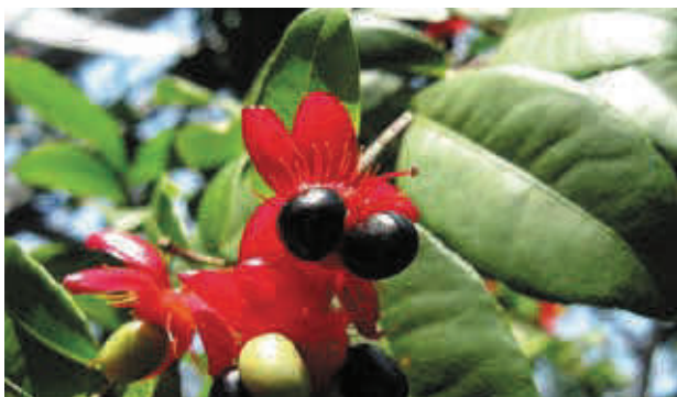
Mickey Mouse Plant, Ochna Serrulata