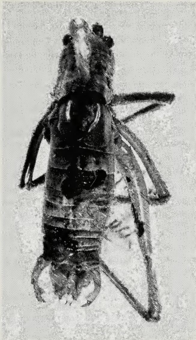
Fig. 7. Metaplasia pandaceos Werner, ♂ holotype (presumably).

(Cejchan, 1963); 20. Skopska Crna Gora: Ljubanci & Sv. Bogorodica (Karaman, 1960).