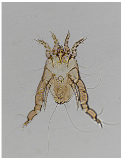
13. Analges turdinus