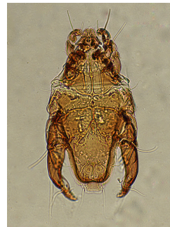
30. Myocastorobia myocastor