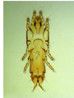
27. Trouessartia rubecula