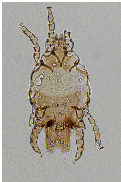
10. Pseudalloptinus aquilinus