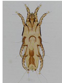
26. Neopteronysus pici