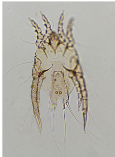
25. Pandalura cirrata