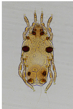
11. Psittophagus galabi