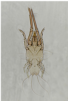
9. Parabdelorhynchus pelecanus