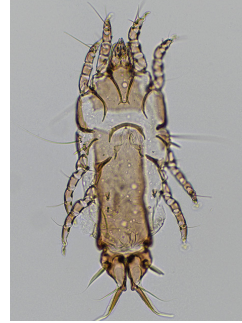
22. Proctophyllodes rubeculinus