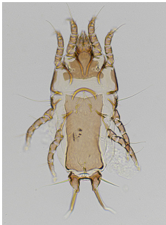
24. Proctophyllodes musicus