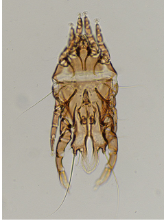
20. Monojoubertia hemiphylla