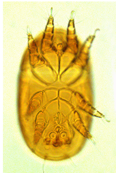
7. Boletoglyphus boletophagi