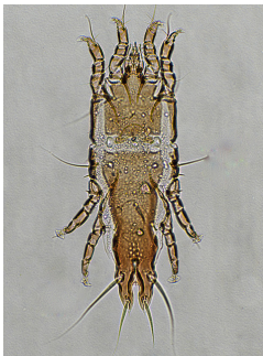
28. Trouessartia bifurcata