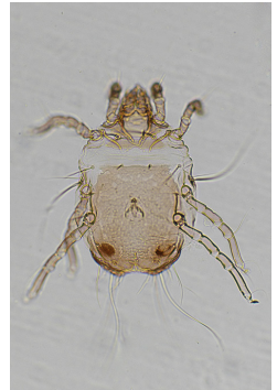
8. Ramogabucinia furcisetia