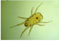
1. Prowichmannia spinifera

Figuur 1-30. Foto's van de nieuwe astigmaten mijten.