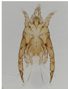
15. Scutomegninia phalacrocoracis