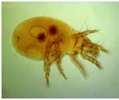
6. Acotyledon pedispinifer