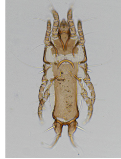
23. Proctophyllodes weigoldi