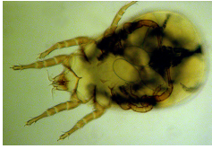
2. Spinanoetus pelznerae