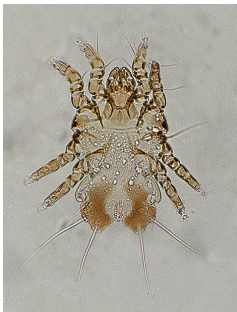
14. Strelkoviacarus quadratus