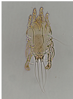
29. Ingrassiella discigera