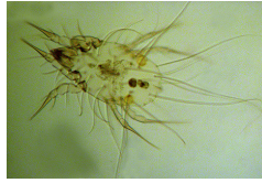
3. Lepidoglyphus burchanensis