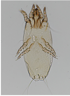
17. Paralges alwari