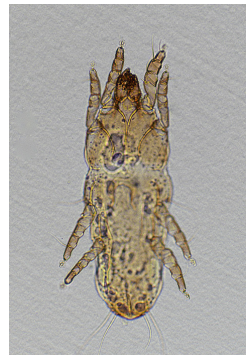
12. Thecarthra grandis