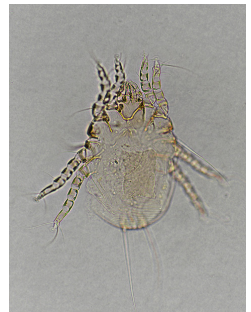
16. Passeroptes dermicola