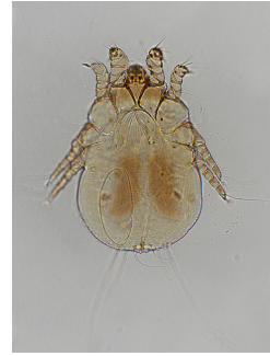
19. Promyalges uncus