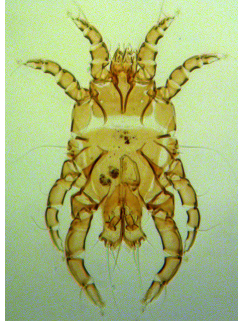
21. Proctophyllodes doleophyes