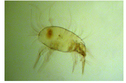
4. Lepidoglyphus fustifer