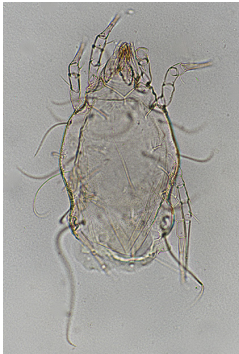
5. Chiroptoglyphus bulgaricus