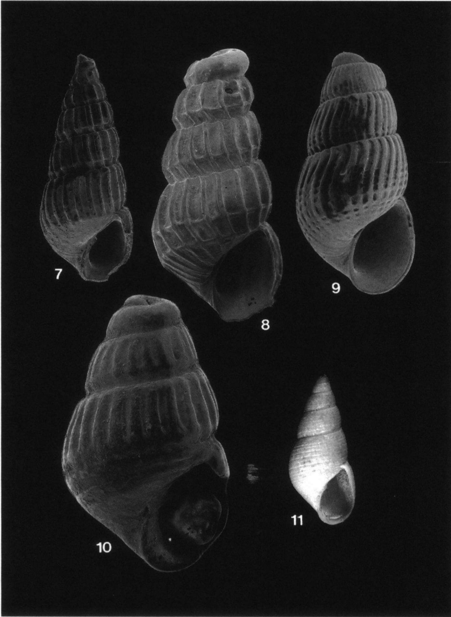
Fig. 7-11. Chrysallida (7-10) and Odostomia (11) spec. 7, C. obtusa (Brown, 1827) [ Chrysallida ( Perparthenina ) farolita Nordsieck, 1972, lectotype (length 3.0 mm)]; 8, C. emaciata (Brusina, 1866) [ C. (Perparthenina) emaciata (Brusina, 1866) form minor Nordsieck, 1972 (length 1.1 mm)]; 9, C. (Besla) sarsi Nordsieck, 1972, lectotype (length: 1.6 mm); 10, C. pellucida (Dillwyn, 1817) [ C. (Partulida) lacourti Nordsieck, 1972, lectotype (length 1.4 mm)]; 11, Odostomia (Evalea) elegans A. Adams, 1860, neotype (length 4.0 mm).