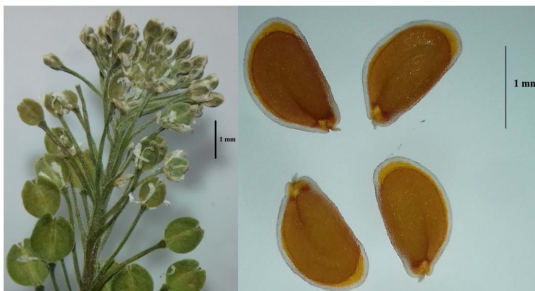
Fig. 3. Inflorescence (left) and seeds (right) of Lepidium virginicum .