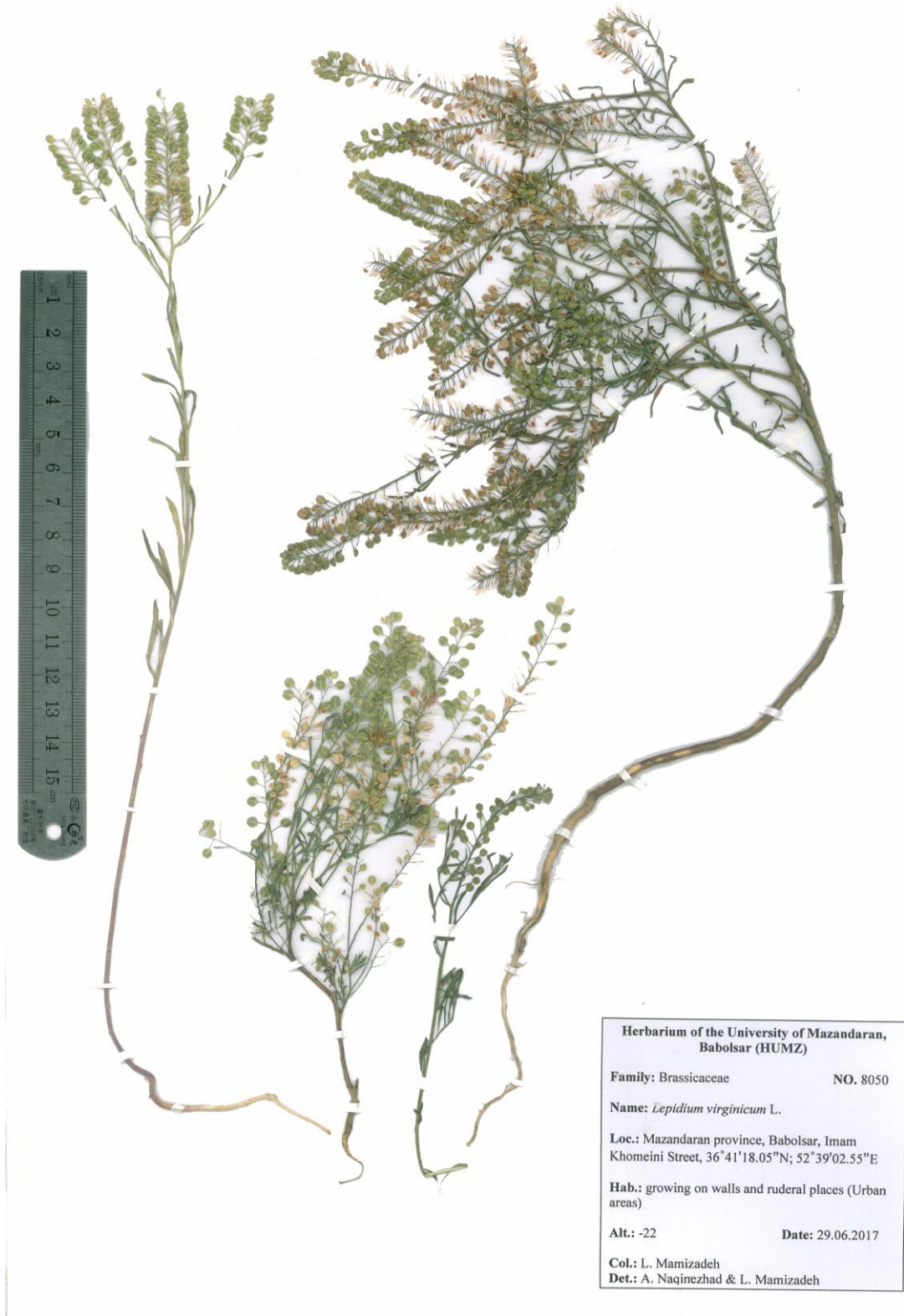
Fig. 1. Lepidium virginicum .