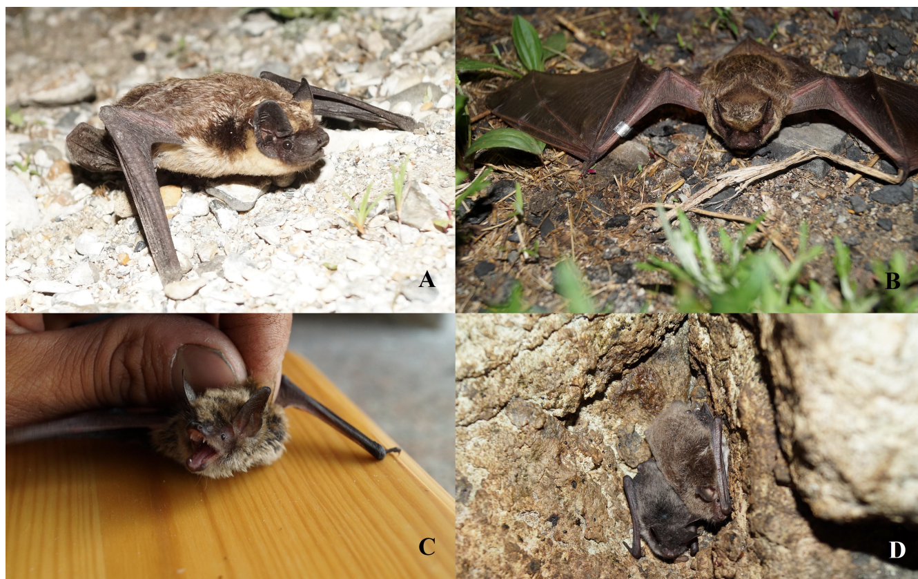
Fig. 2. Bat species of the Daurian steppe. Designations: A – Vespertilio murinus on Torey lakes (Russia); B – band tagged Vespertilio sinensis on Torey lakes (Russia); C – captured Myotis davidii on Lake Hulun-Nuur (China); D – female and young Myotis petax on Lake Hulun-Nuur (China).