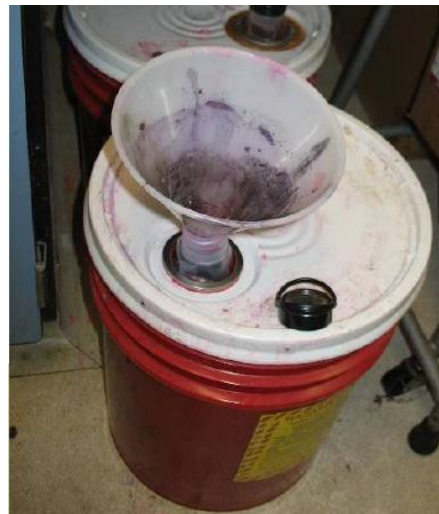
This container is considered “open”. If not actively adding to or removing from the container, remove funnel and close the container.