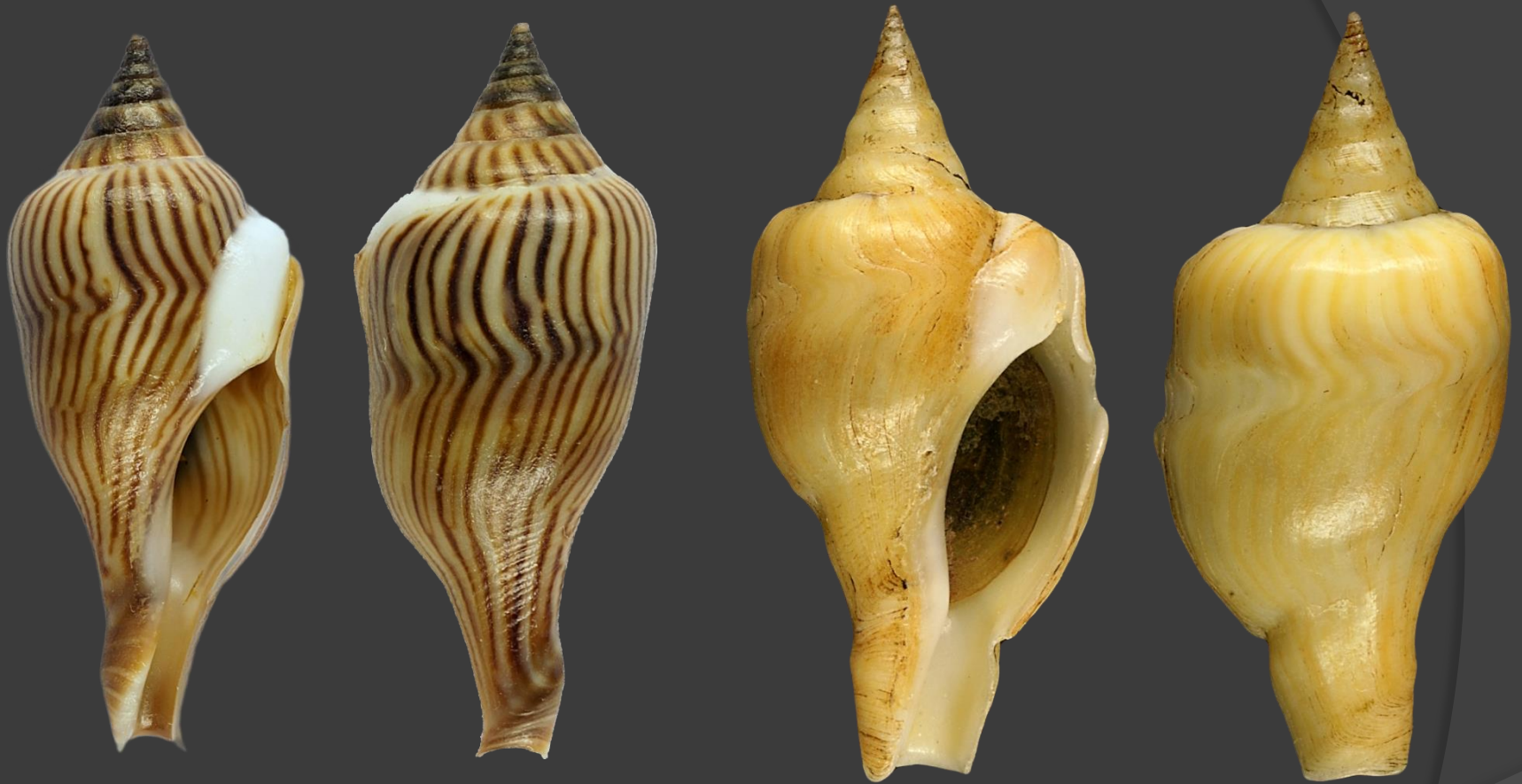
Cacuaco, north of Luanda, Angola - dredged at -18 m in muddy sand - 1992