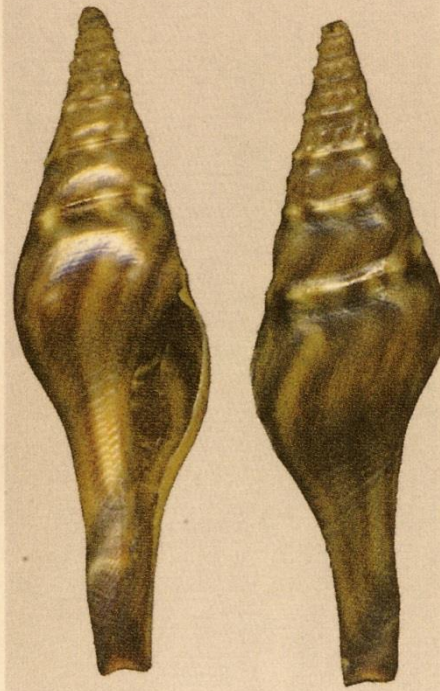
Fusiturris kribiensis Paratipo 1