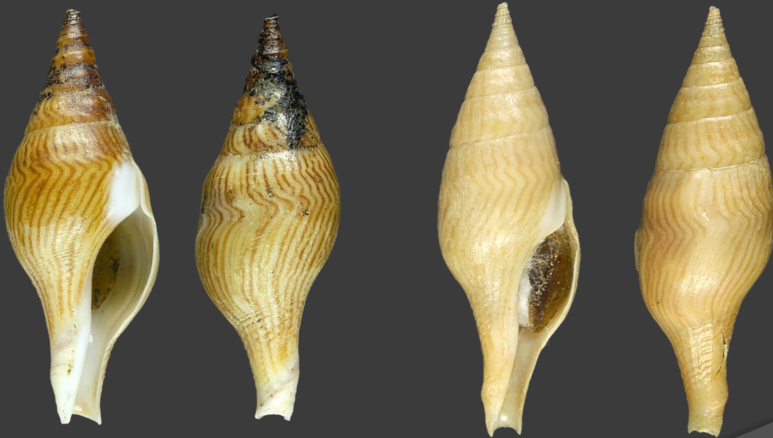
Trawled off Abidjan, Ivory Coast