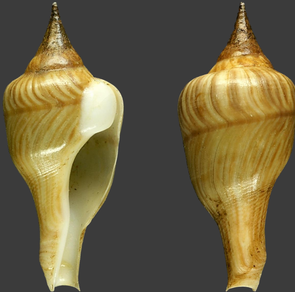
Cacuaco, north of Luanda, Angola - dredged at -18 m in muddy sand - 1992