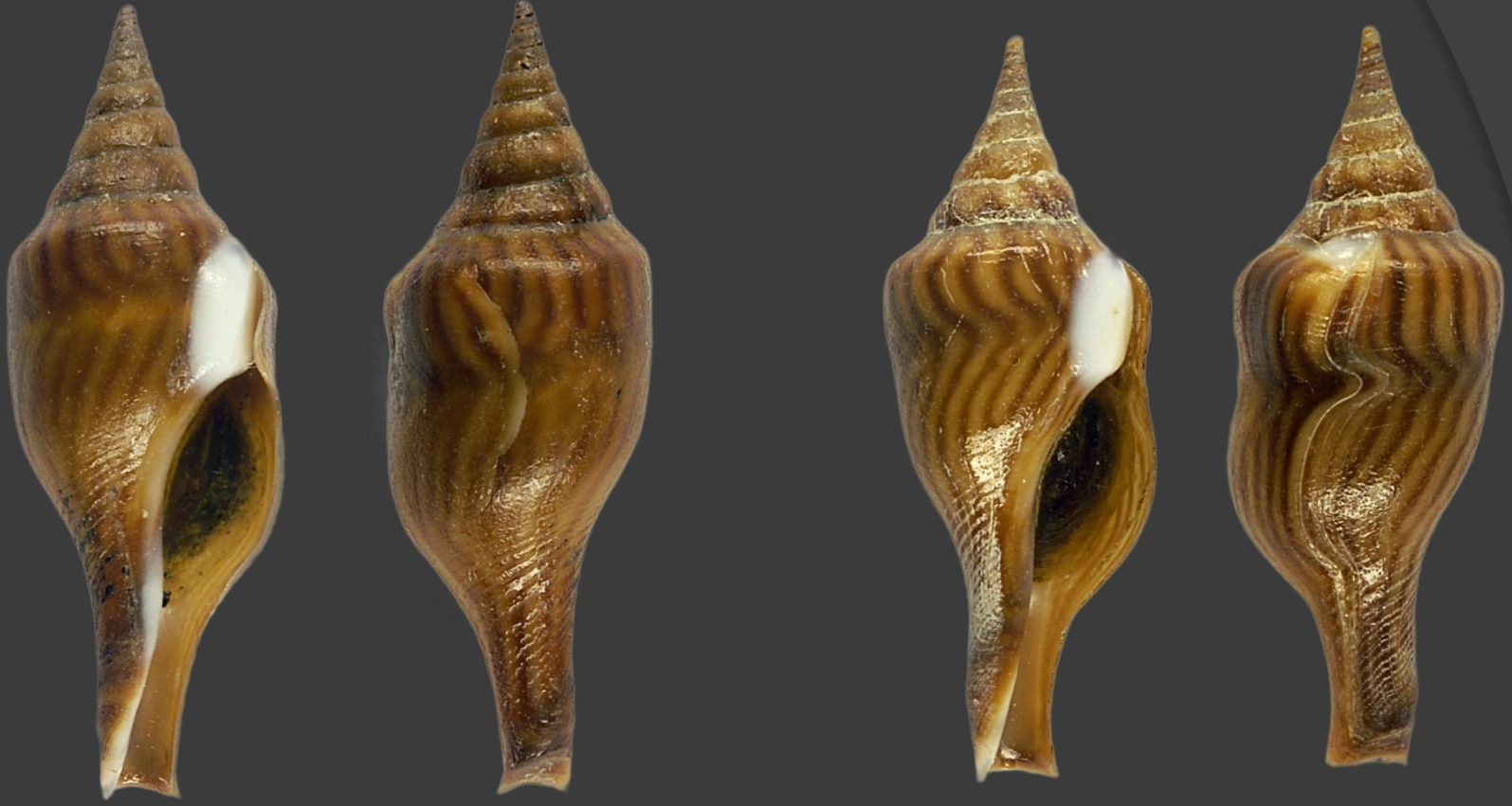
Cacuaco, north of Luanda, Angola - dredged at -18 m in muddy sand - 1992