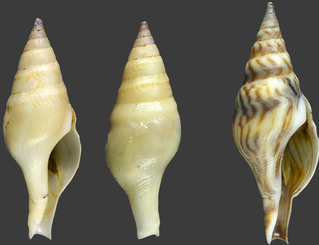
Barra do Bengo, Angola – trawled at -50 m – 1982