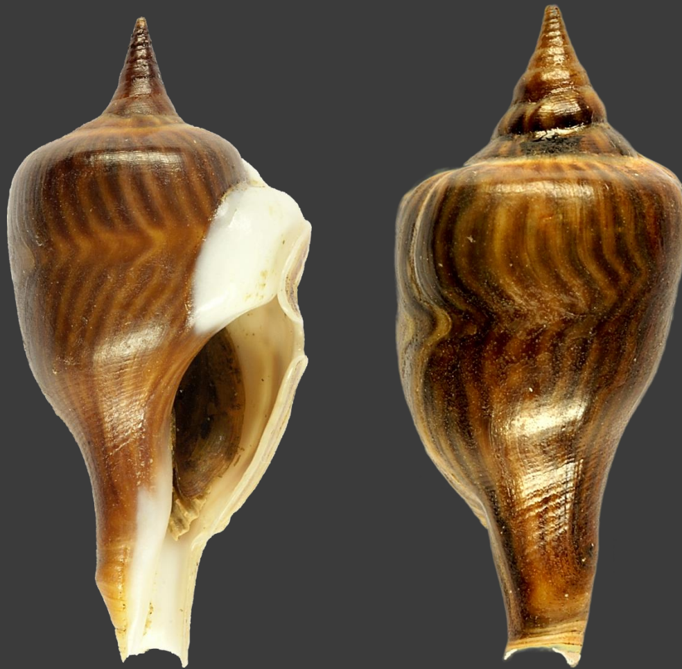
Cacuaco, north of Luanda, Angola - dredged at -18 m in muddy sand - 1992