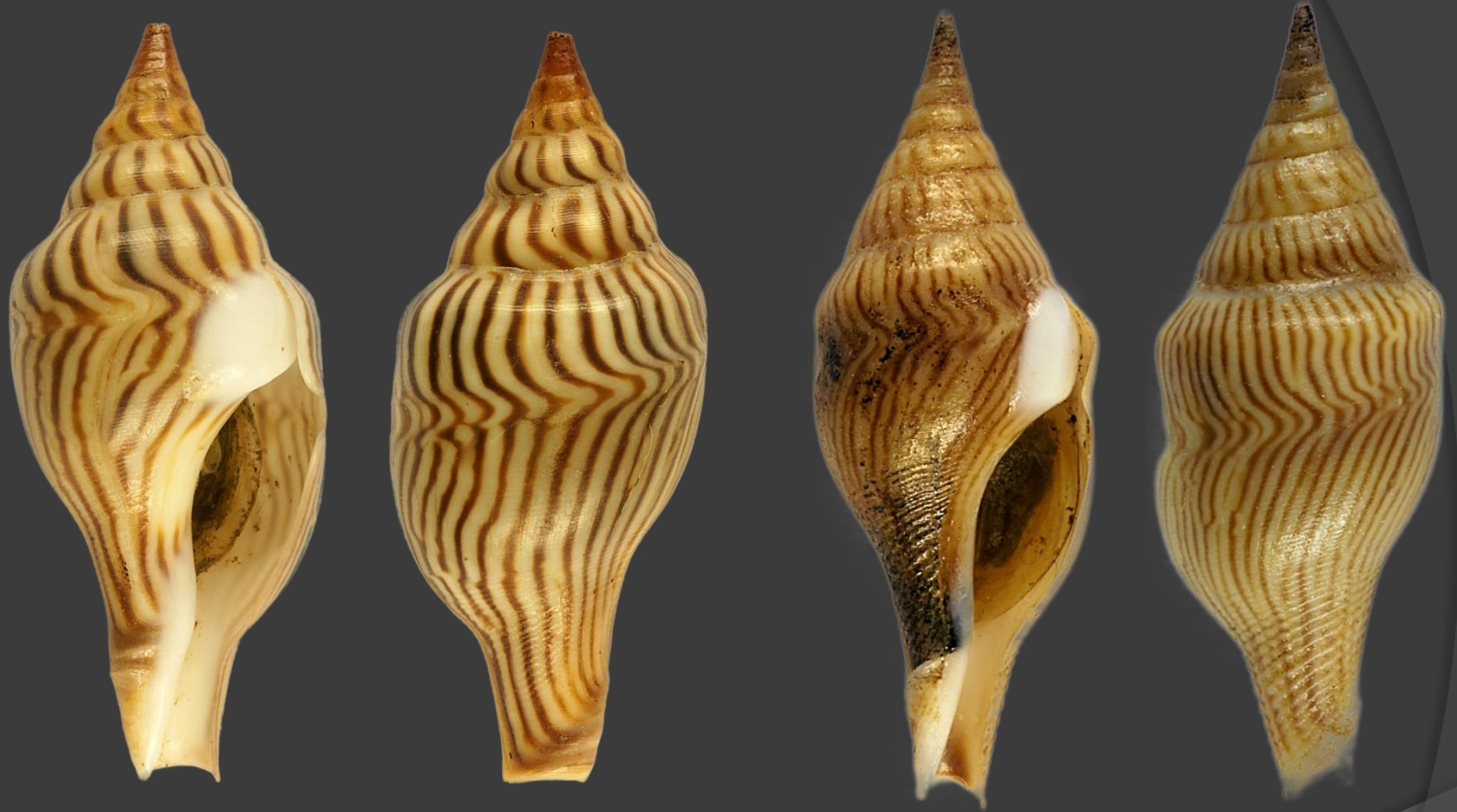
Cacuaco, north of Luanda, Angola - dredged at -18 m in muddy sand - 1992