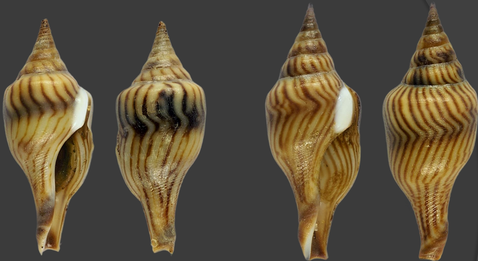
Cacuaco, north of Luanda, Angola - dredged at -18 m in muddy sand - 1992