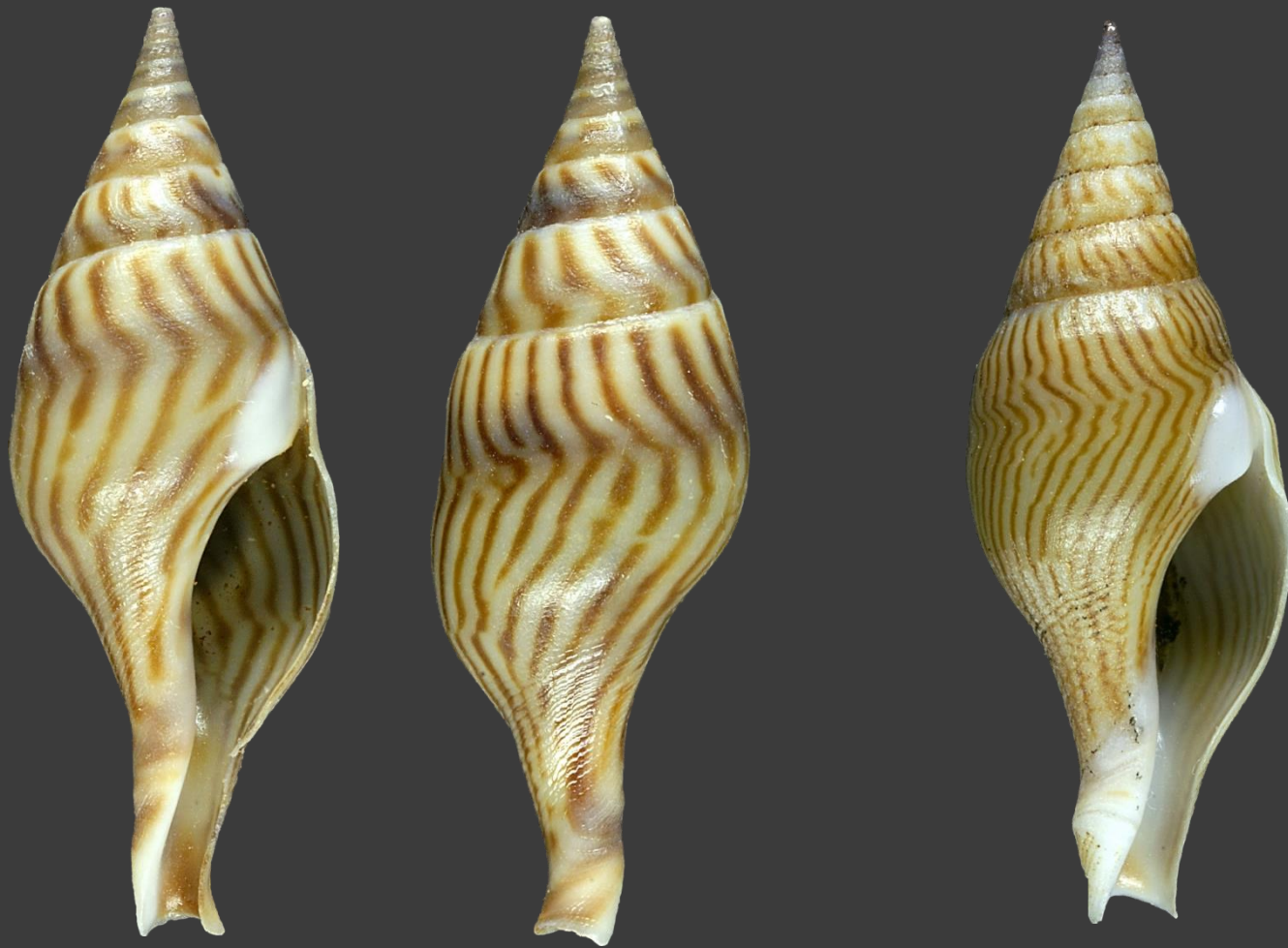
Pointe Noire, Congo Brazzaville dredged at -6 m – December 1980