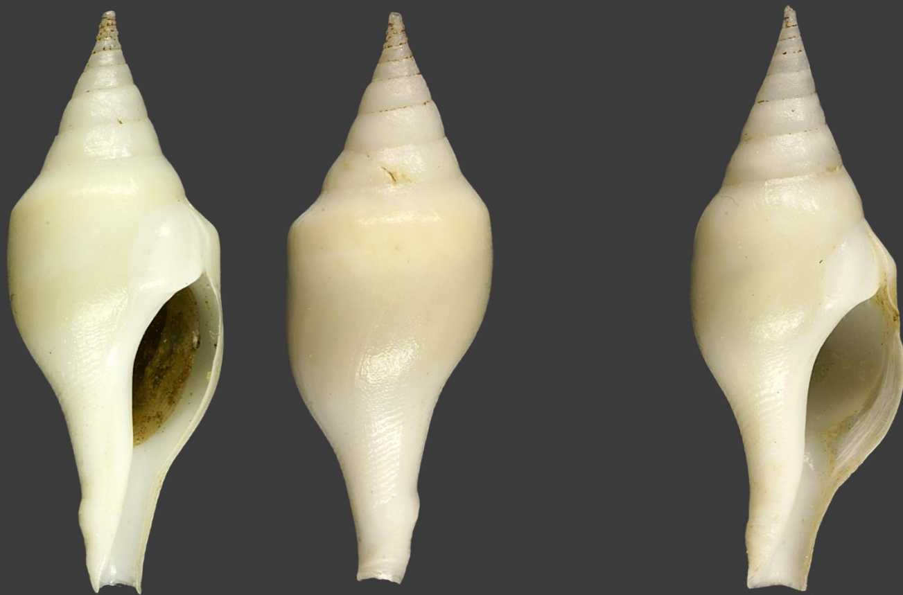
Cacuaco, north of Luanda, Angola - dredged at -18 m in muddy sand - 1992