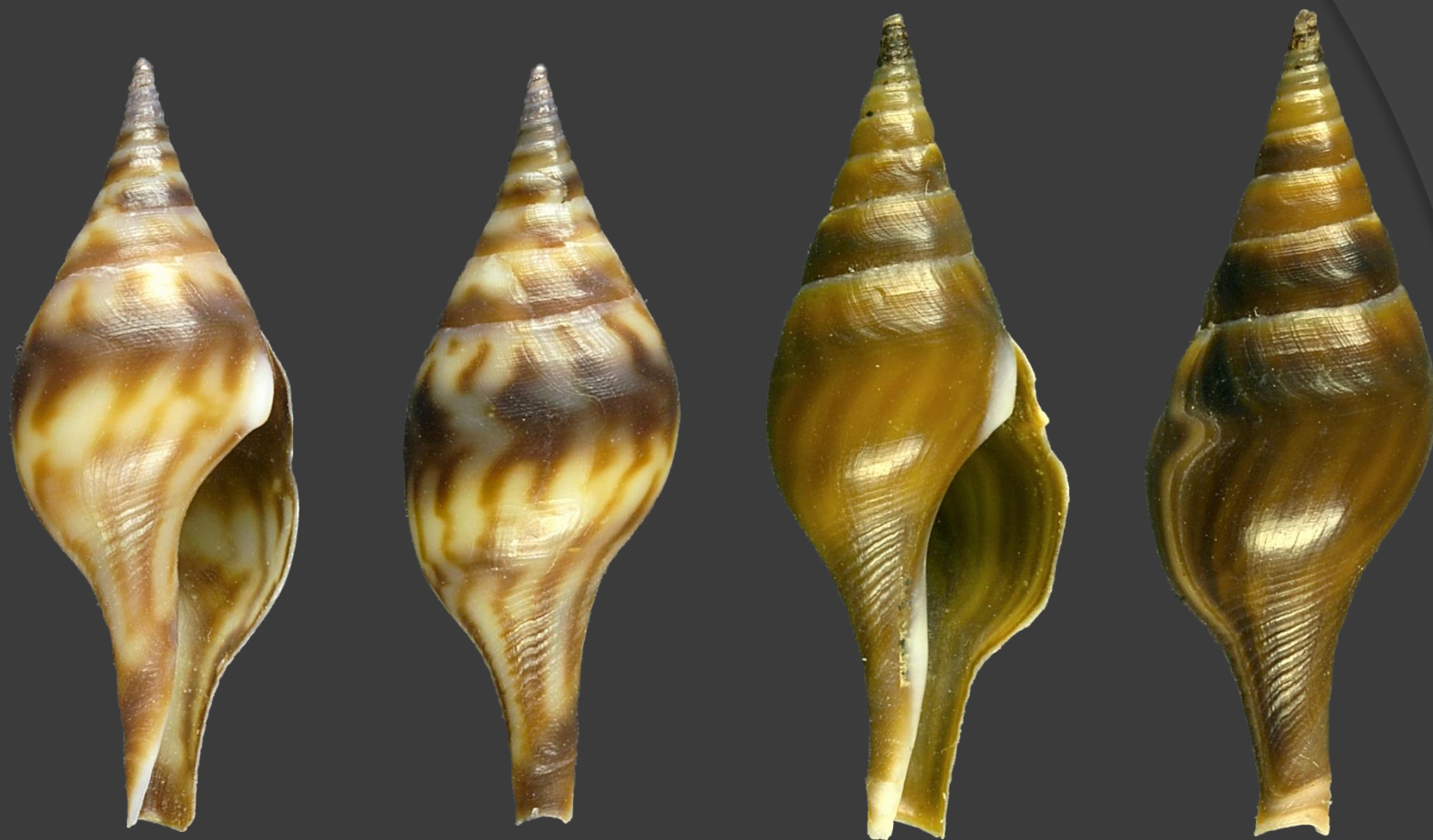
Barra do Bengo, Angola – trawled at -50 m – 1982