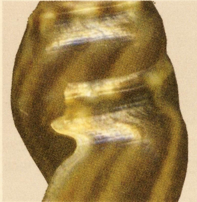
Fusiturris kribiensis Paratipo 1, seno labiale