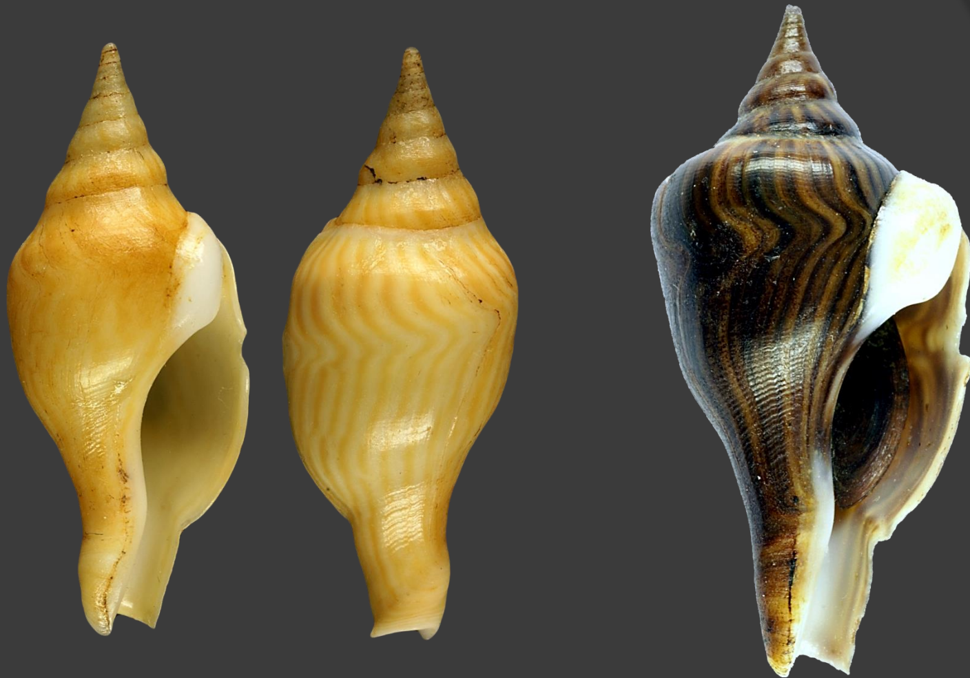
Cacuaco, north of Luanda, Angola - dredged at -18 m in muddy sand - 1992