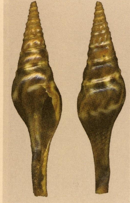
Fusiturris kribiensis Paratipo 2