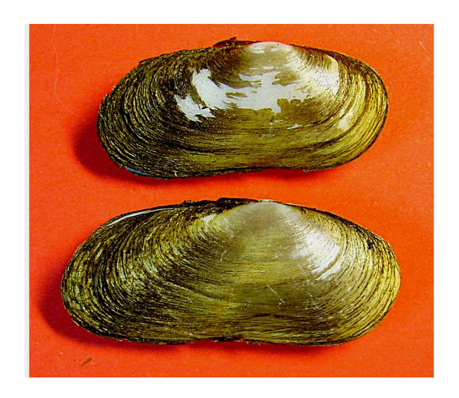
Punzo, Italy 21,5/44,5 mm collection F. Nolf

Santa Cruz de La Palma, La Palma, Canary Islands above: 16,5/35,0 mm; below: 19,0/41,0 mm collection F. Nolf