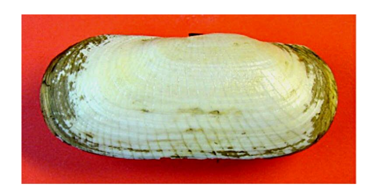
Malaga, Spain – trawled by fisherman 28,0/63,5 mm – collection F. Nolf