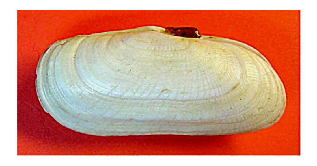
Cardigan Bay, Irish Sea, United Kingdom – taken by Ostend fisherman 23,5/49,5 mm collection F. Nolf