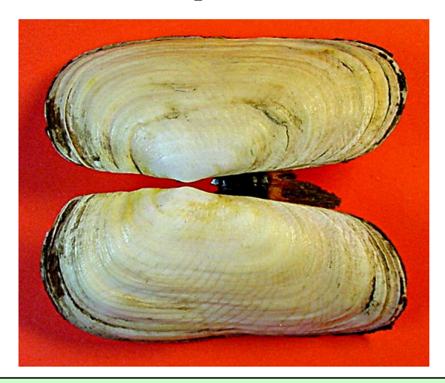
off Plouharnel, Morbihan, French Brittany, West France 33.5/69.0 mm – collection F. Nolf