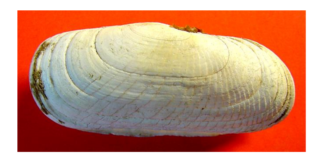
Scilly Isles, Channel Islands, United Kingdom 21,0/47,0 mm collection J. Verstraeten