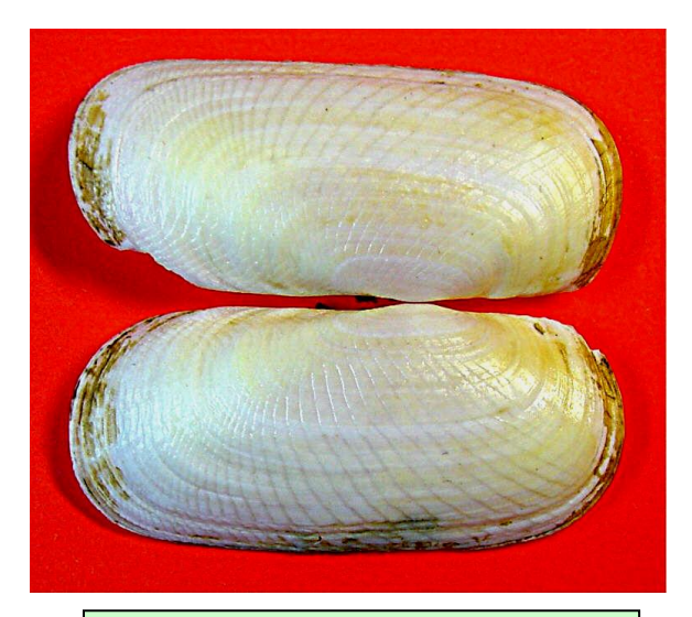
Lagos, Portugal – trawled by fisherman 27.5/60.0 mm – collection F. Nolf