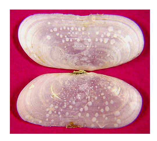
trawled off Lands End, SW England collection R. Vanwalleghem