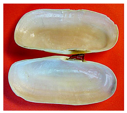
Pointe de Mousterlin, off Bénodet, French Brittany, West France 21,5/49,0 mm collection F. Nolf